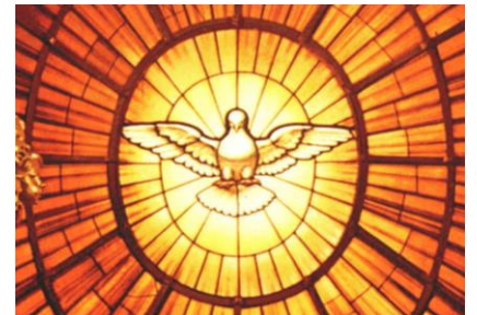
St. Peter Basilica, Rome: Holy Spirit window.

As with the Hebrew ruah , the Greek word pneuma can likewise mean “wind,” “breath,” or “spirit.” But in the New Testament, we also see explicitly what was hinted at in the Old Testament: that the Spirit is not an impersonal force, but a divine Person, who is God along with the Father and the Son.