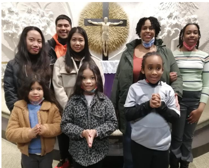
Students of St. Albert the Great School receive a Blessing after submitting their 1 st Communion registration forms at Mass.