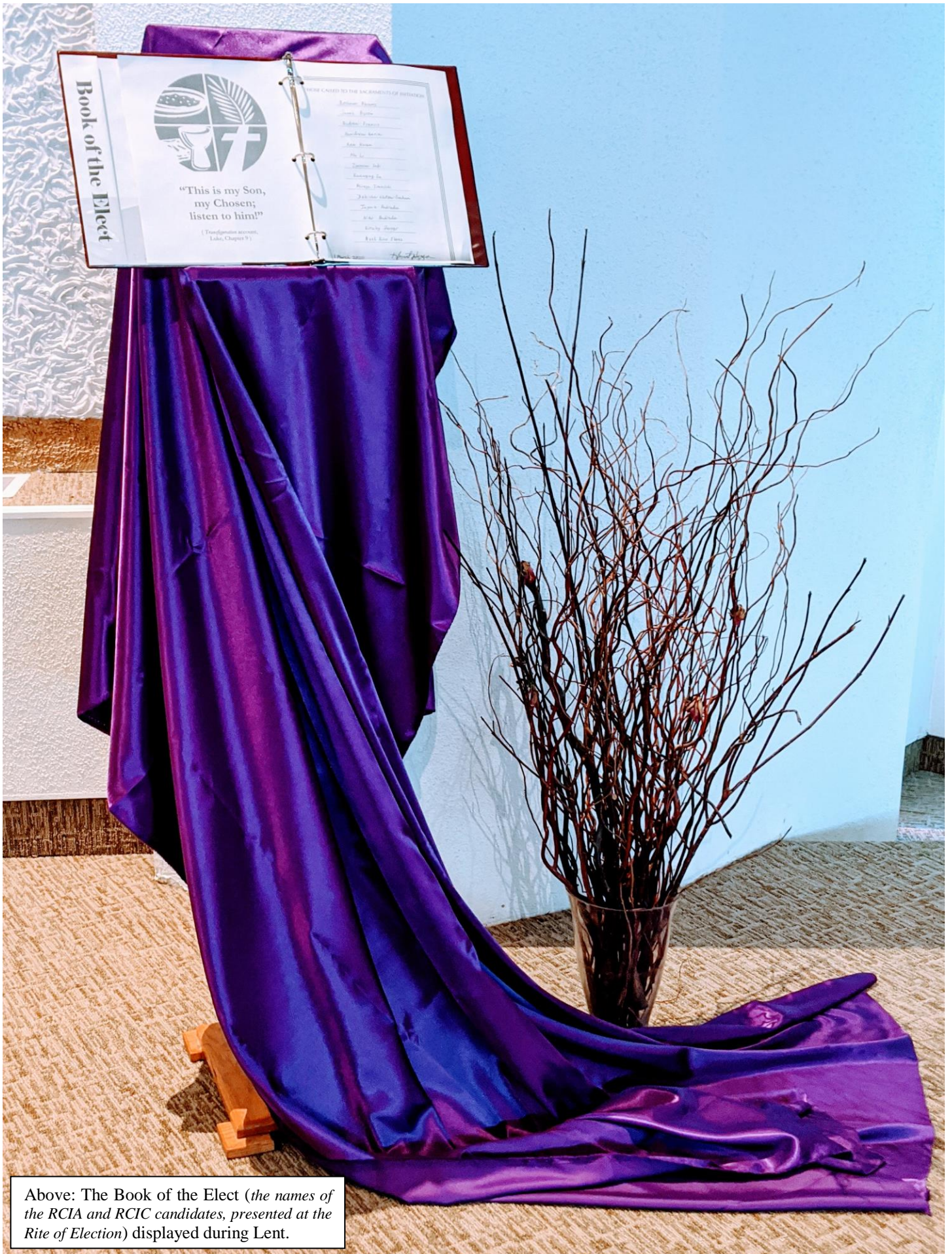
Above: The Book of the Elect (the names of the RCIA and RCIC candidates, presented at the Rite of Election) displayed during Lent.