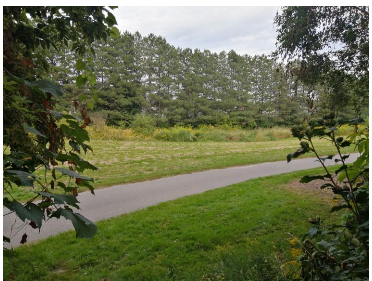
The former creek bed that runs North to South, East of the homes in Treverton Park. The Via rail line runs parallel, behind the trees.