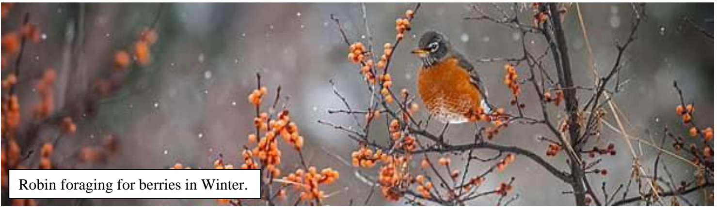
Robin foraging for berries in Winter.