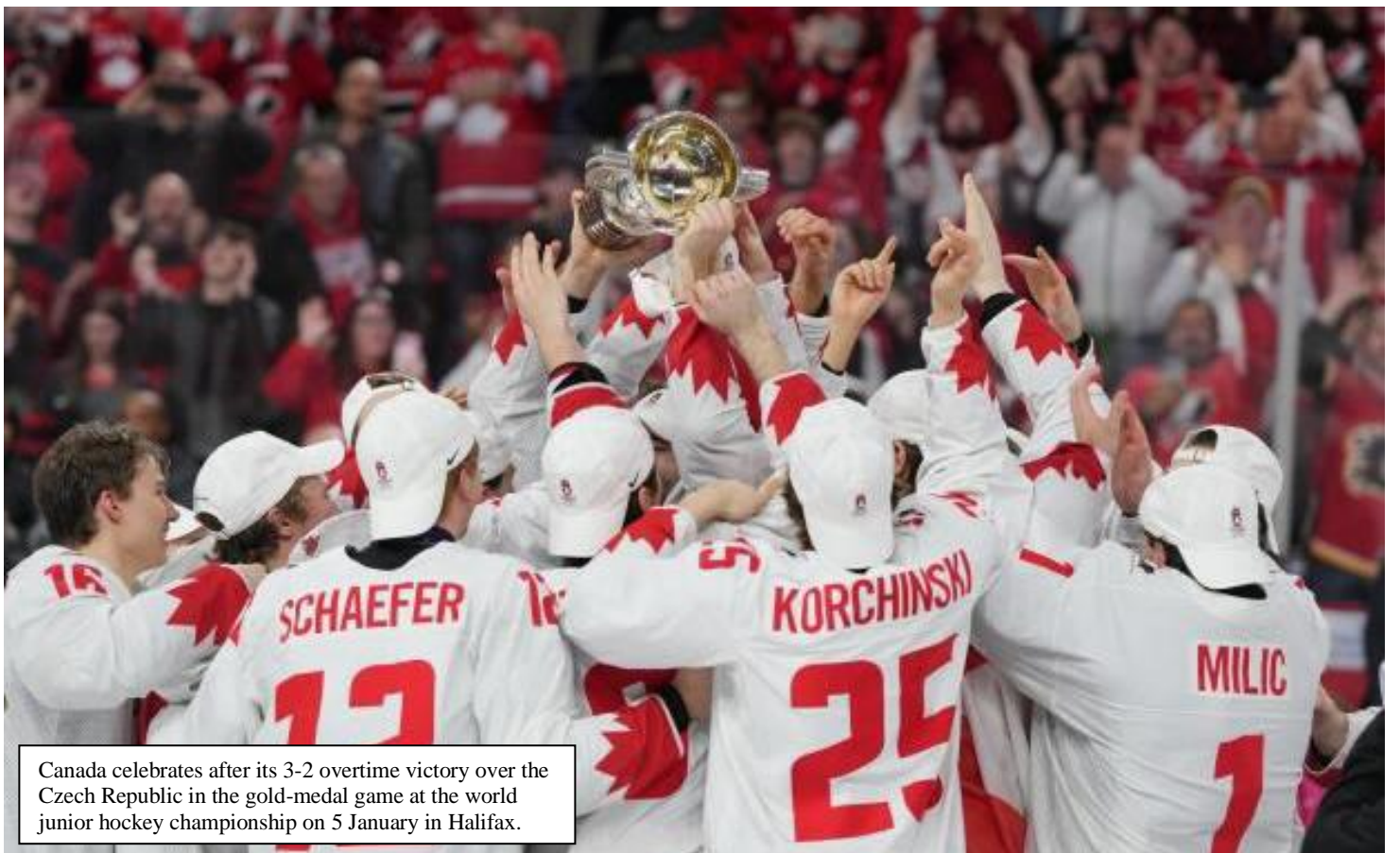
Canada celebrates after its 3-2 overtime victory over the Czech Republic in the gold-medal game at the world junior hockey championship on 5 January in Halifax.