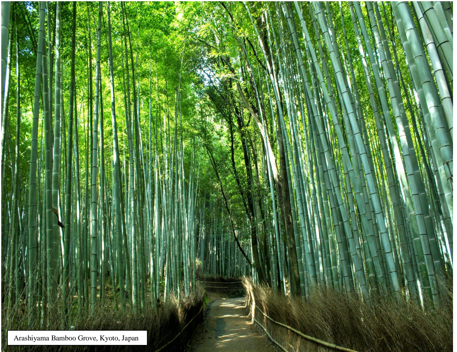
Arashiyama Bamboo Grove, Kyoto, Japan