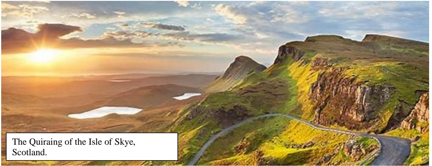
The Quiraing of the Isle of Skye, Scotland.