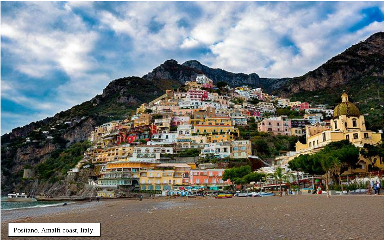
Positano, Amalfi coast, Italy.