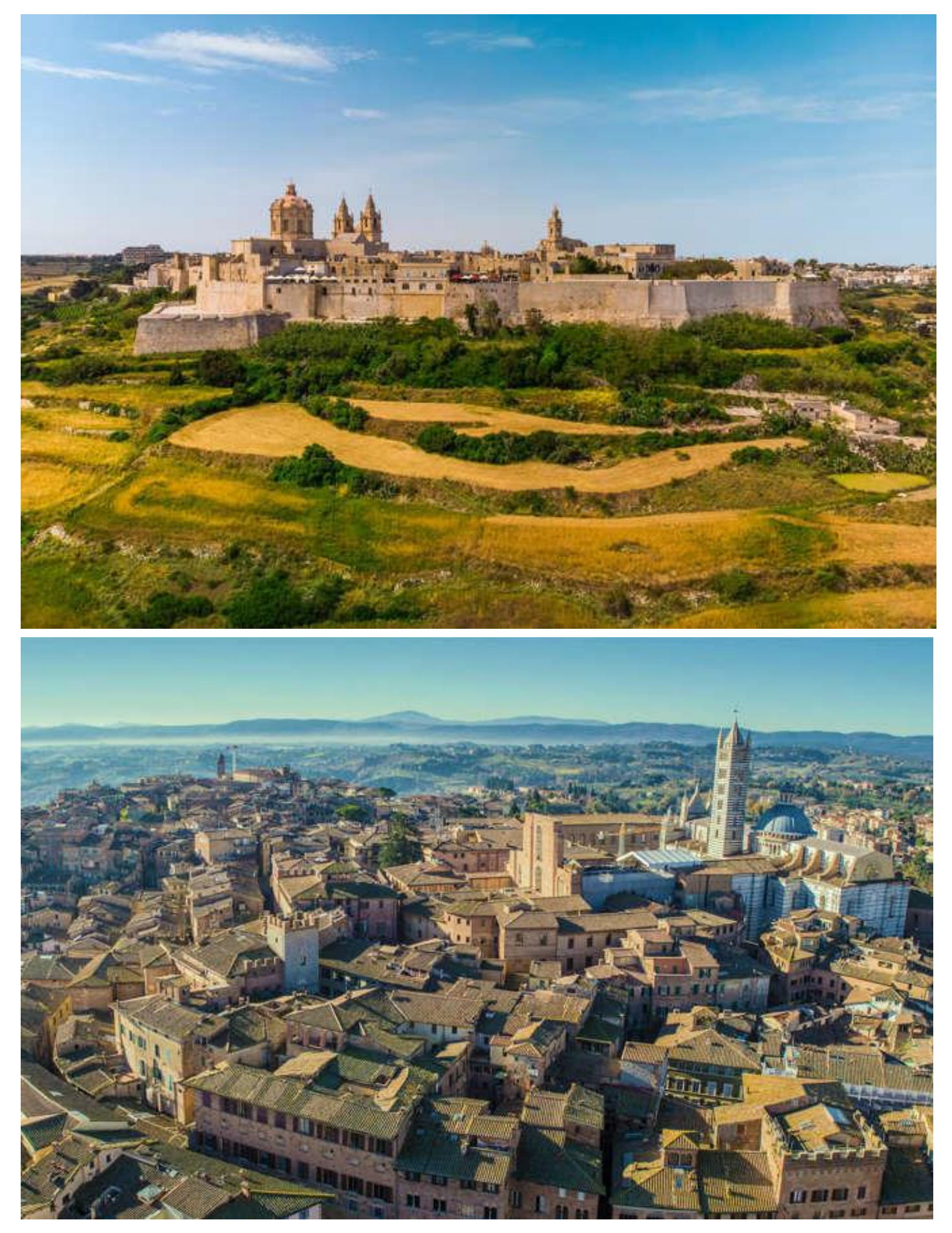
Mdina, Malta; Siena, Italy