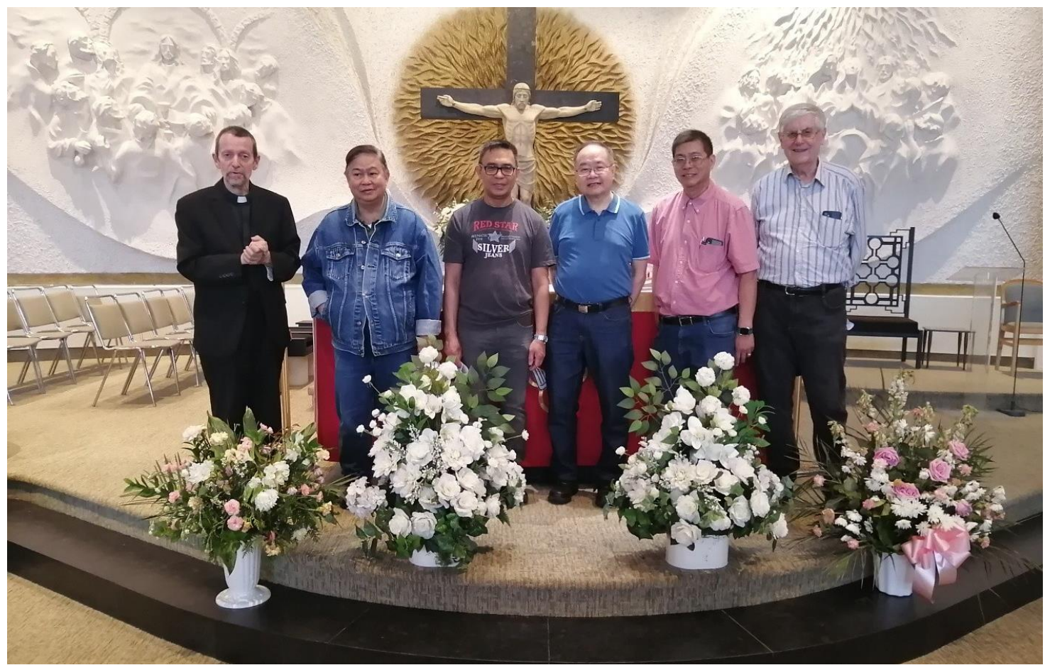
Blessed Trinity Parish Men's Prayer Group