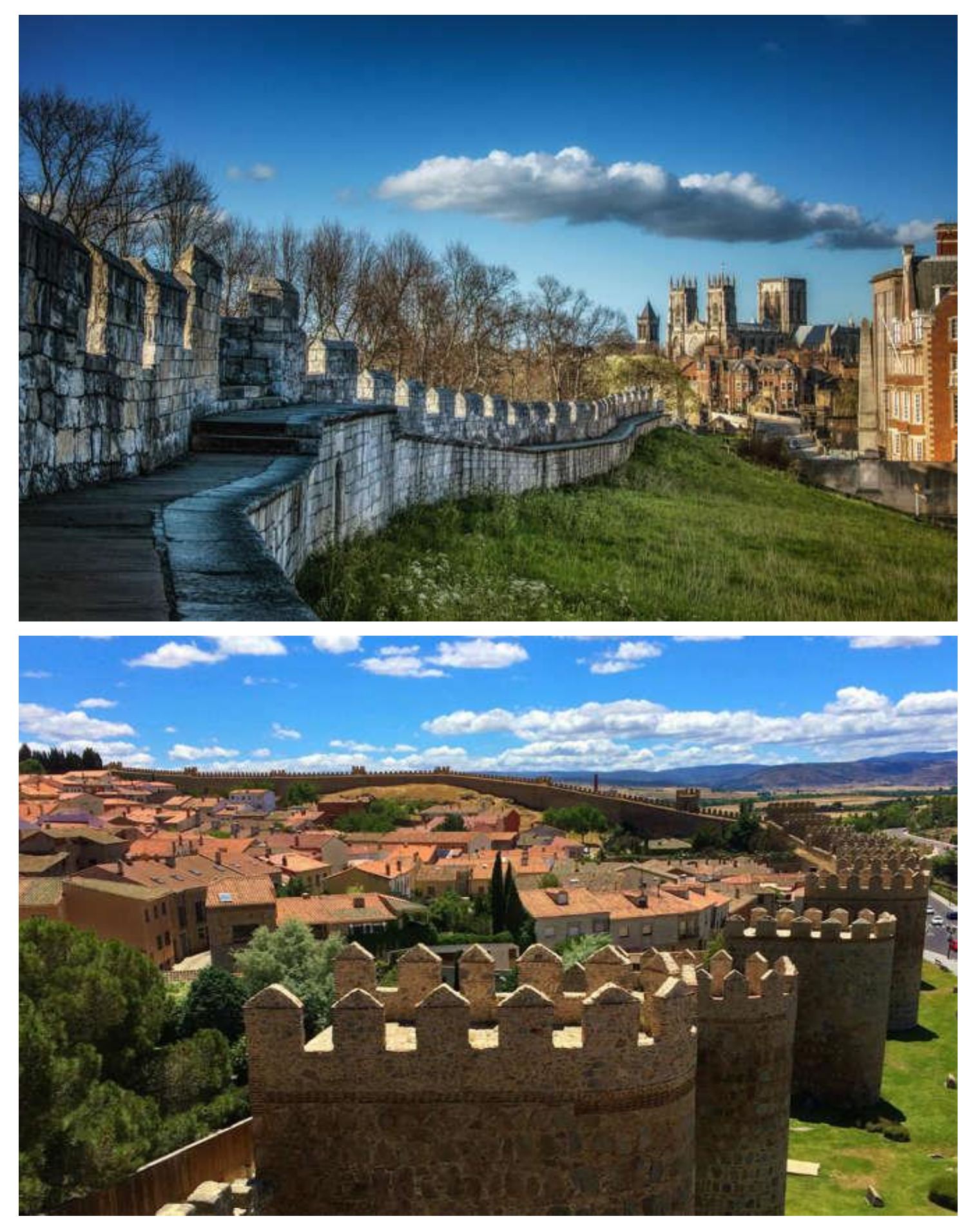
York, UK; Avila, Spain