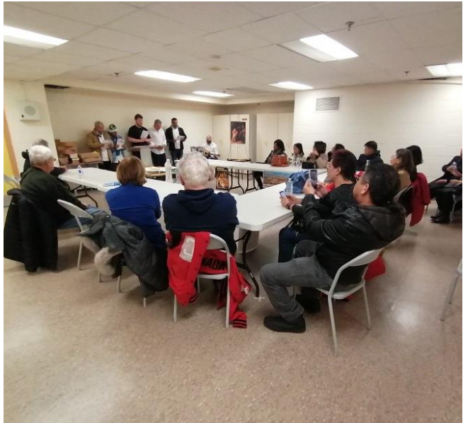
11 November: [above & right:] The PRODIGAL SON was the theme of the Spiritual Presentation hosted by the Knights of Columbus following the 5.00 pm Mass. Below: The Knights sponsored the Remembrance ceremony at the 5.00 pm Mass.