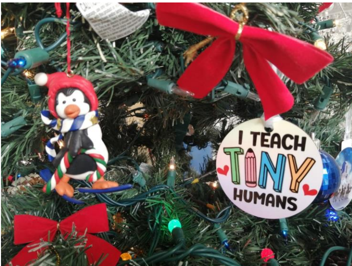
St. Agatha School