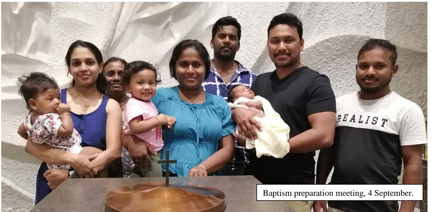
Baptism preparation meeting, 4 September.