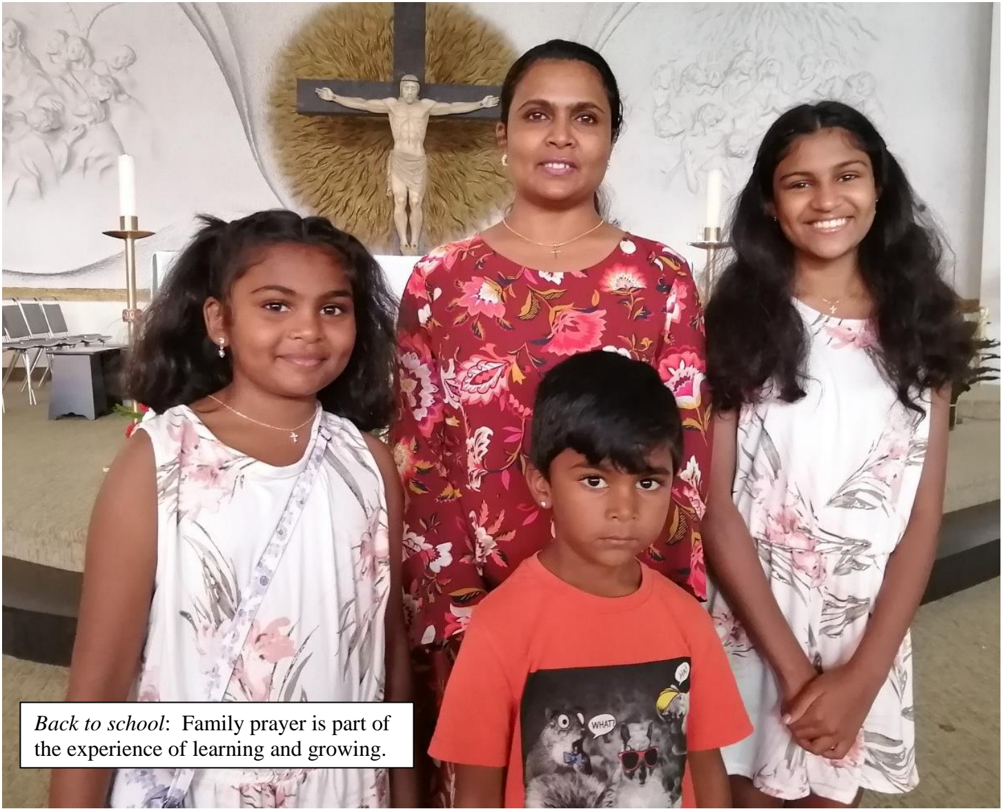
Back to school: Family prayer is part of the experience of learning and growing.