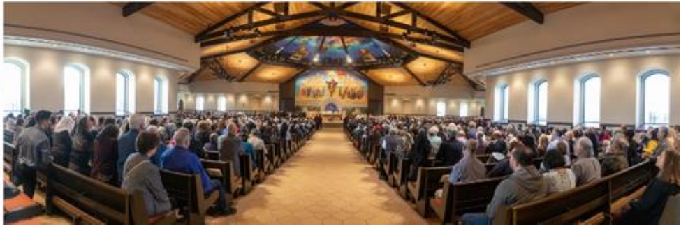
Above: Dedication of St. Charles Borromeo Church , Visalia, California. Capacity: 3,200.