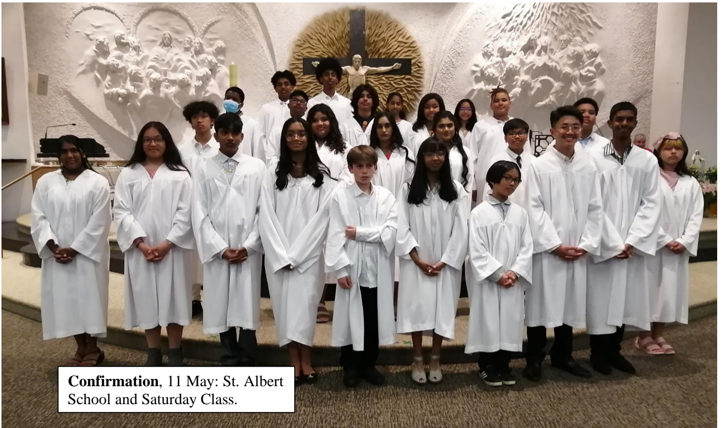
Confirmation, 11 May: St. Albert School and Saturday Class.