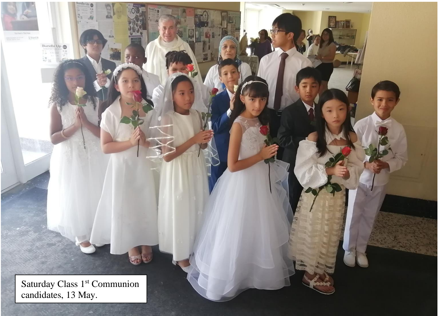
Saturday Class 1 st Communion candidates, 13 May.