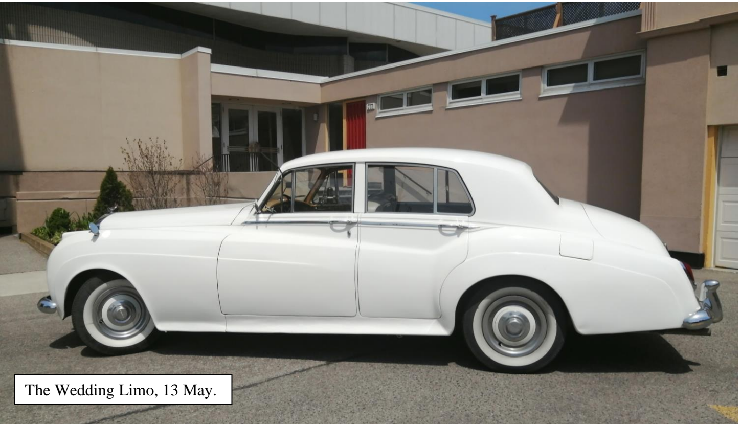
The Wedding Limo , 13 May.