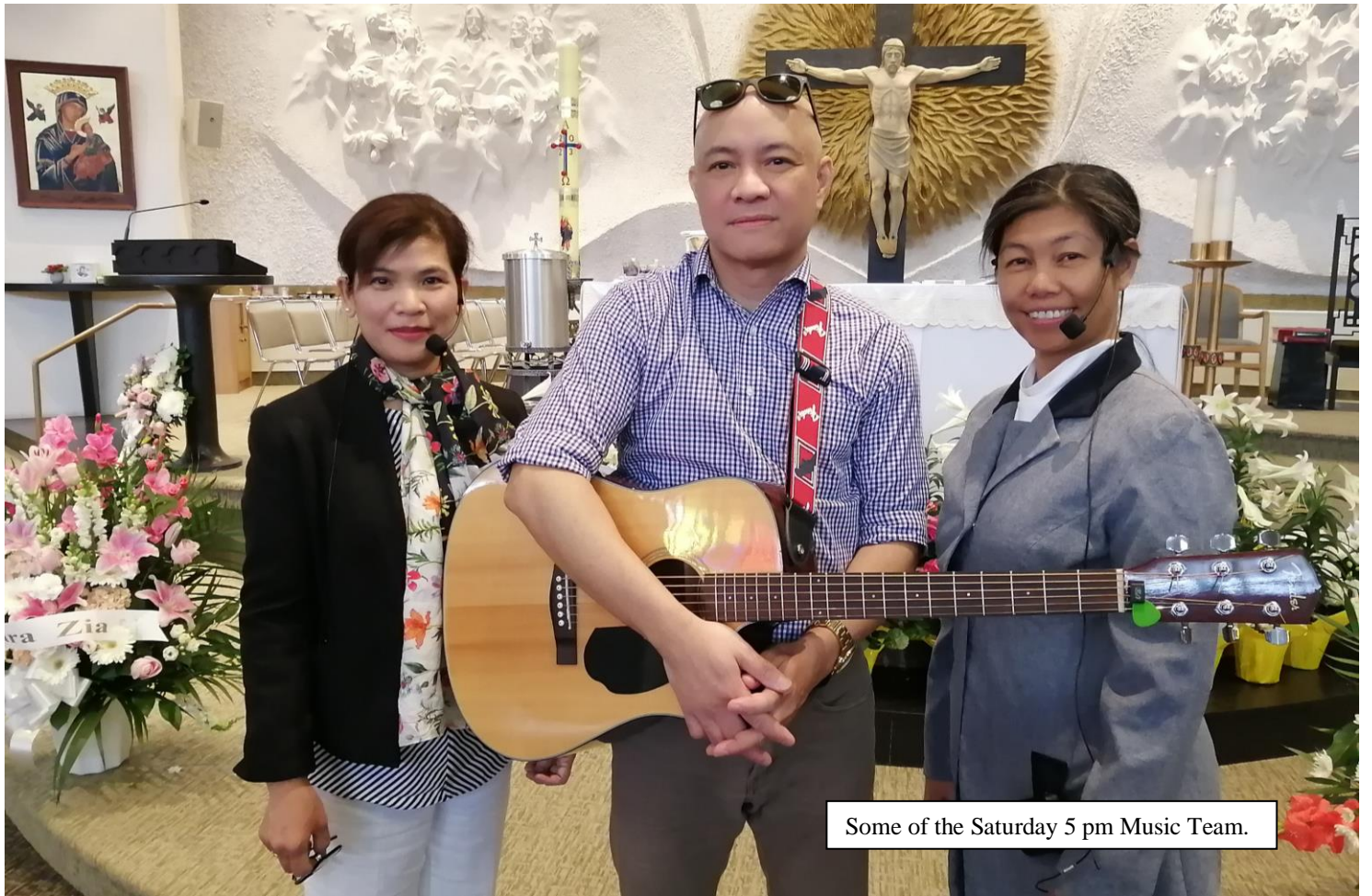
Some of the Saturday 5 pm Music Team.