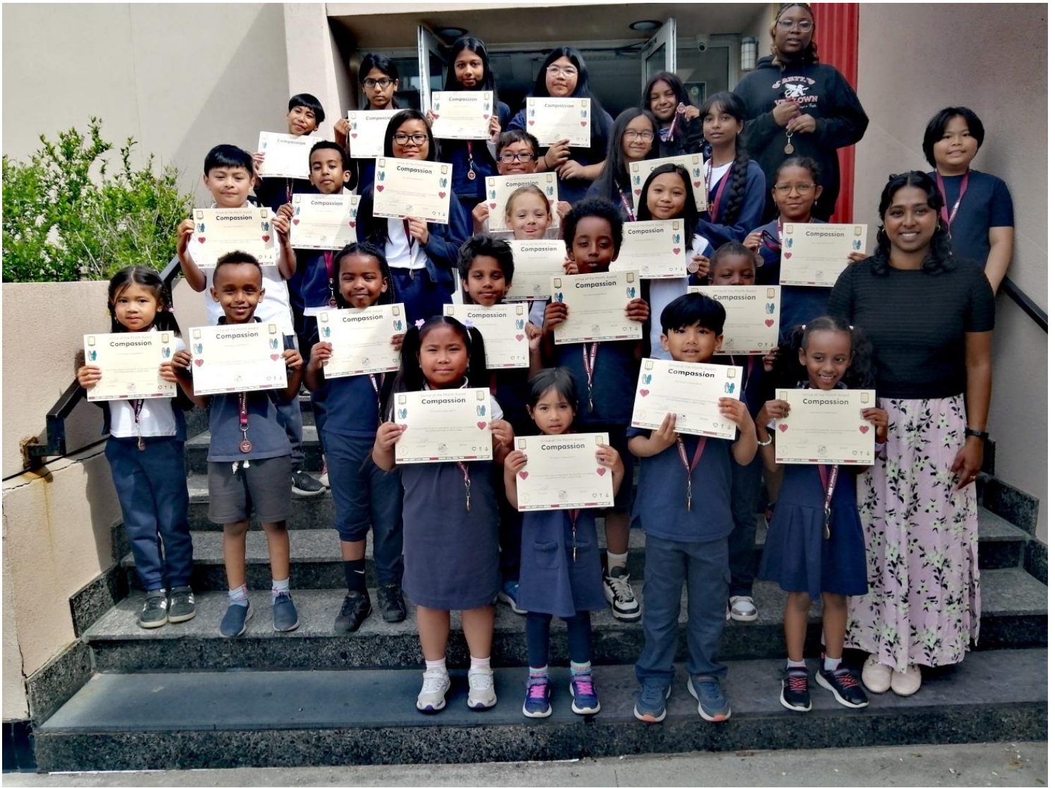
St. Maria Goretti: Last day of school, 25 June 2026.