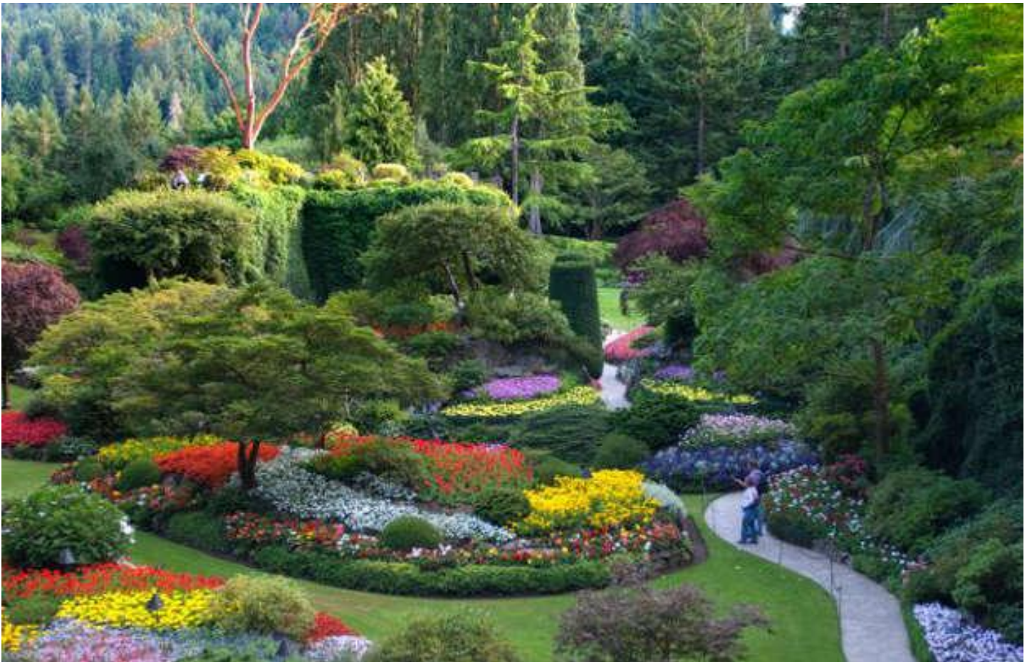
Below: Butchart Gardens, British Columbia