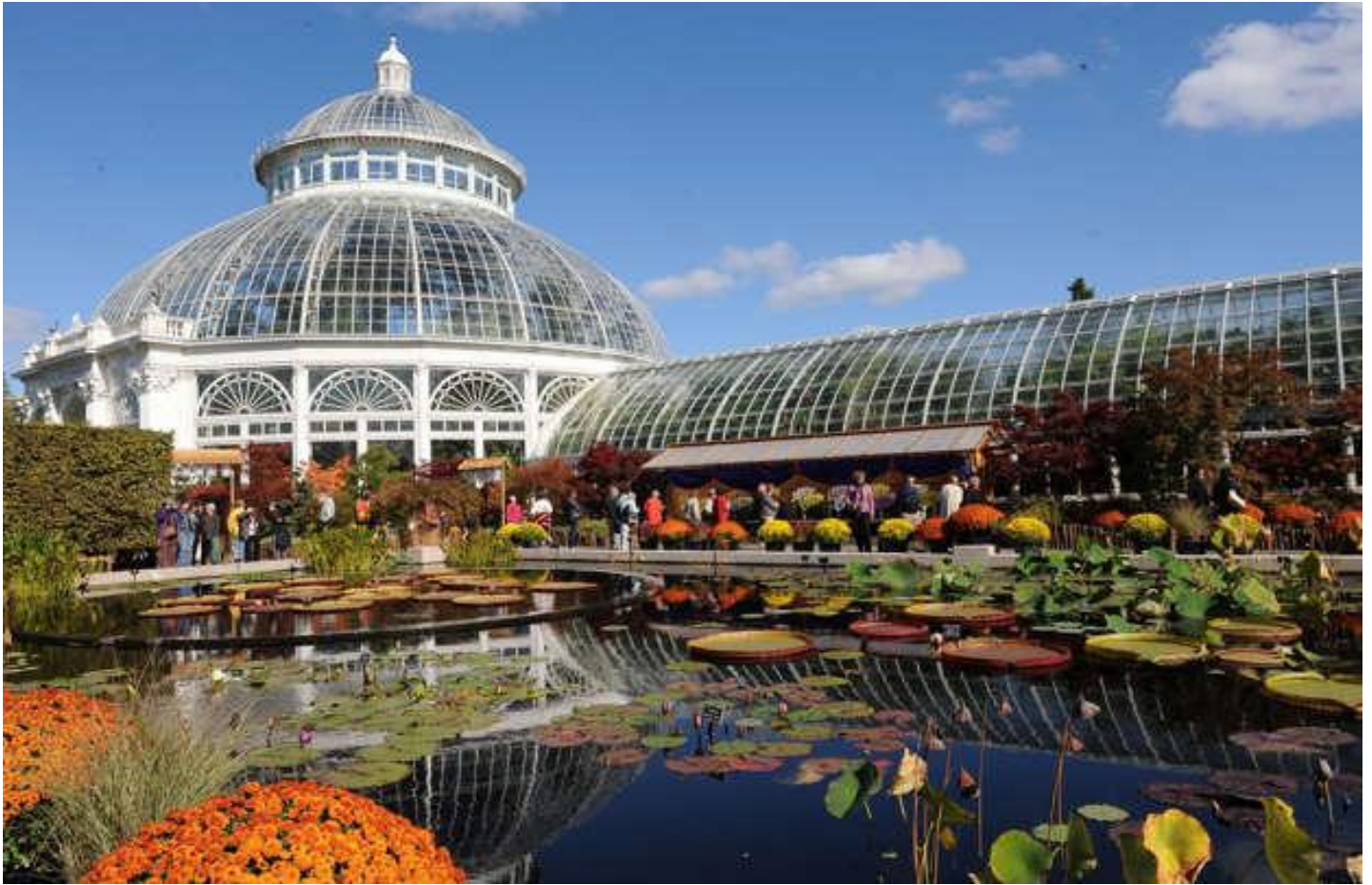
Above: New York botanical gardens, Bronx, NY