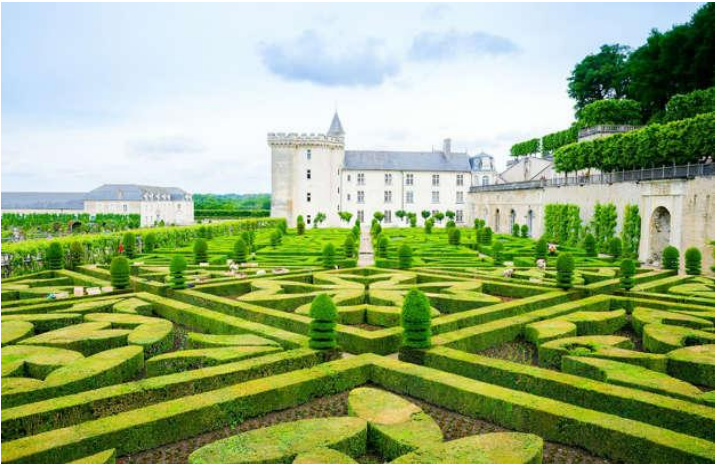
Above: Jardins de Villandry, France