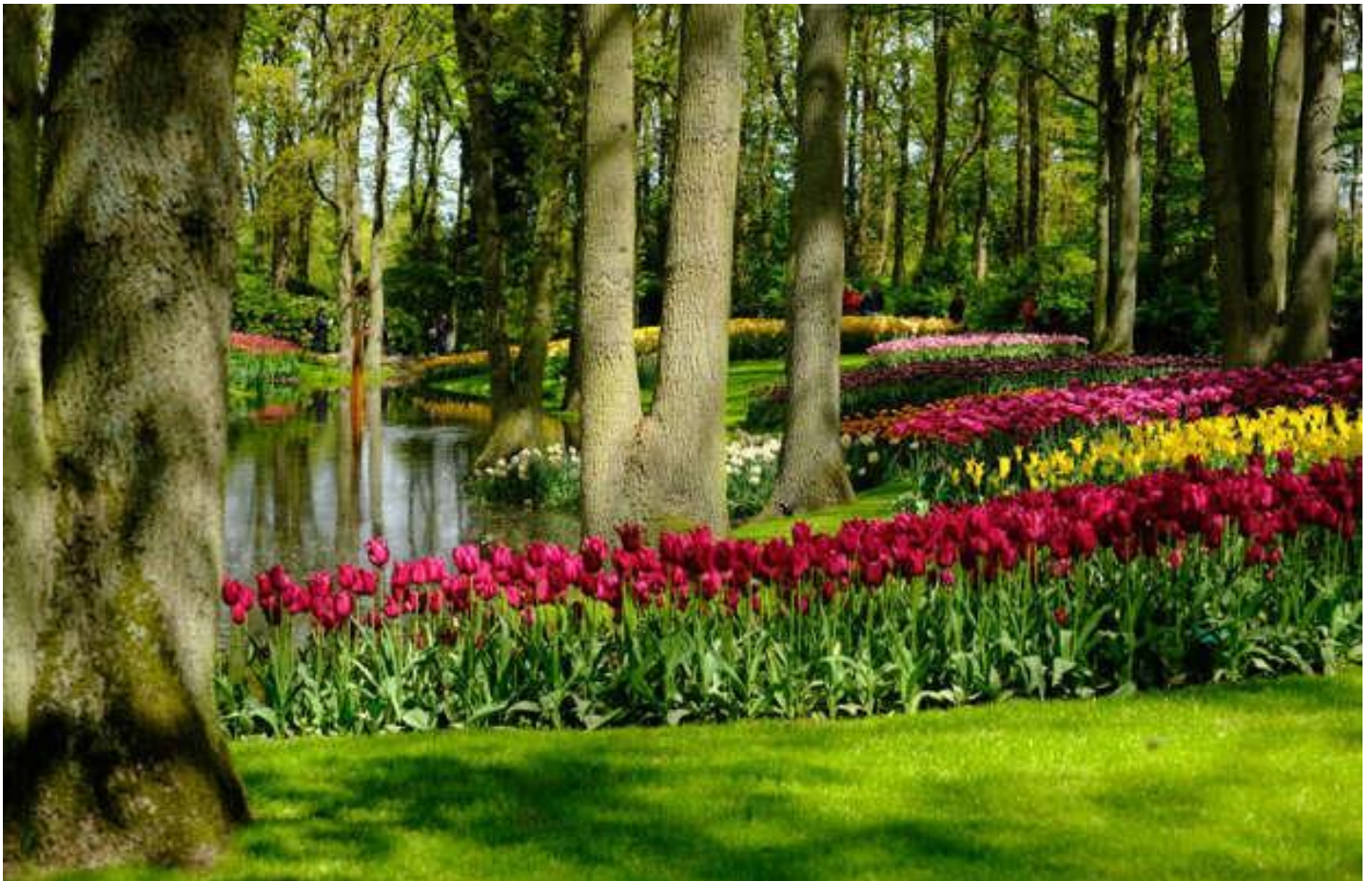
Below: Keukenhof, Lisse, Netherlands