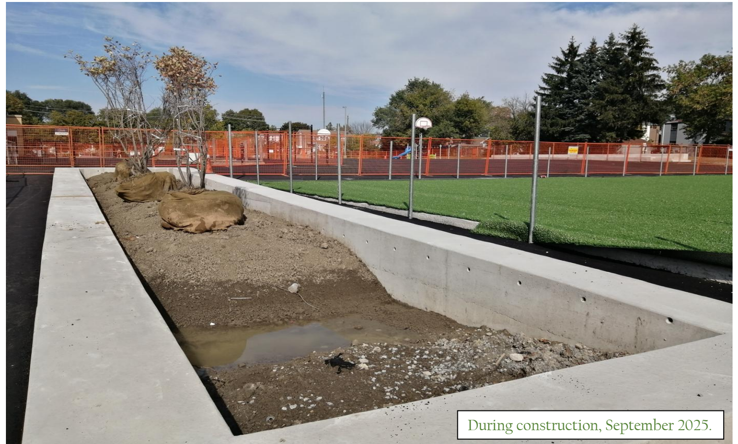
During construction, September 2025.