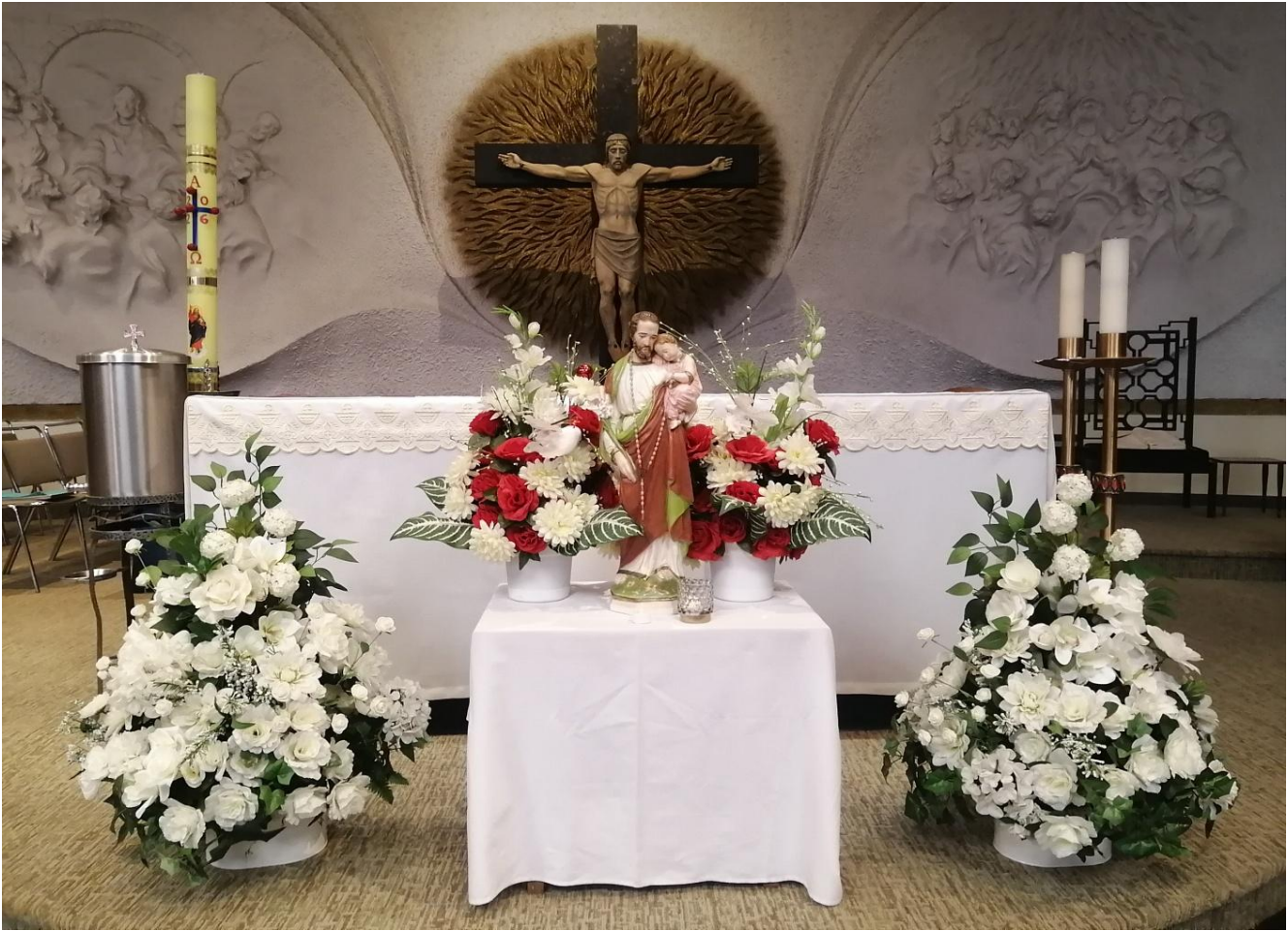
Feast of St. Joseph the Worker 1 May