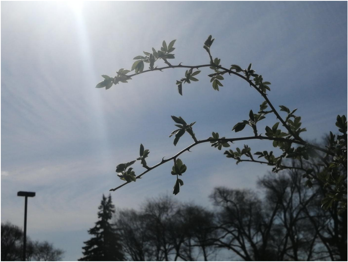
Budding rosebush, morning and night.