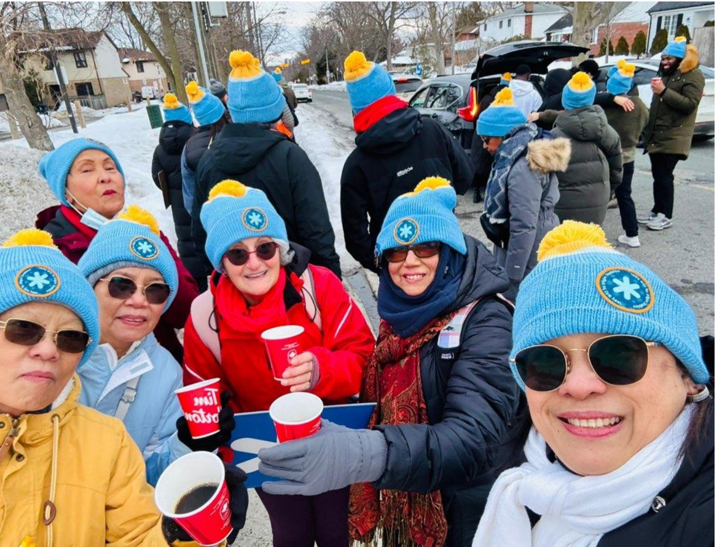
Top: ST. FRANCIS TABLE, 8 April 2026.