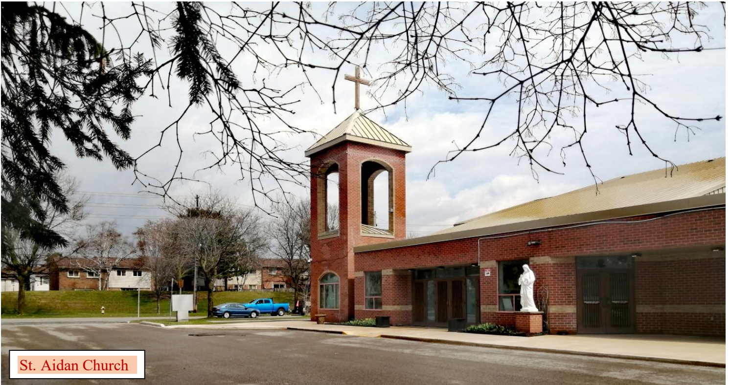
St. Aidan Church