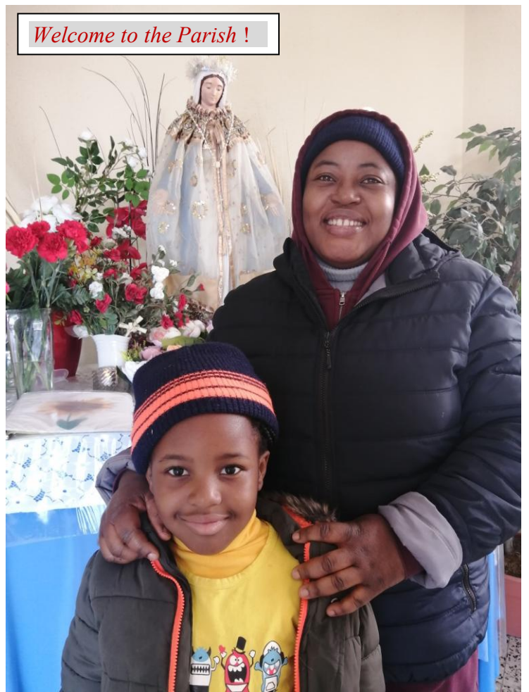
Welcome to the Parish !