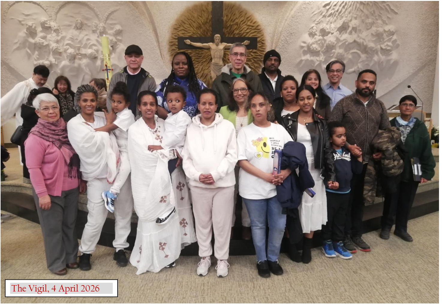
The Vigil, 4 April 2026