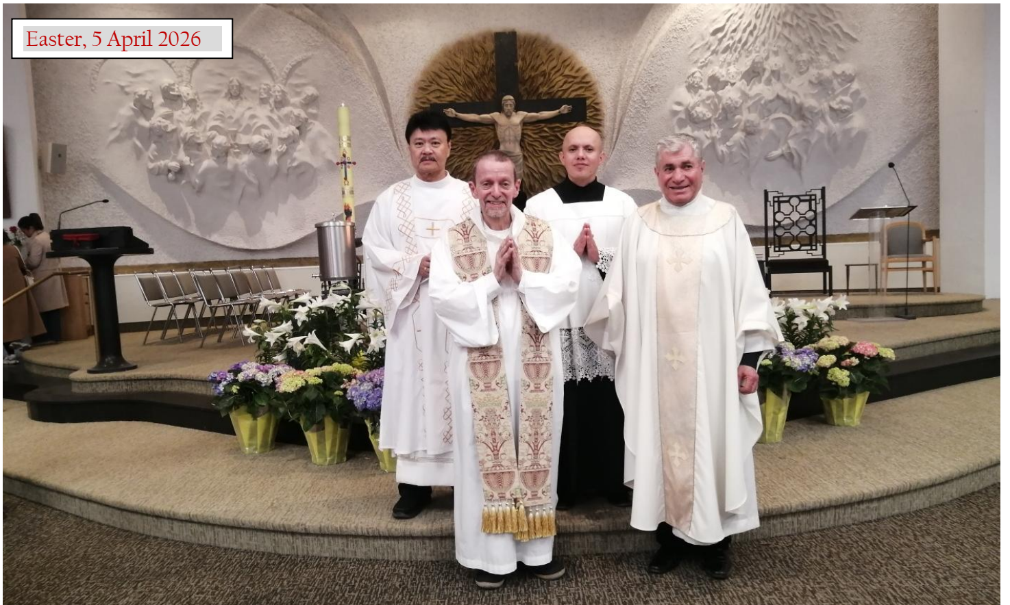
Easter, 5 April 2026