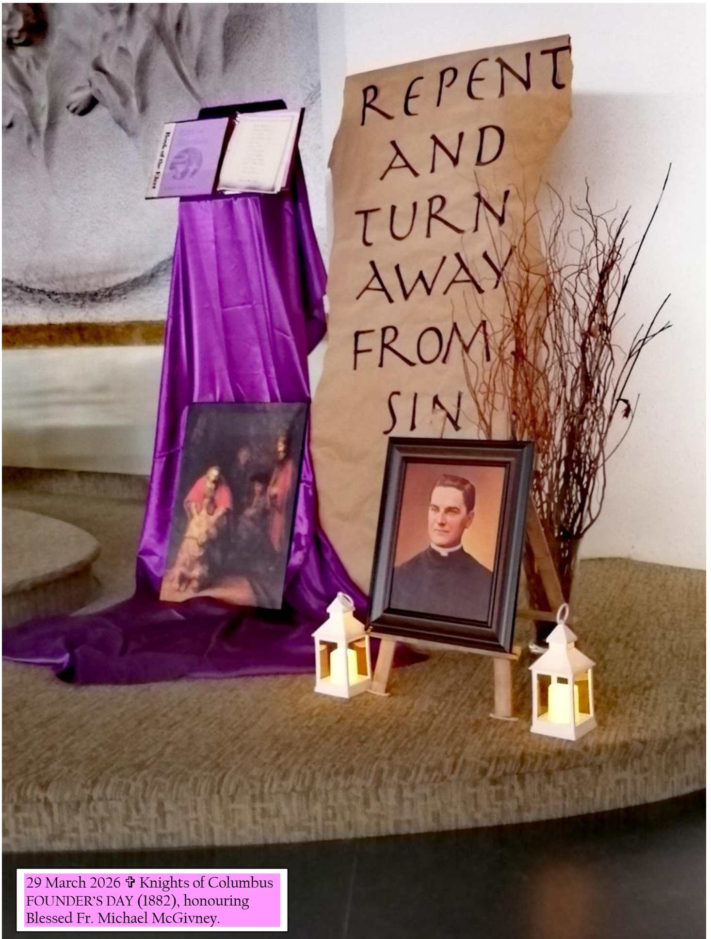
29 March 2026 ☩ Knights of Columbus FOUNDER'S DAY (1882), honouring Blessed Fr. Michael McGivney.