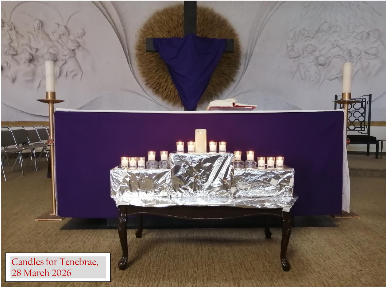
Candles for Tenebrae, 28 March 2026