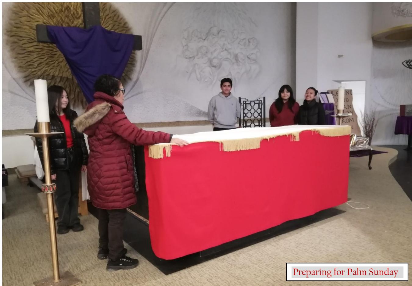
Preparing for Palm Sunday