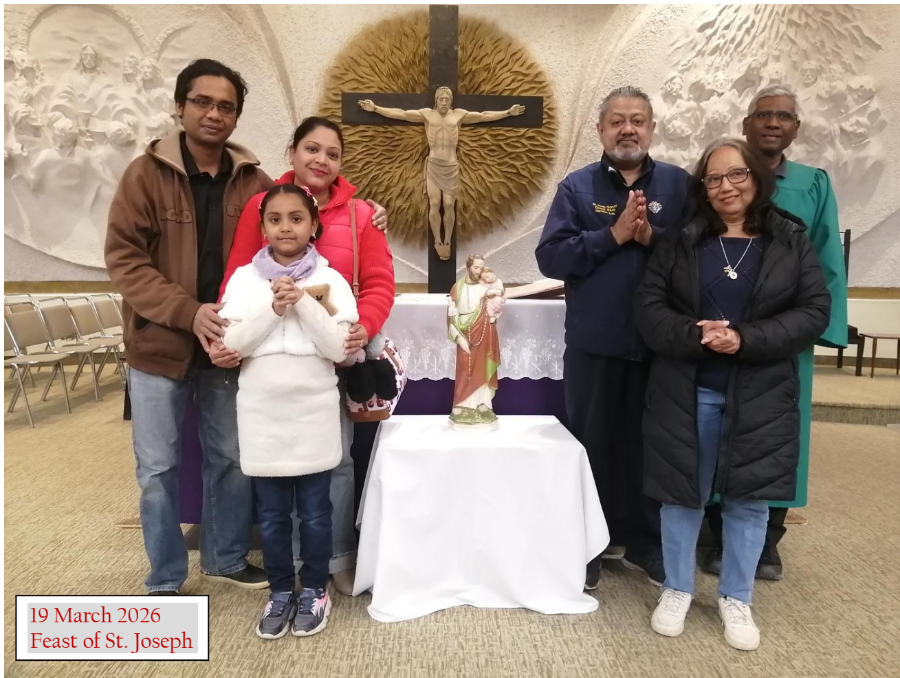
19 March 2026 Feast of St. Joseph