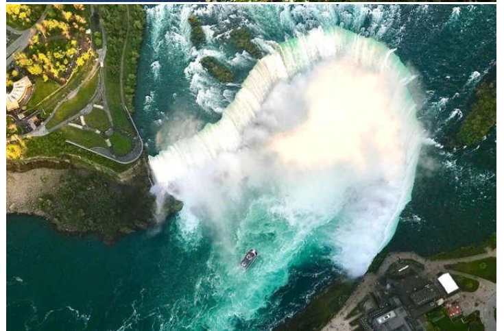
Winter: Danforth, Mont St. Michel, Hallstadt, Niagara Falla.