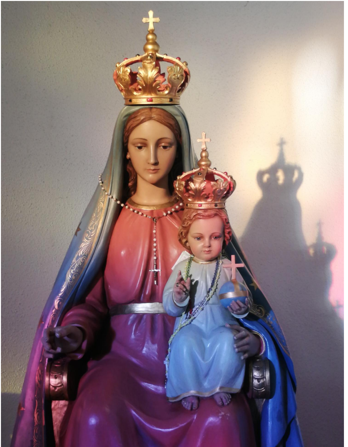
Santa Maria di Anzano