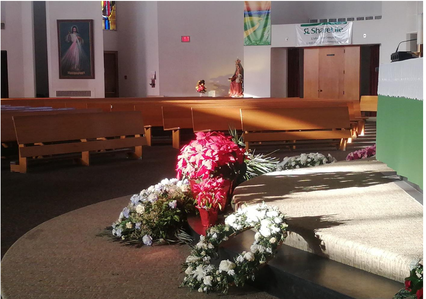
Below: Morning sunlight on Christmas and funeral flowers.