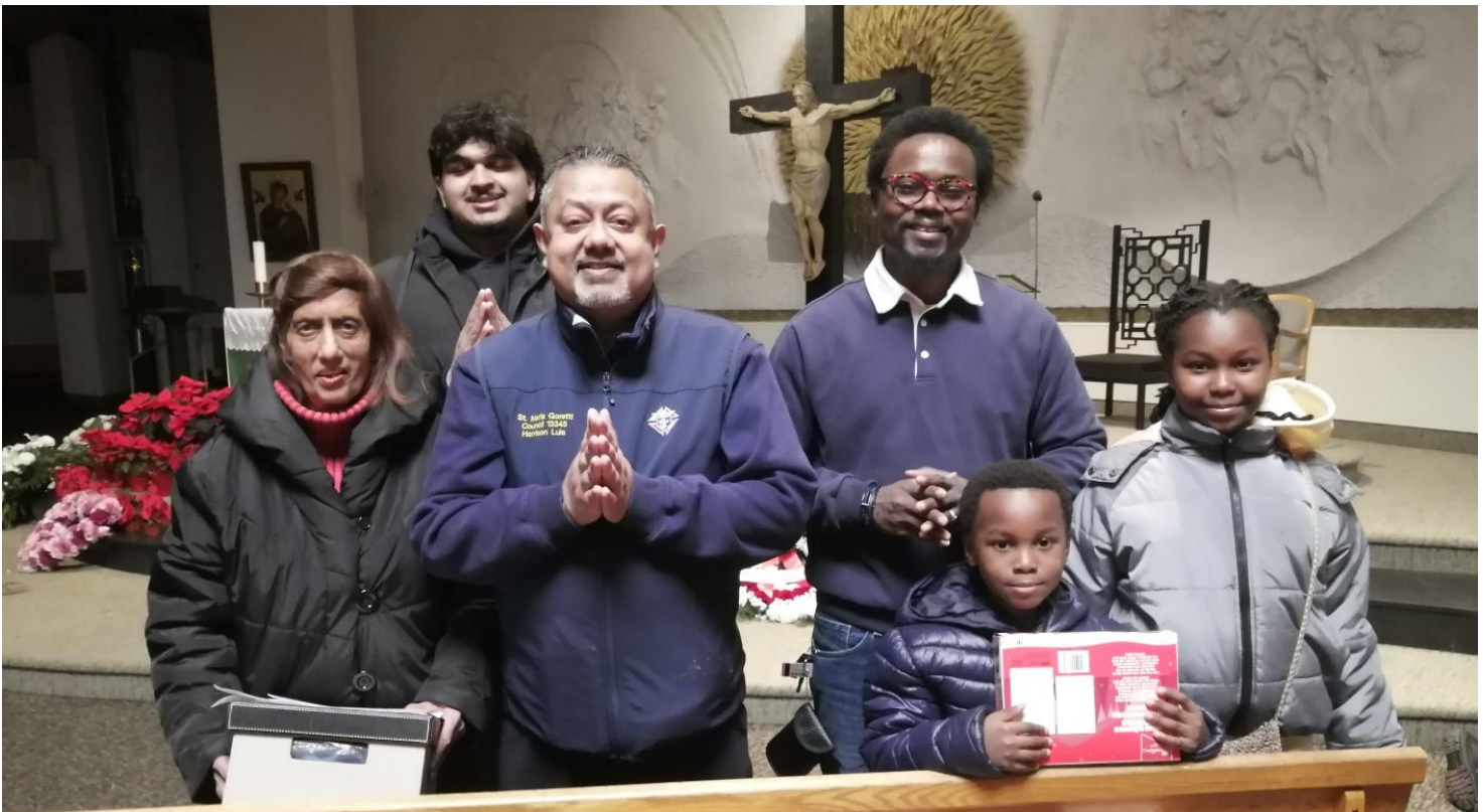
Below: Knights of Columbus and friends, 17 January.