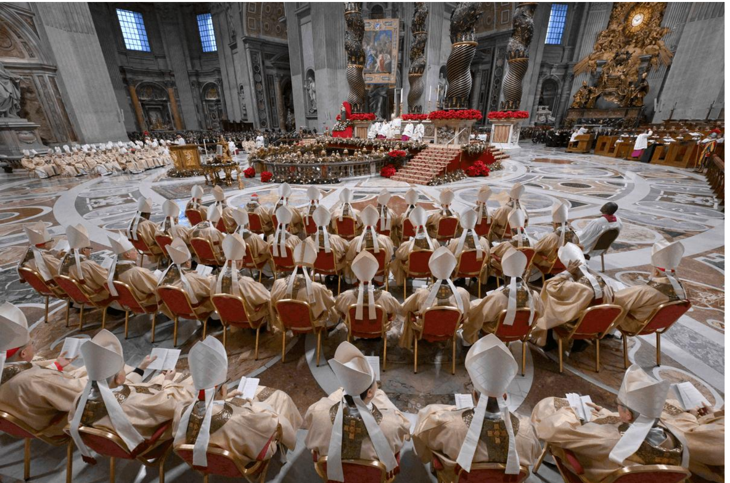
Below: 6 January 2026 – Cardinals in Rome with Pope Leo XIV