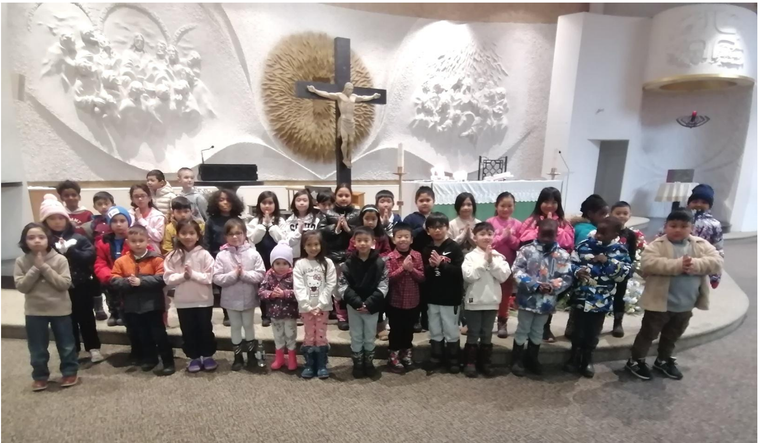
Above: 19 January – 1 st Communion Candidates at their meeting.