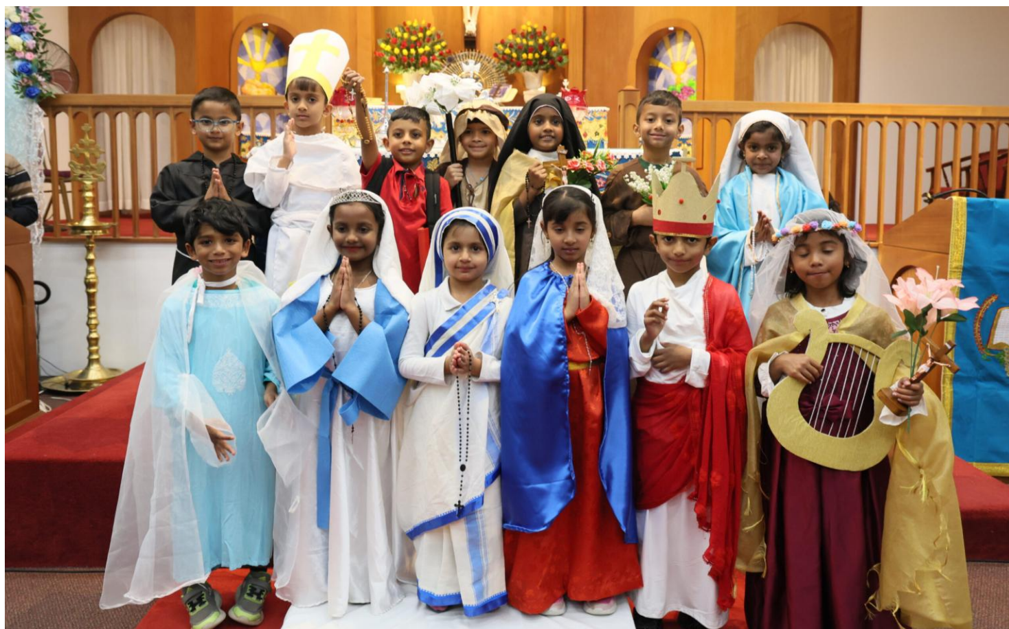
Top: Sunday Mass at Holy Family Church, King Street West.