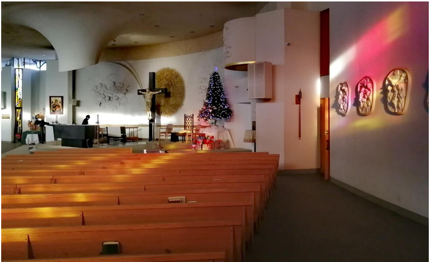
Above: The Church on a January morning.