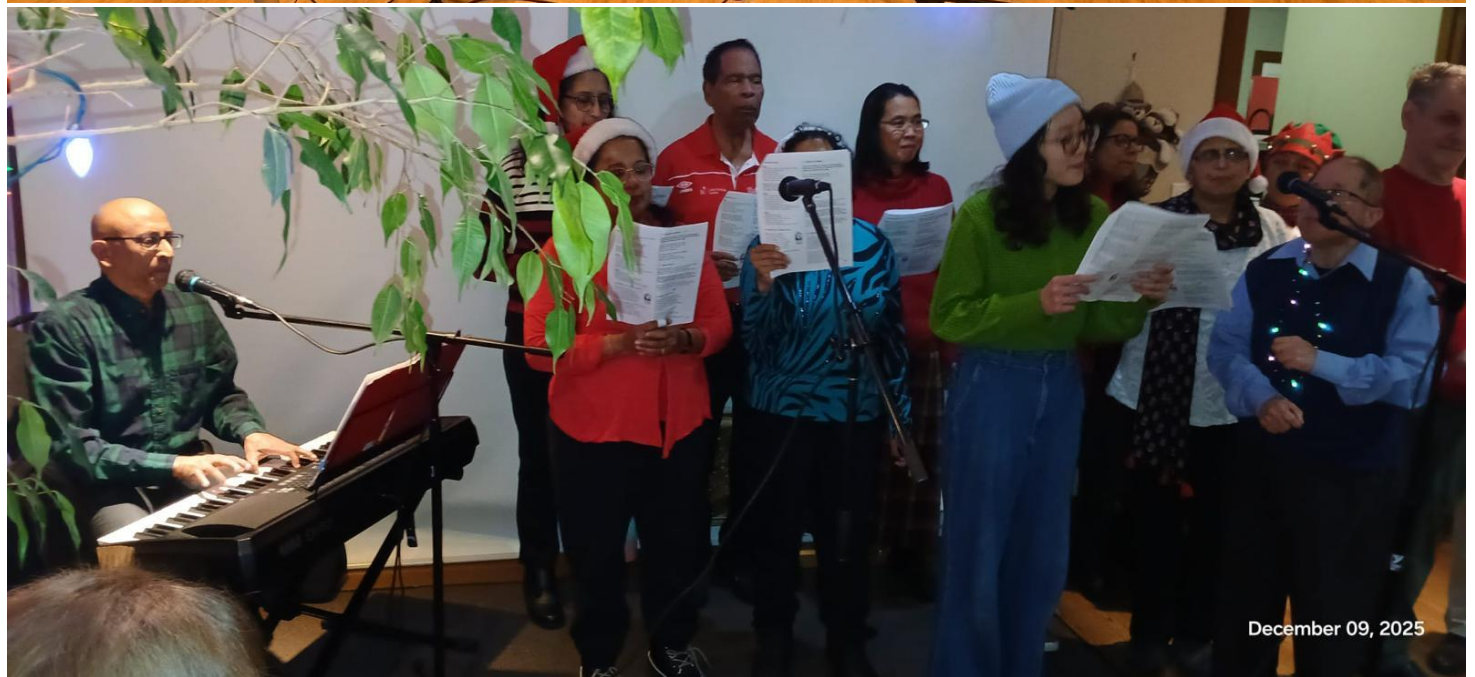
Christmas Caroling at: Trilogy, Ina Grafton, Scarborough Retirement, Vincent House