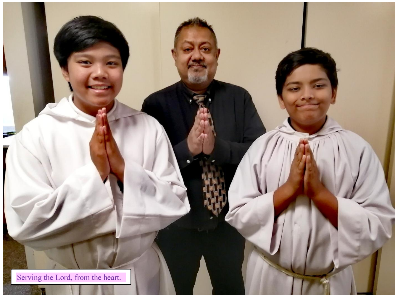
Serving the Lord, from the heart.