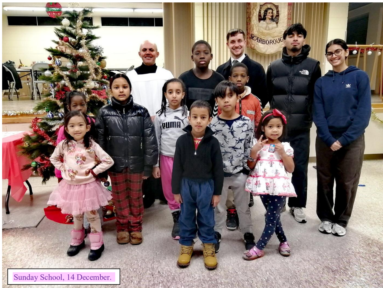
Sunday School, 14 December.