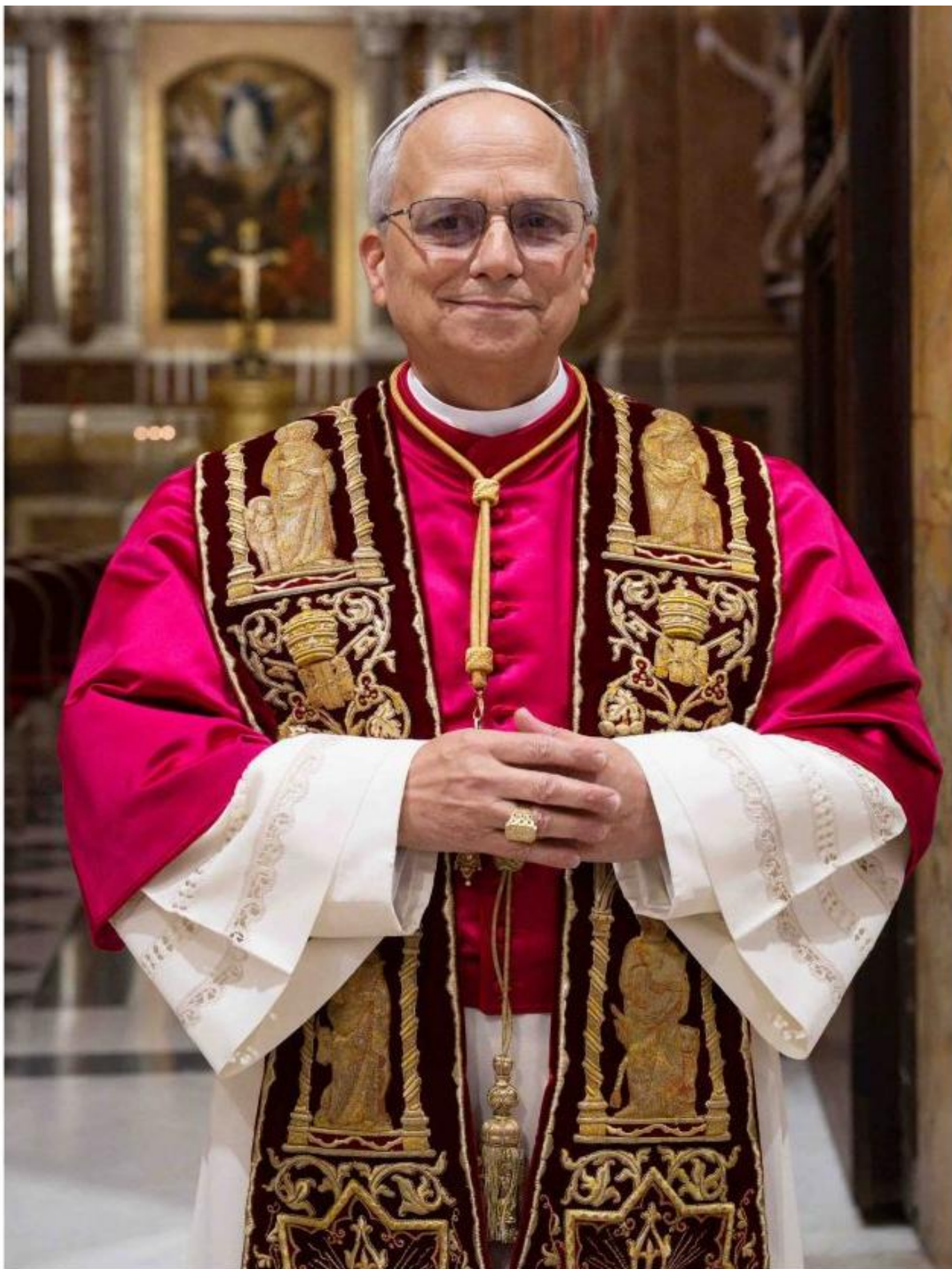
Leone PP. XIV