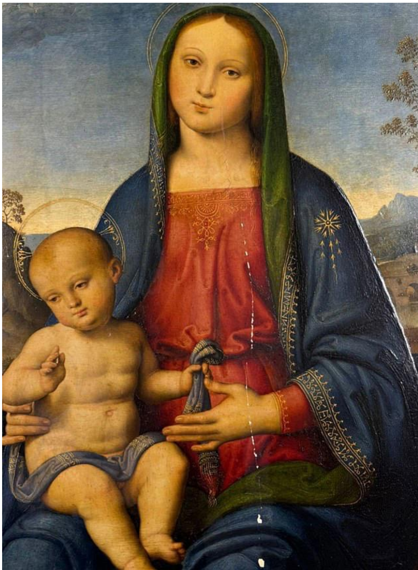
Madonna and Child Jesus, by 15 th century painter Pietro Vannucci.

(Discovered in a garage in Banbury, Oxfordshire, England. It was later sold by auction for US$1,000,000.00.)