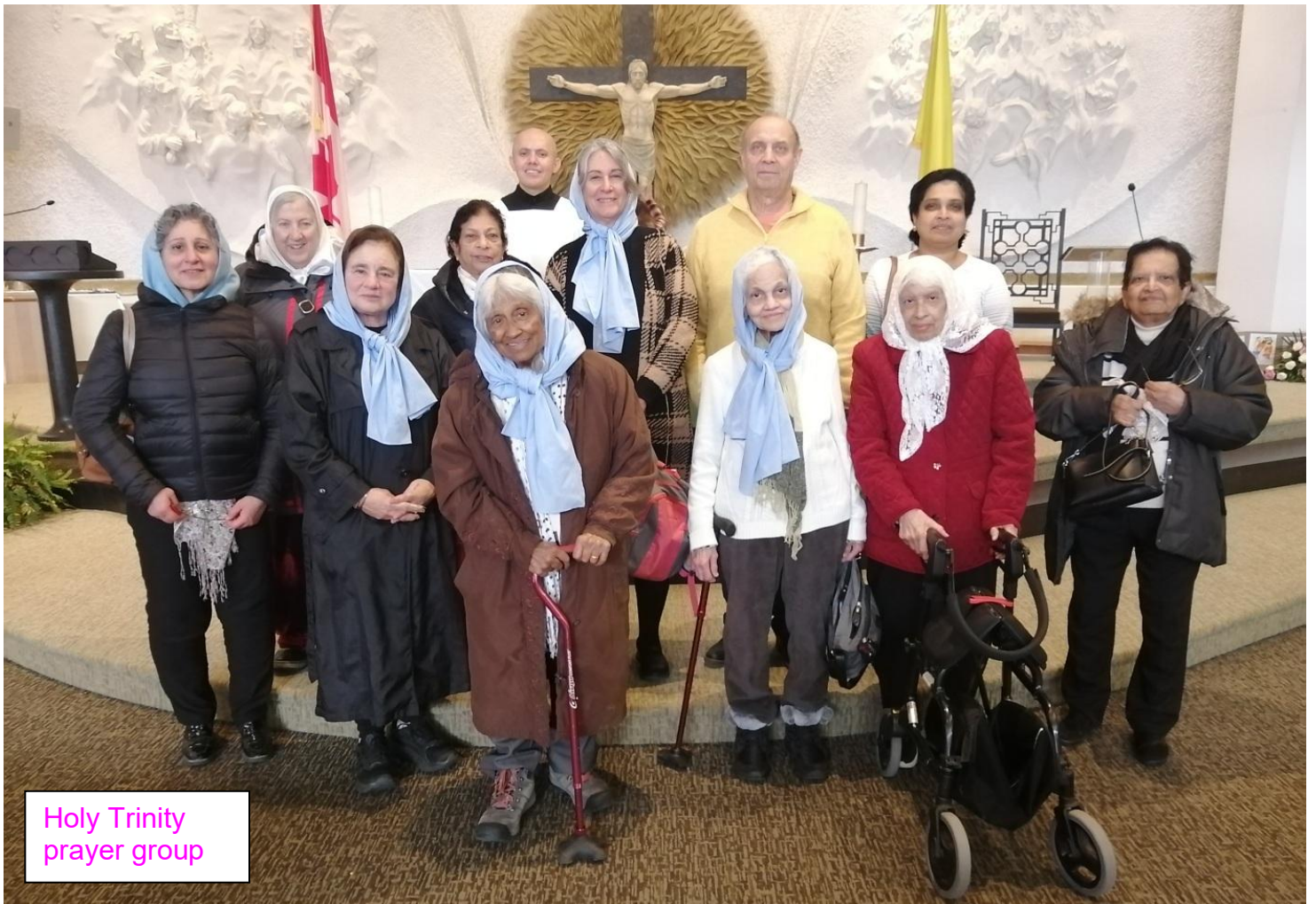
Holy Trinity prayer group