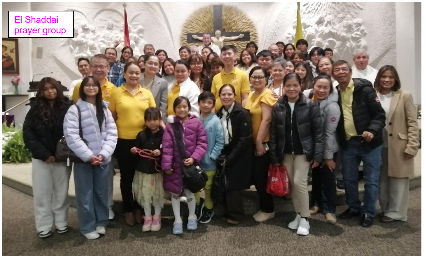
El Shaddai prayer group