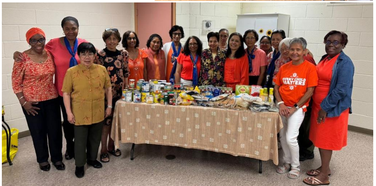
[Right & below] Indigenous Healing, Thanksgiving Food Drive