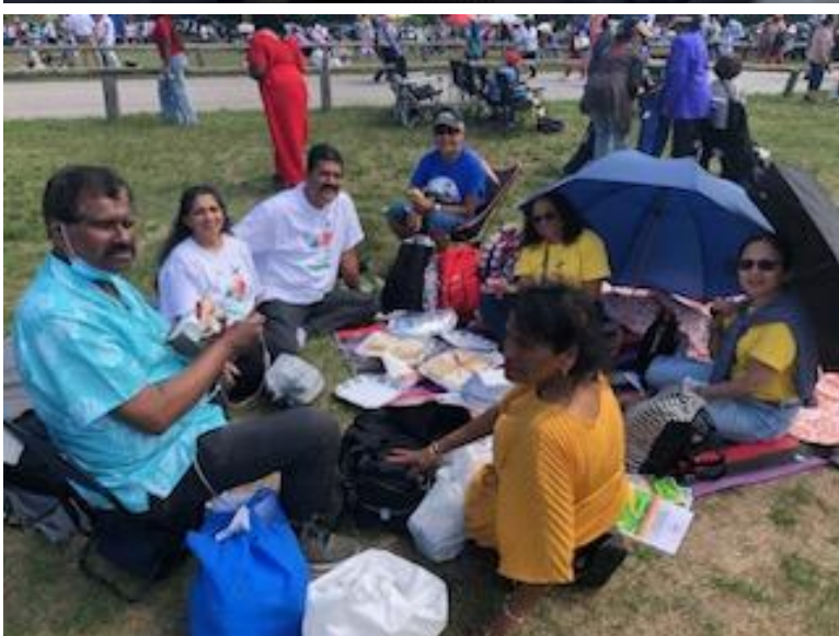
Archdiocese of Toronto Jubilee Pilgrimage to Martyrs' Shrine, Sunday, 24 August.