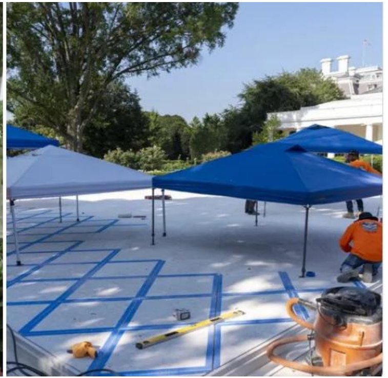
White House Rose Garden ( Before & After )

I USED TO THINK I COULDN'T SERVE BOTH GOD AND MAMMON, AND THEN I DISCOVERED MULTITASKING!