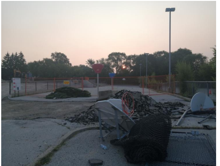
Renovation & upgrading of the St. Maria Goretti School grounds, July 2025