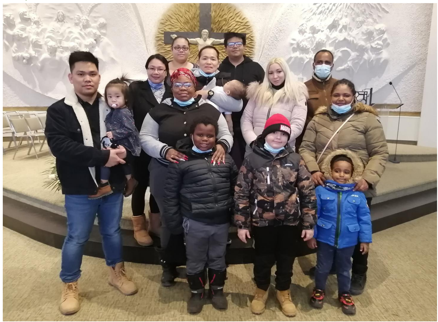
RCIC, 13 March 2022 ^{\star}