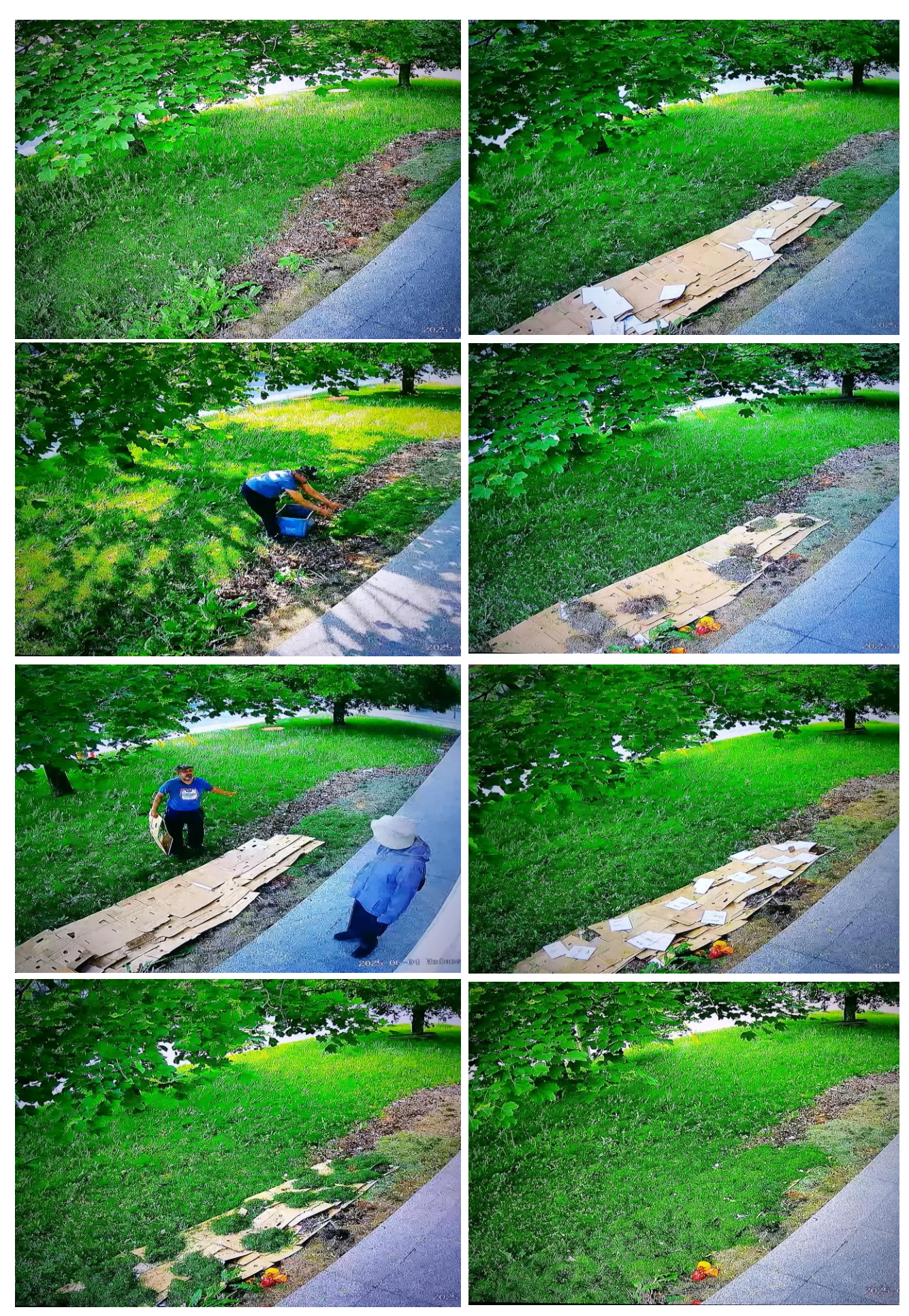
Raising the ground level for new sod.