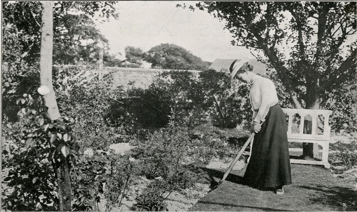
At the Glynde School: A lady pupil trimming the edges of the turf

AN IDEAL VOCATION FOR LADIES, AND WHERE IT CAN BE LEARNED