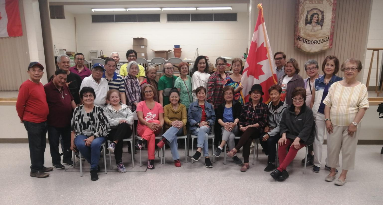
Below: S.O.S.A. members rehearsing, June 2025