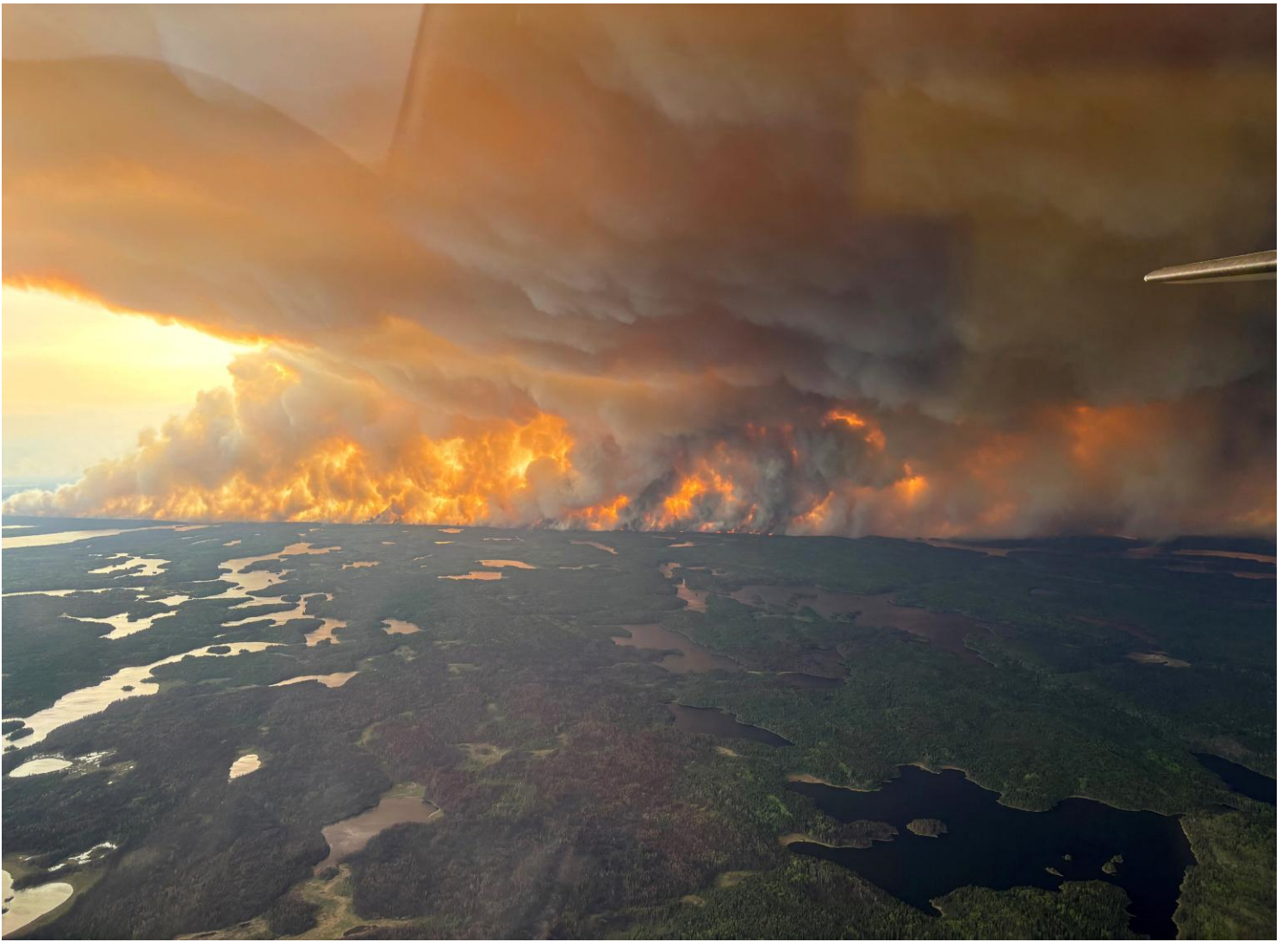
Above: Manitoba wildfires, May 2025