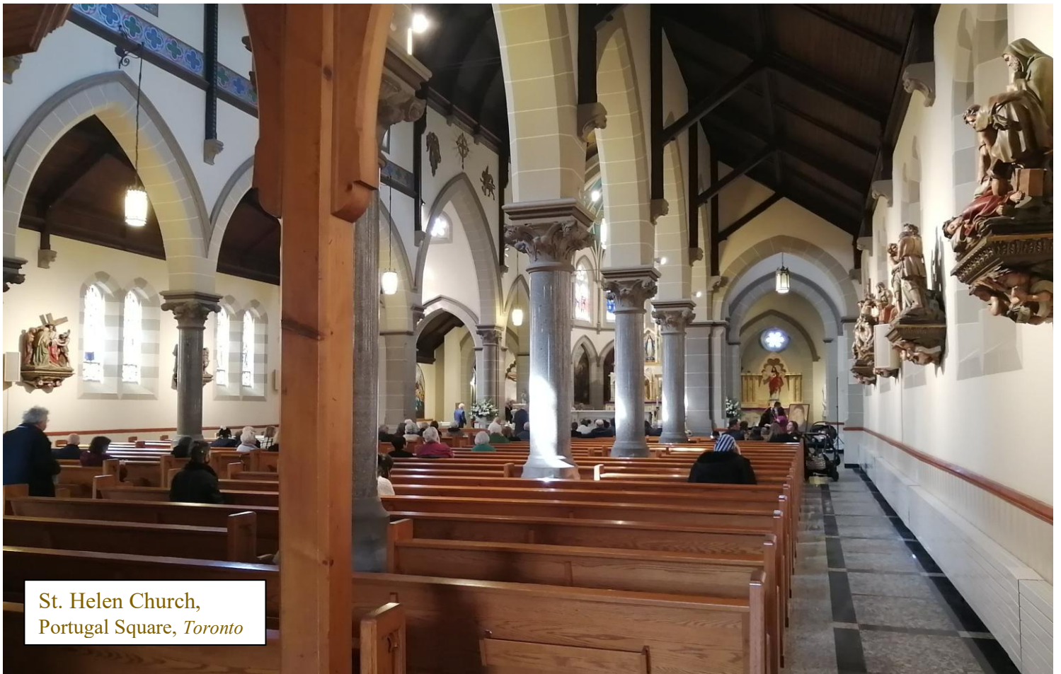
St. Helen Church, Portugal Square, Toronto