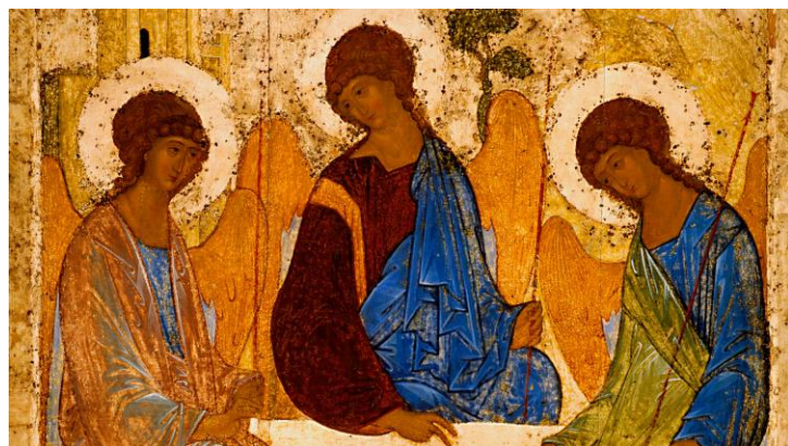
The TRINITY, by Andrei Rublev (1411)