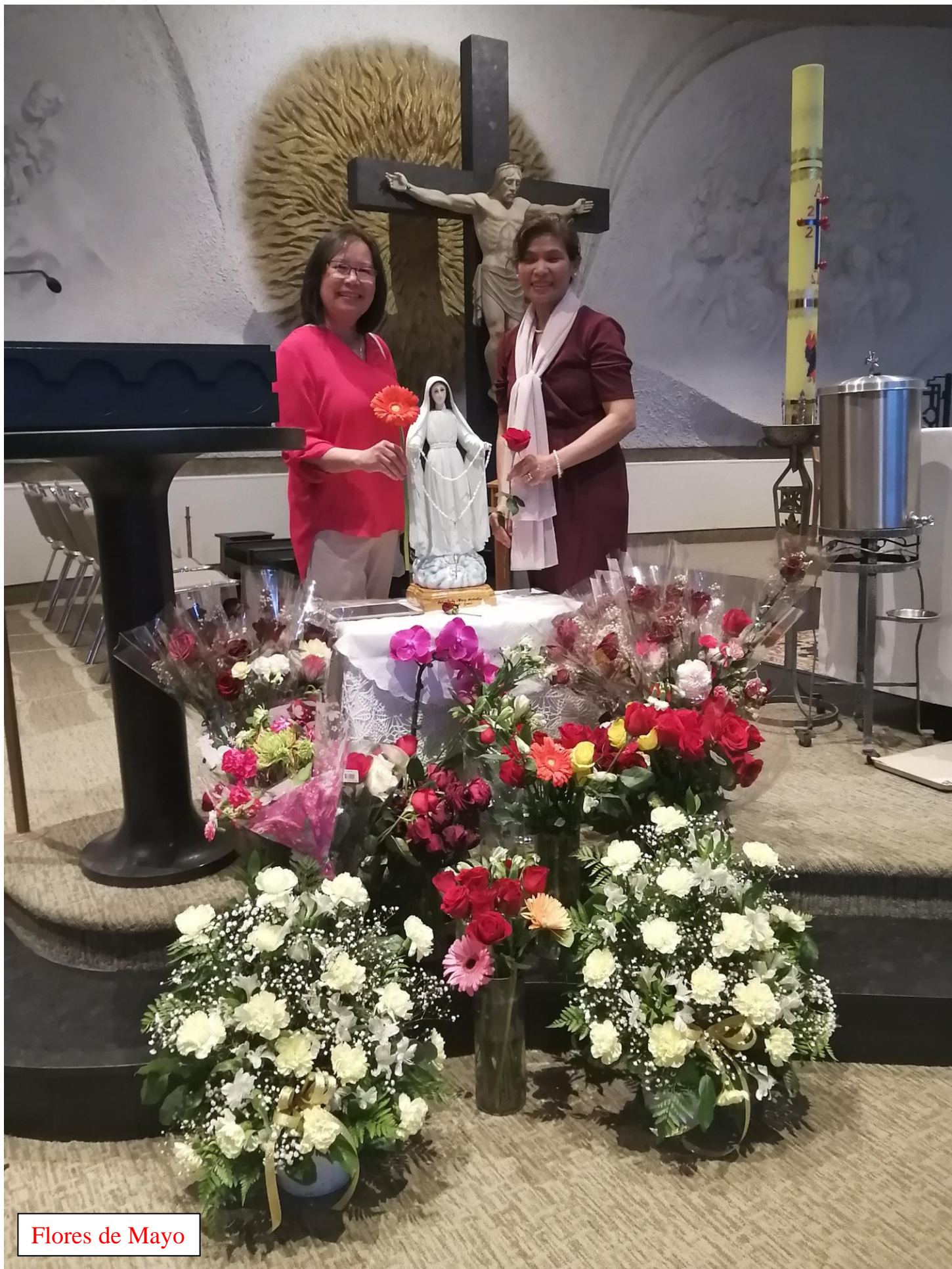
Flores de Mayo