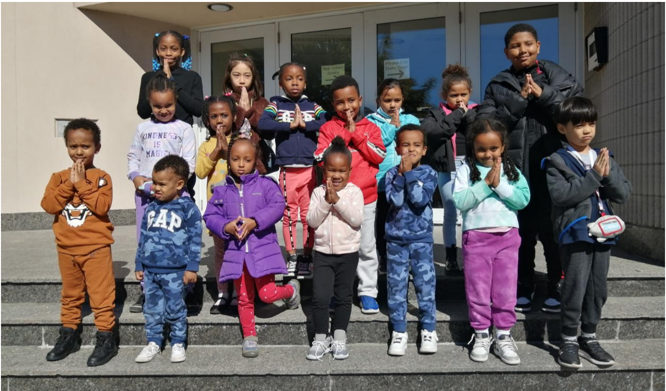
RCIC ✝ 24 Sept. 2022 ↑