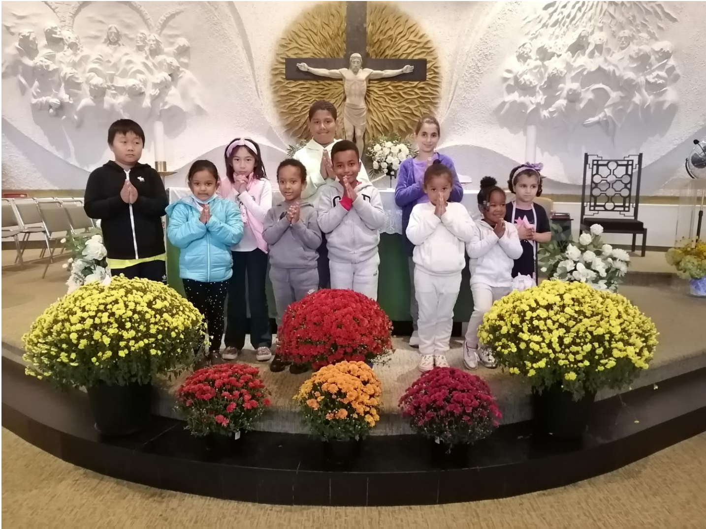
RCIC ✝ 1 Oct. 2022 ↓