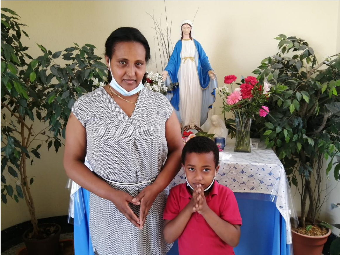
RCIC ☩ 5 June 2022 ↓