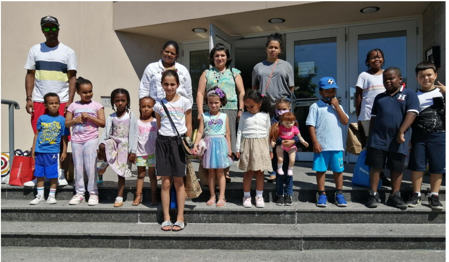
RCIC ✝ 6 August 2022 ↑