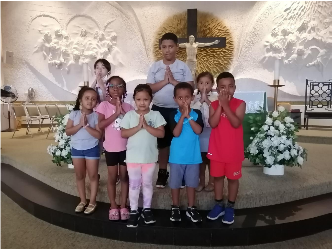
RCIC ✝ 10 Sept. 2022 ↑