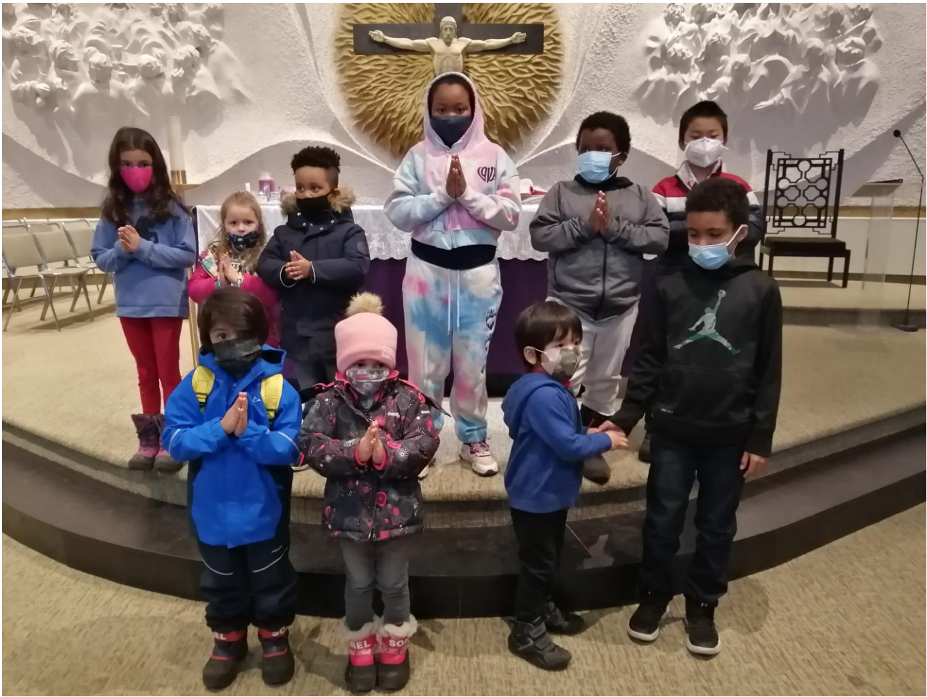
RCIC ☩ 19 March 2022 ↑