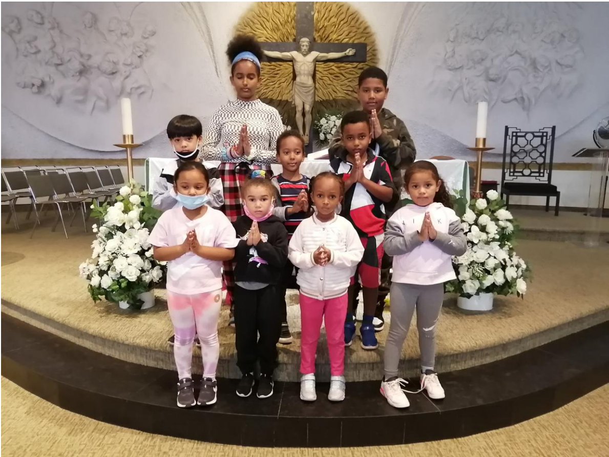
RCIC ✝ 17 Sept. 2022 ↓