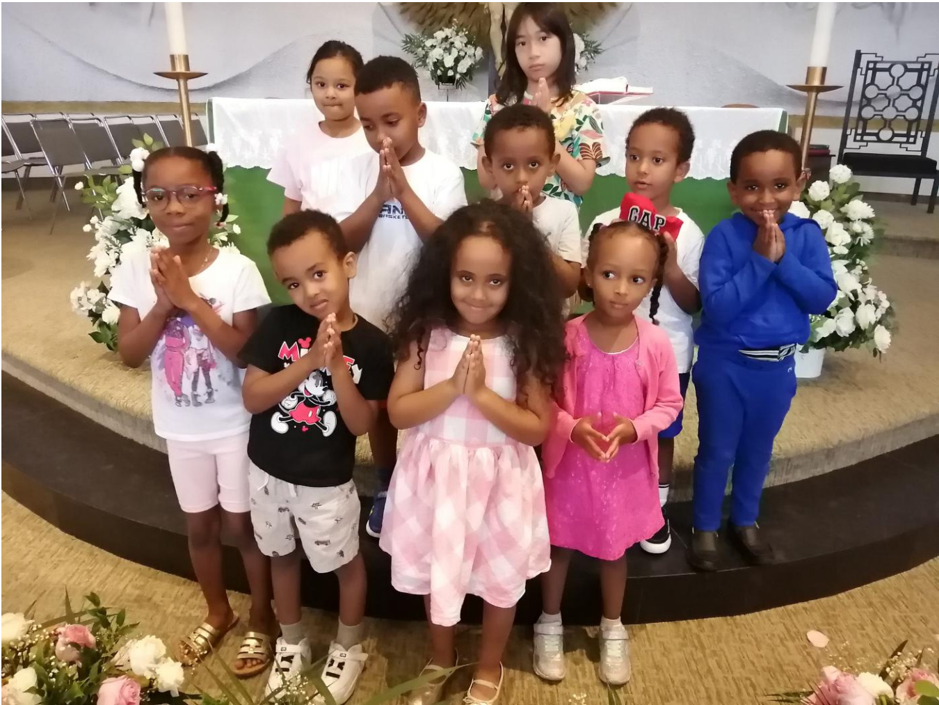
RCIC ✝ 3 September 2022 ↓