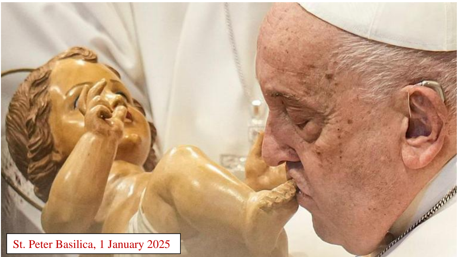
St. Peter Basilica, 1 January 2025