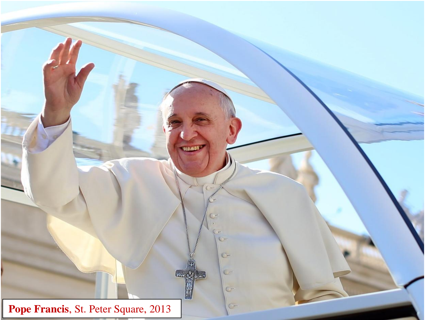
Pope Francis, St. Peter Square, 2013