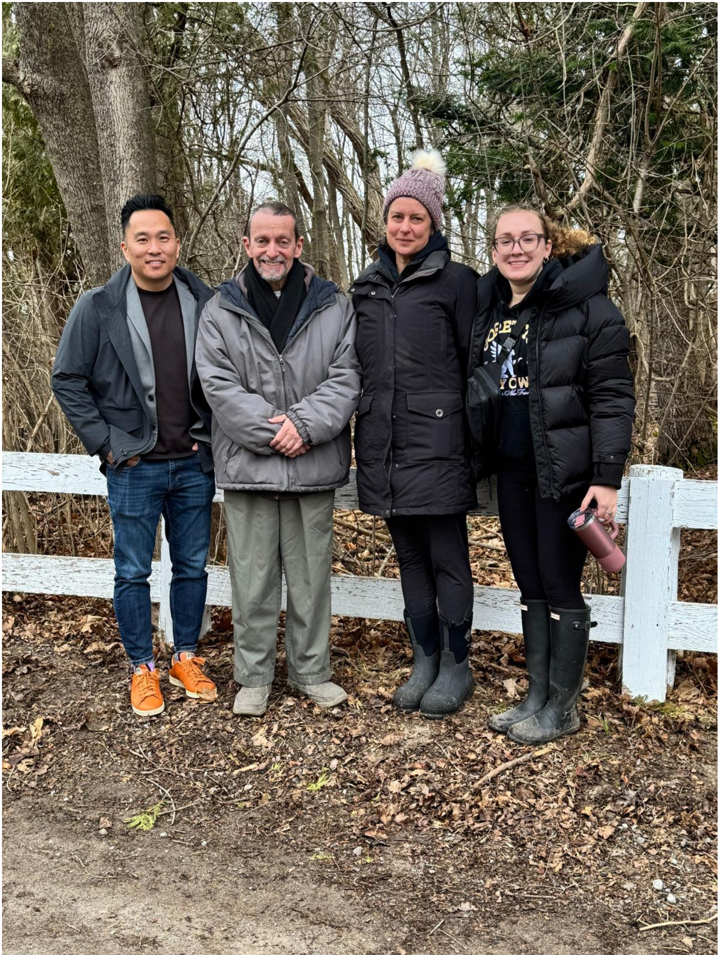
Lake St George, 20 March