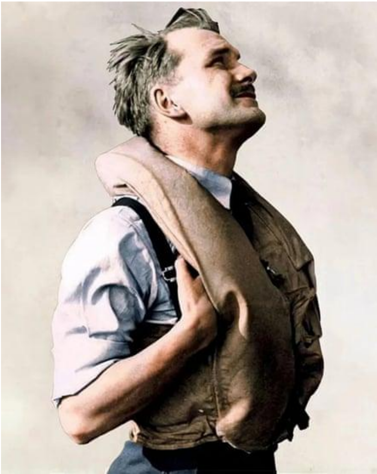
John "Paddy" Hemingway, 17 July 1919 – 17 March 2025

Group Captain John Allman Hemingway, DFC, AE, known as "Paddy," was an Irish fighter pilot who served in the Royal Air Force during the Second World War in the Battle of Dunkirk, the Battle of Britain, the Allied invasion of Italy and the Invasion of Normandy. He was shot down four times during the war. He was the last surviving airman of the Battle of Britain.