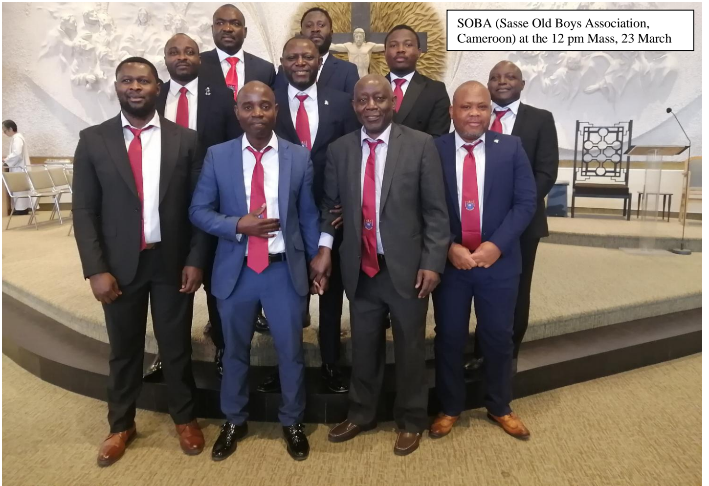
SOBA (Sasse Old Boys Association, Cameroon) at the 12 pm Mass, 23 March