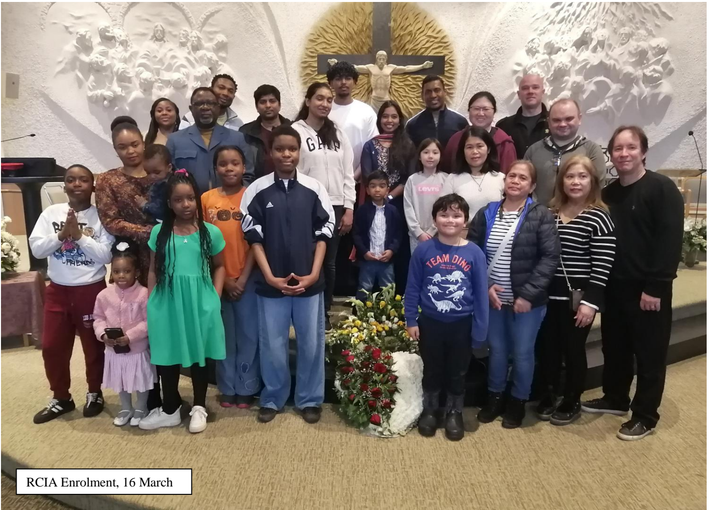
RCIA Enrolment, 16 March