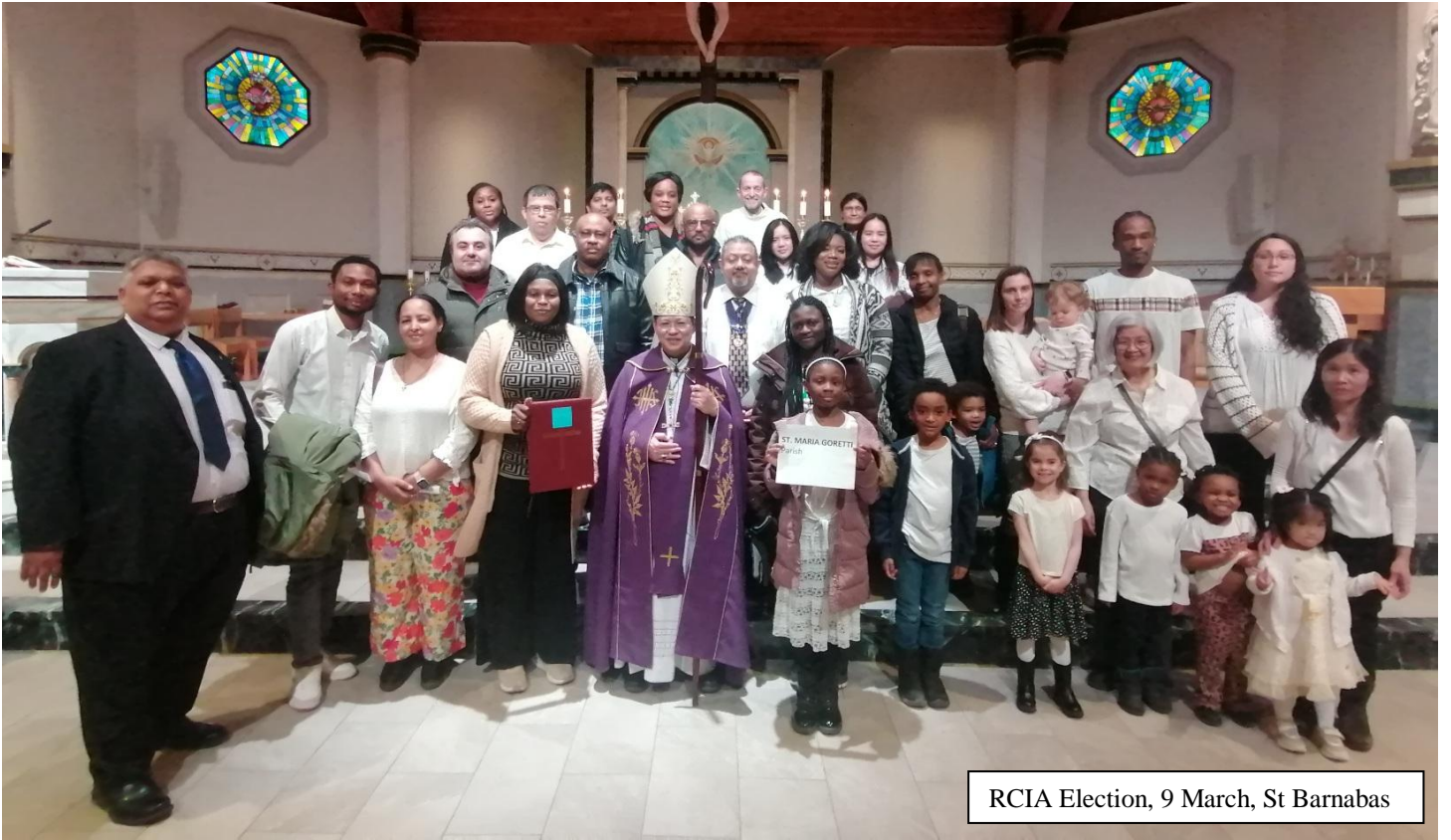
RCIA Election, 9 March, St Barnabas