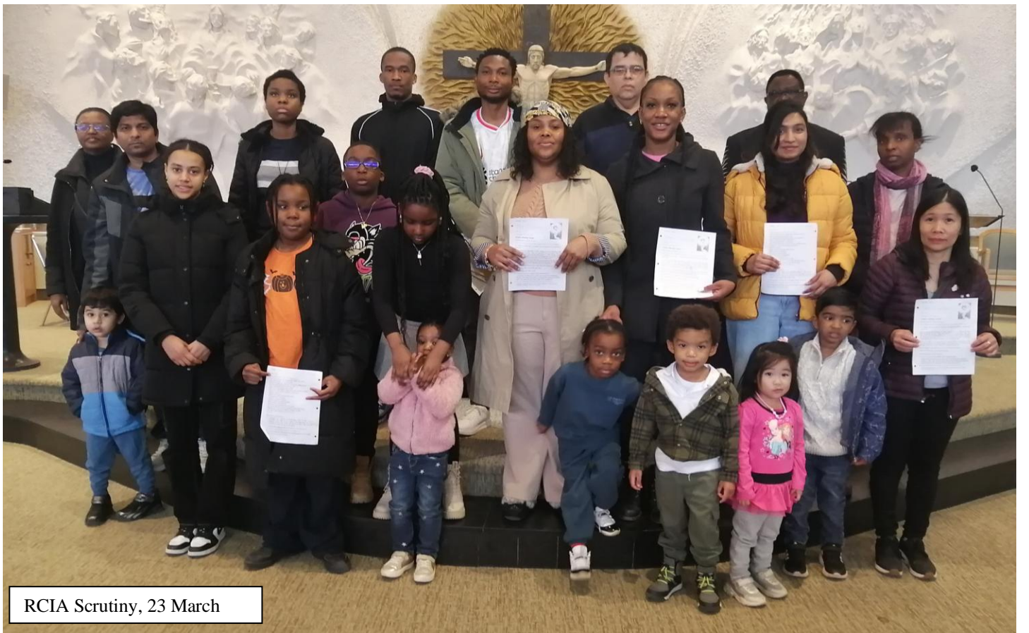
RCIA Scrutiny, 23 March