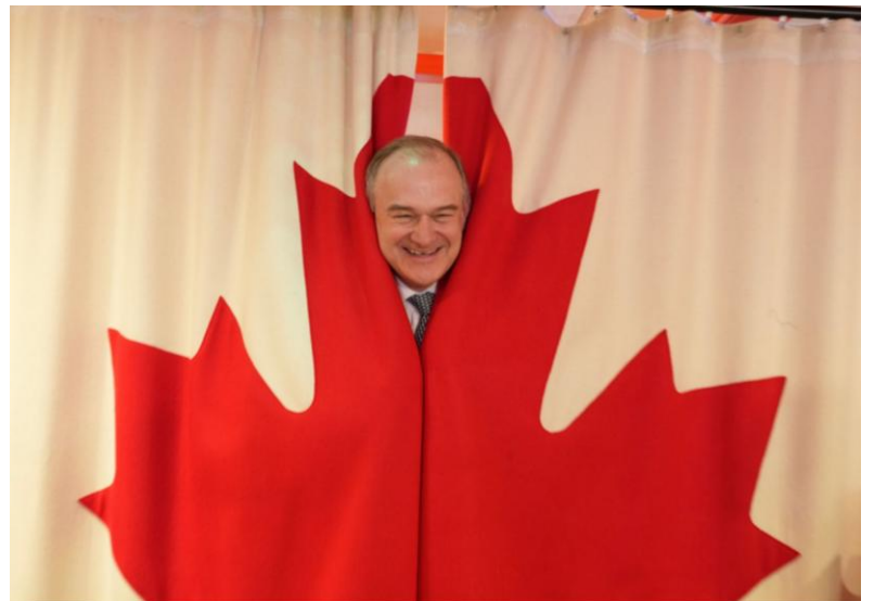
[Below:] Ed Davey, the leader of the British Liberal Democrats, demonstrates solidarity with Ottawa in a Canadian flag.