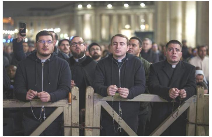
Pope Francis at the Gemelli Hospital, Rome