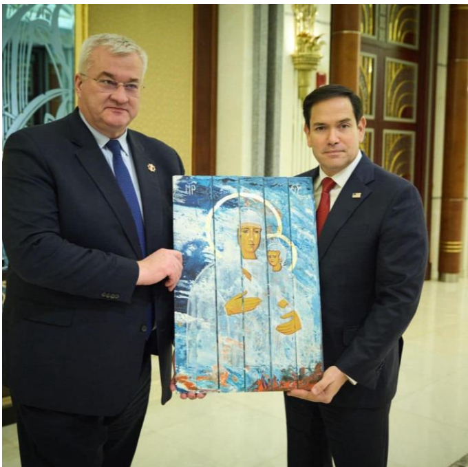
[Above:] Marco Rubio receives an original hand-painted icon on an ammunition box from Mariupol, a city in the Southeast corner of Ukraine, which is now occupied by Russia.