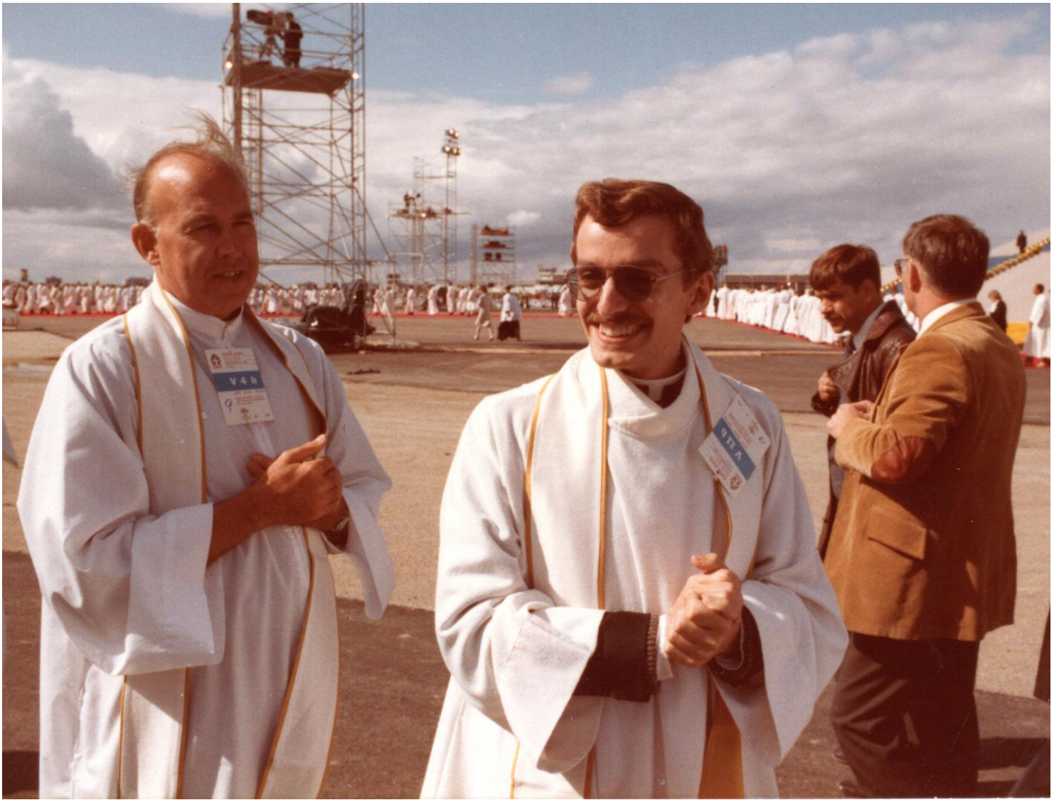
[Above:] Priests participating in the Papal Mass at Downsview Park on 15 September 1984 with Pope John Paul II.