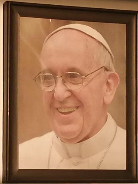
When the Office team prayed for Pope Francis , the sunshine lit up his picture in the Rectory, 25 February.