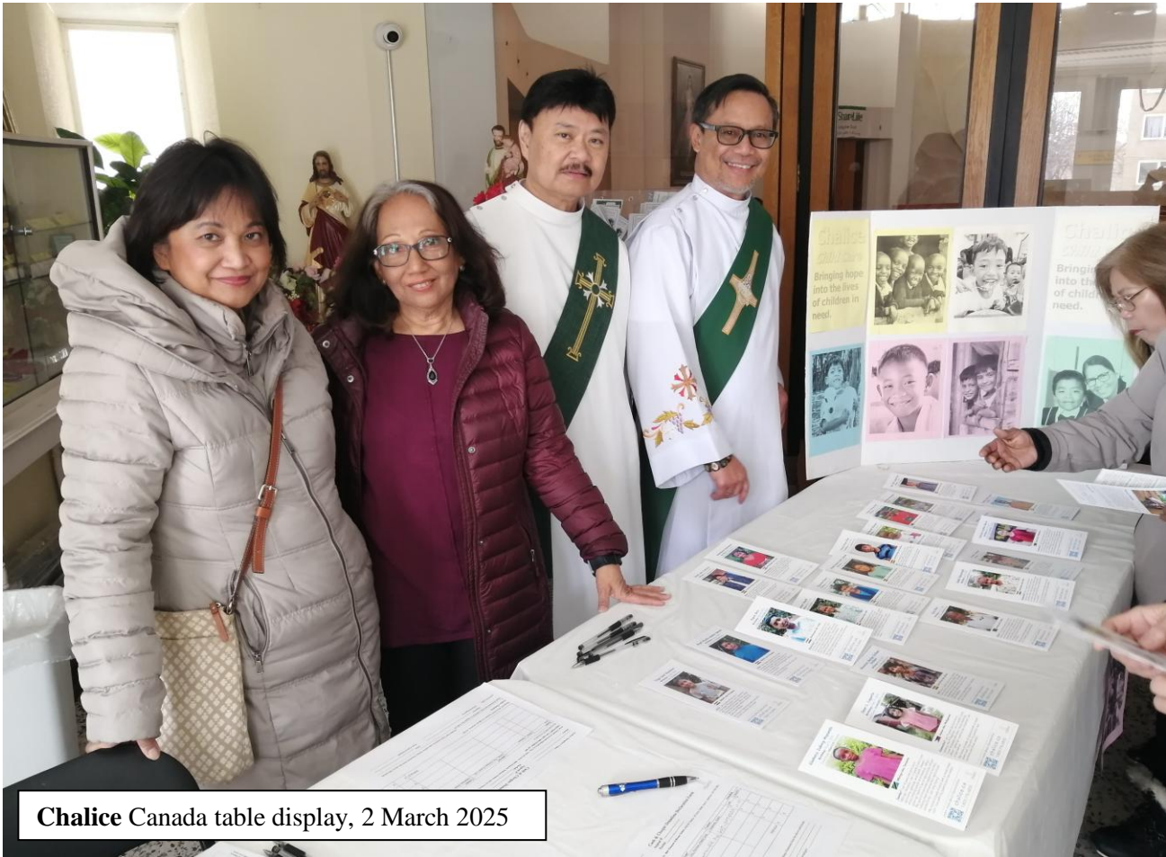
Chalice Canada table display, 2 March 2025