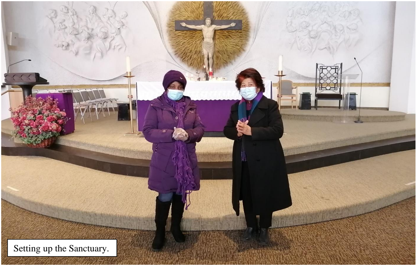
Setting up the Sanctuary.