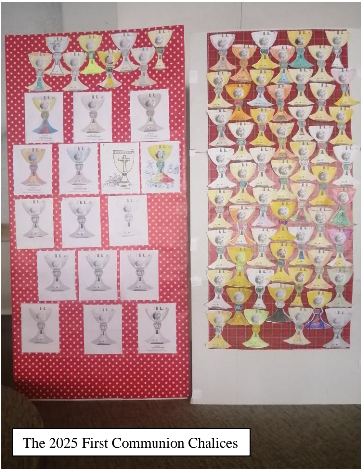
The 2025 First Communion Chalices