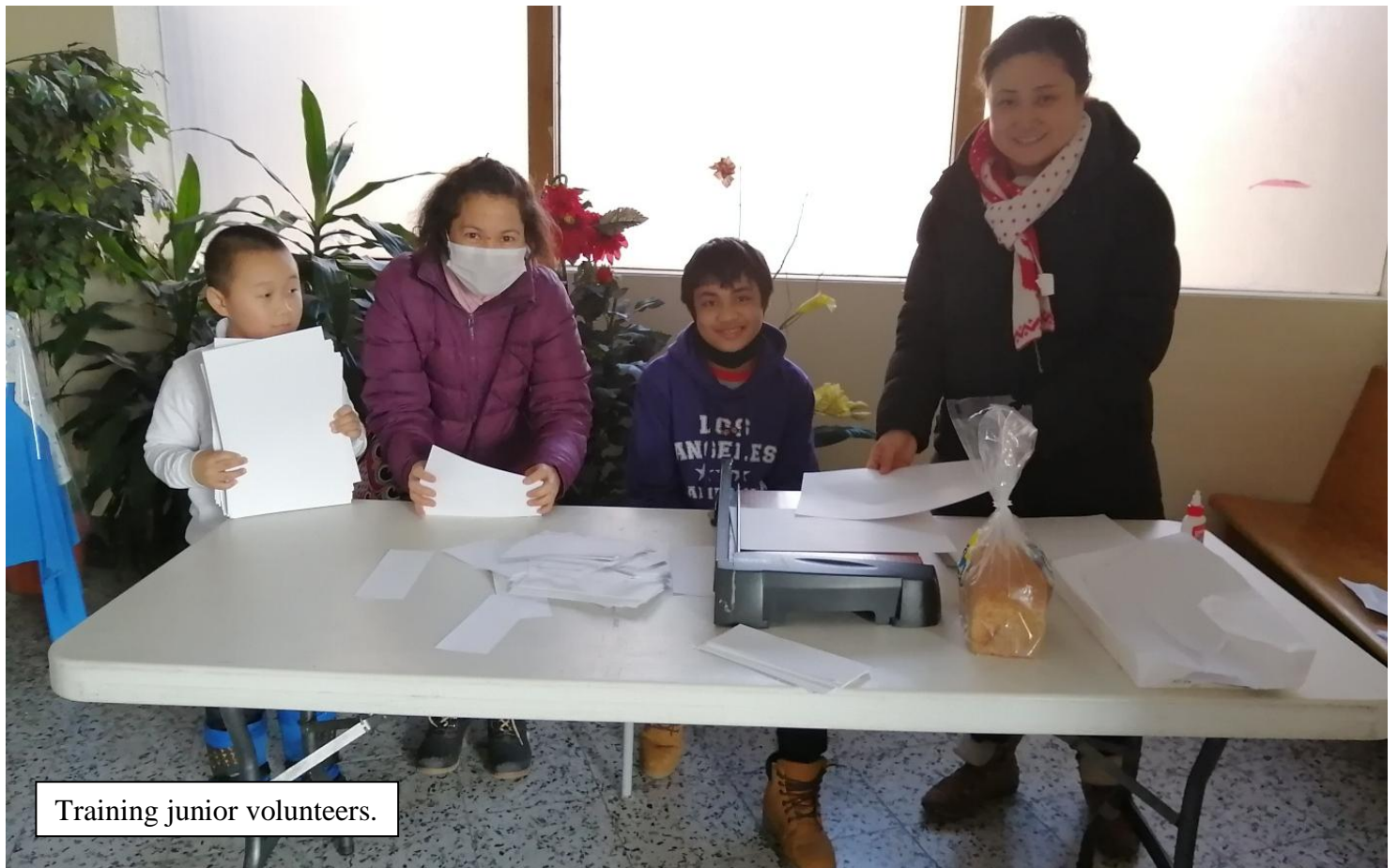
Training junior volunteers.