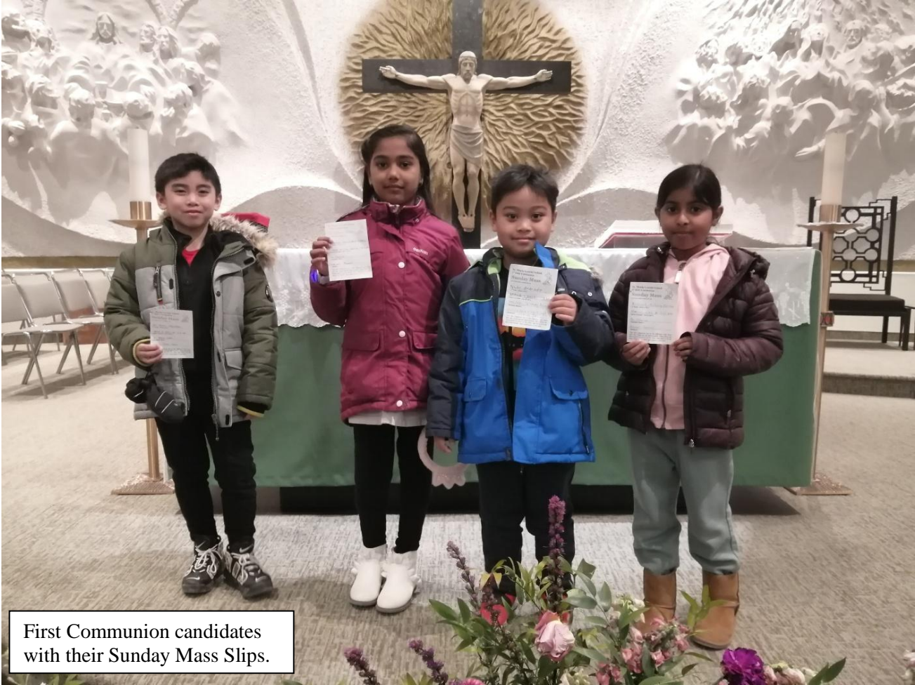
First Communion candidates with their Sunday Mass Slips.