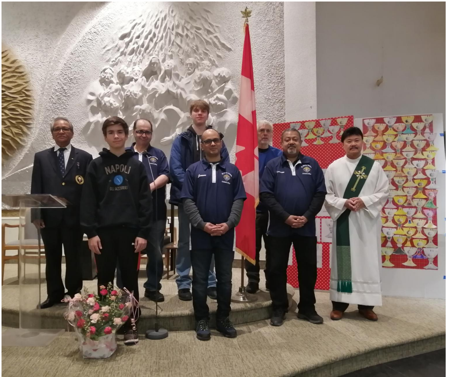
Above: The Knights of Columbus stand with the Canadian flag, installed in the Sanctuary at the 5.00 pm Mass on 15 February 2025, the 60 th

Anniversary of the unfurling of the new flag on Parliament Hill. The new Canadian flag replaced the earlier flag, which was a combination of the Union Jack with the Canadian red ensign.