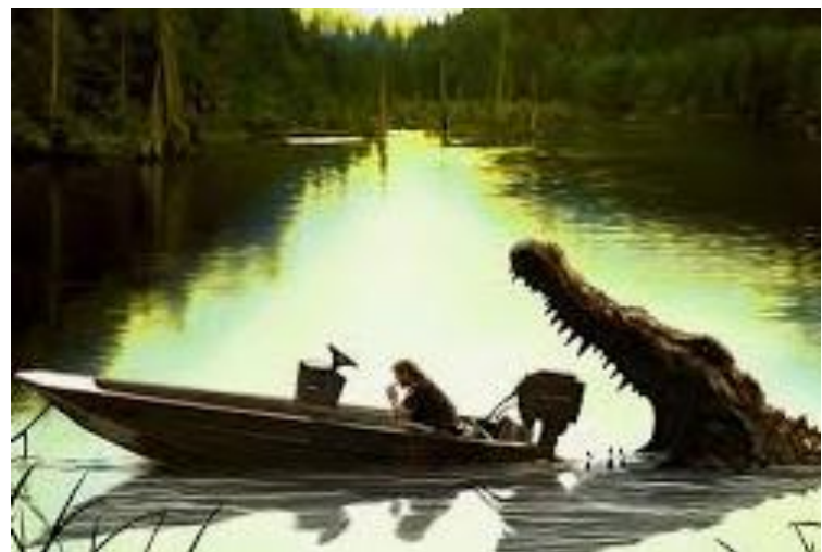
[Fresh snow in Brandon, Manitoba; Studying and praying; Anonymous donation of dental records on Church steps; Blessing a new restaurant; Ducks meander along the Nottawasaga River; A decisive moment in the bayou.]