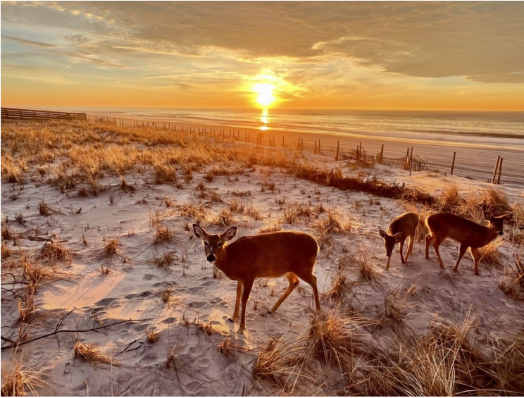
Deer on the Atlantic coast of Long Island, NY.