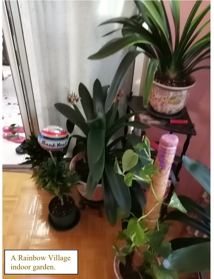
A Rainbow Village indoor garden.