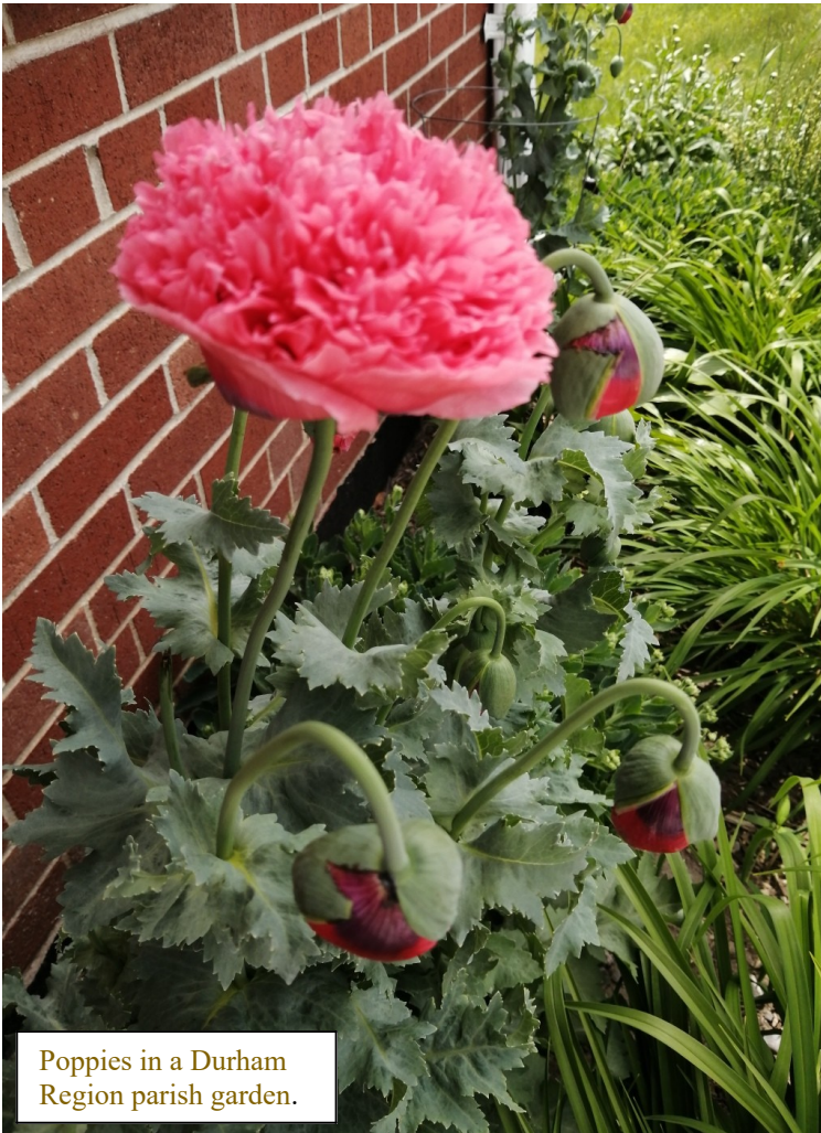
Poppies in a Durham Region parish garden.