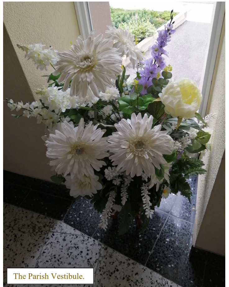
The Parish Vestibule.