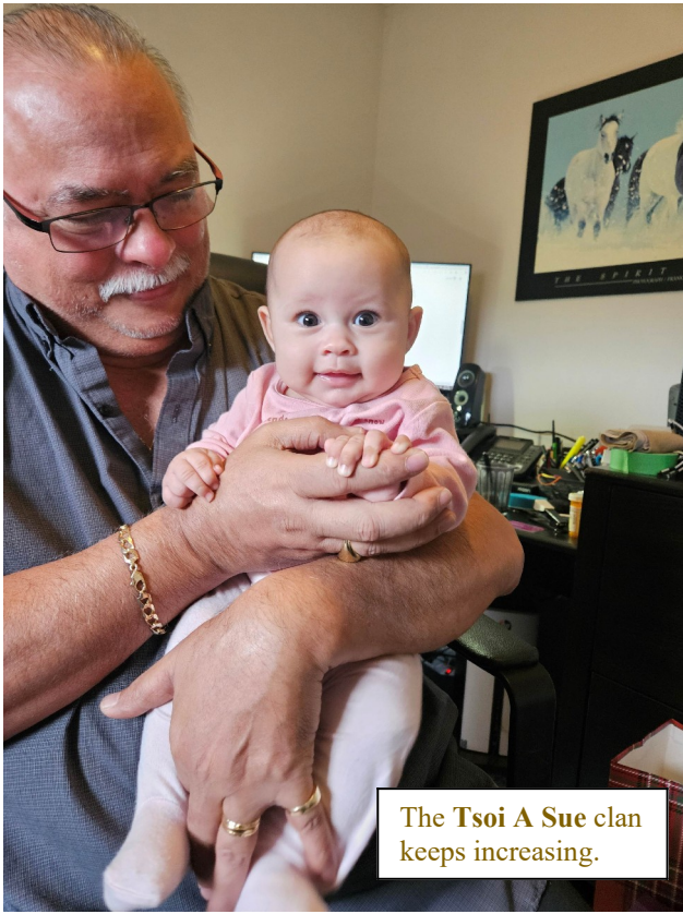
The Tsoi A Sue clan keeps increasing.