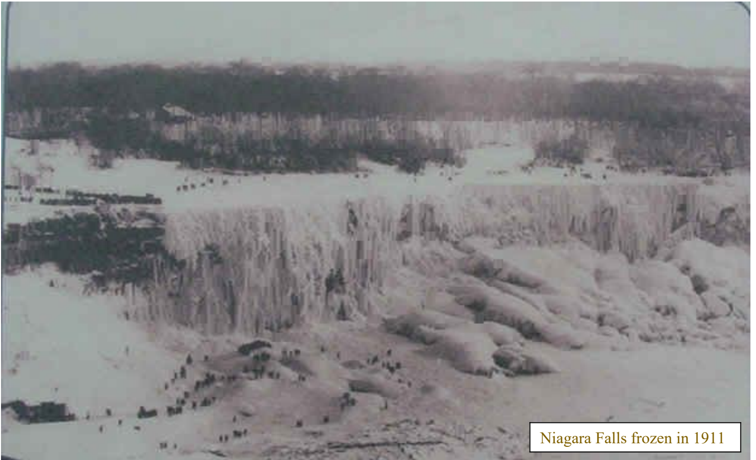
Niagara Falls frozen in 1911