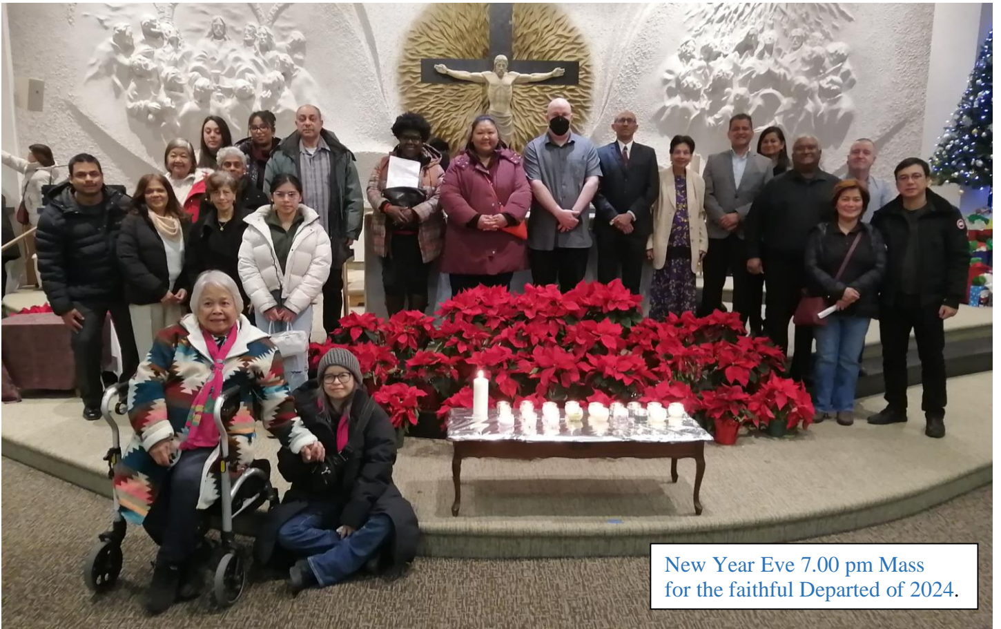
New Year Eve 7.00 pm Mass for the faithful Departed of 2024.