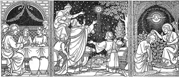
[ 1-r: Wedding at Cana ✦ Epiphany of the Magi ✦ Baptism at the Jordan ]