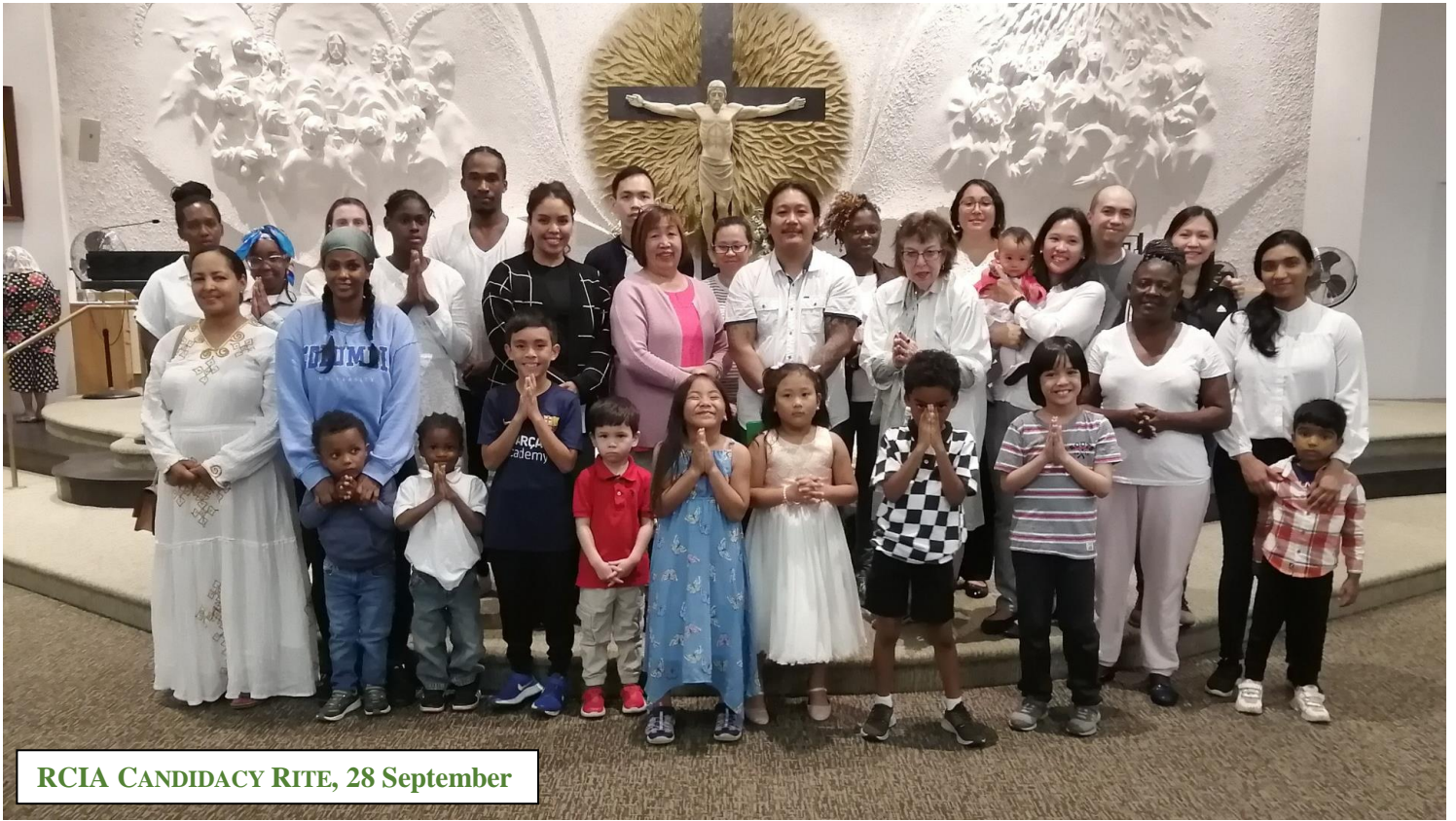
RCIA CANDIDACY RITE, 28 September