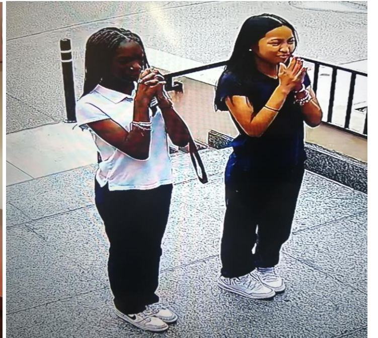
Praying after school.