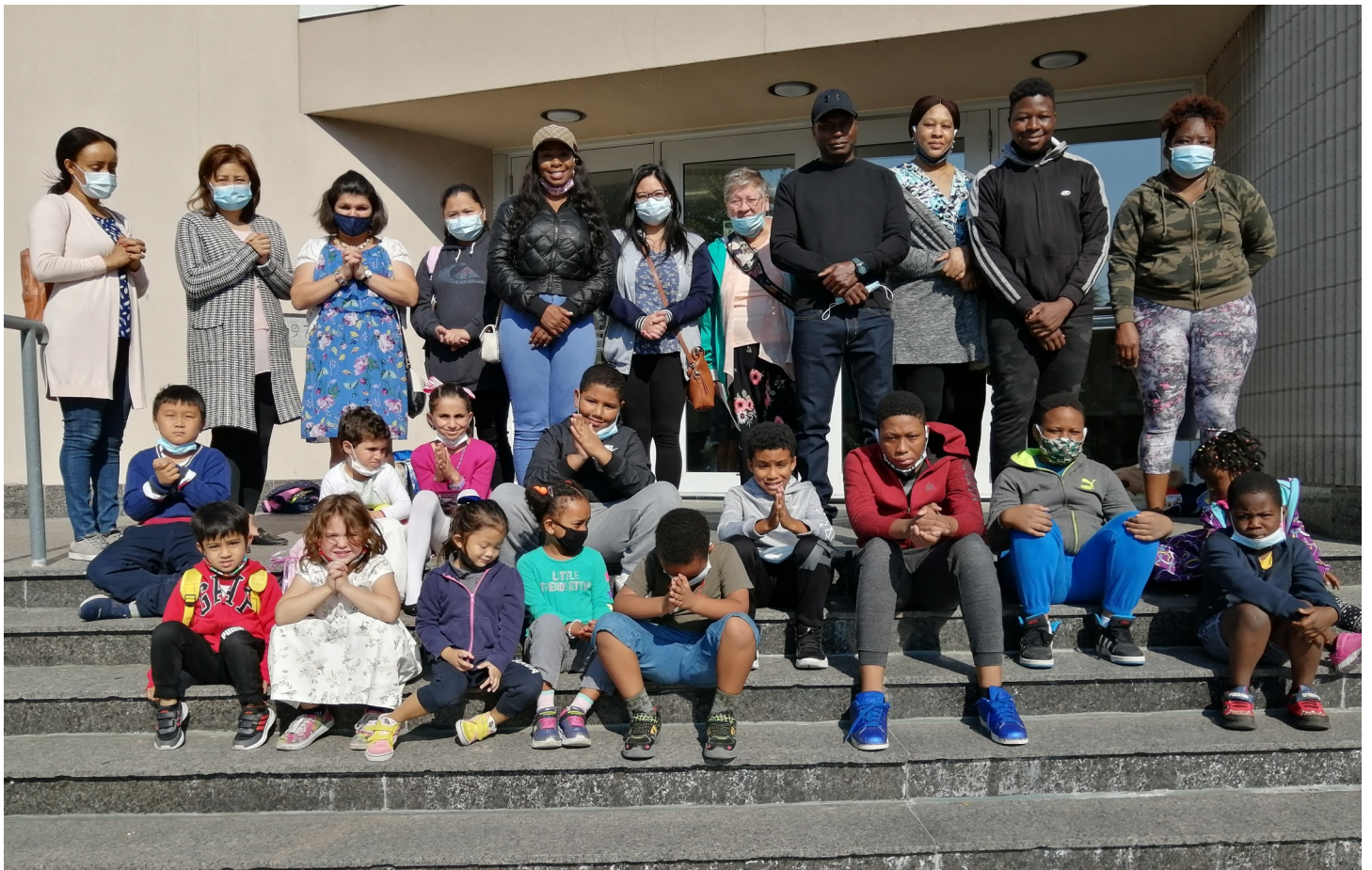
2 October 2021