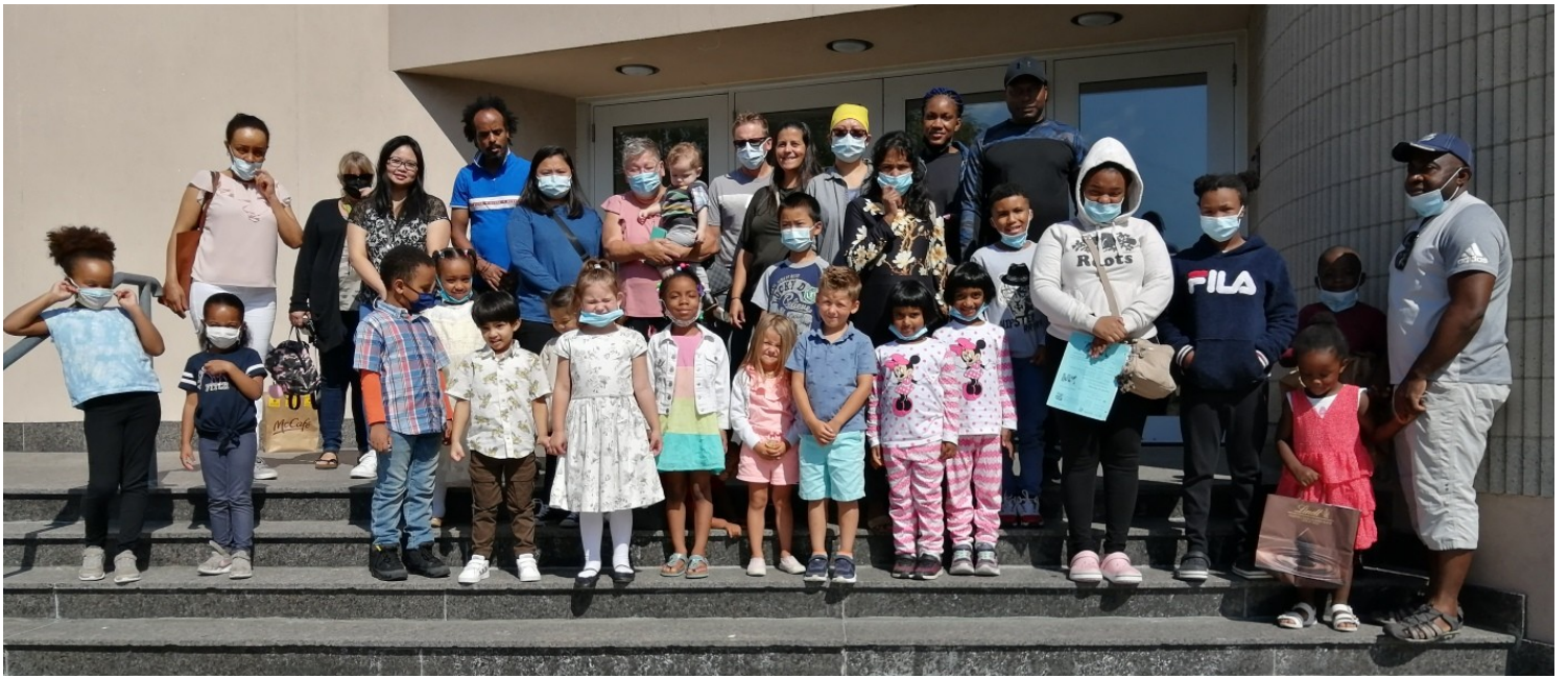
4 September 2021