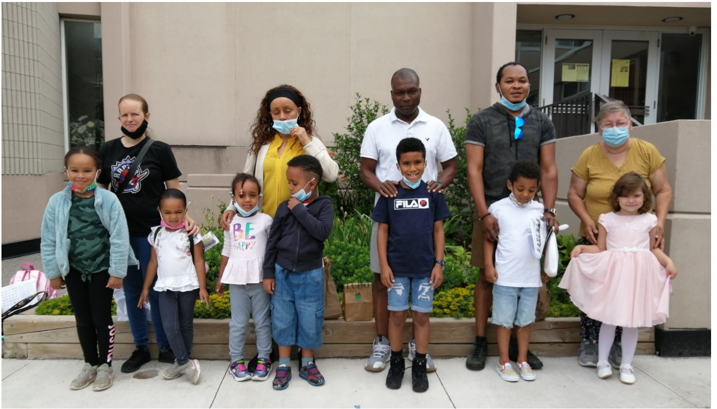
3 July 2021