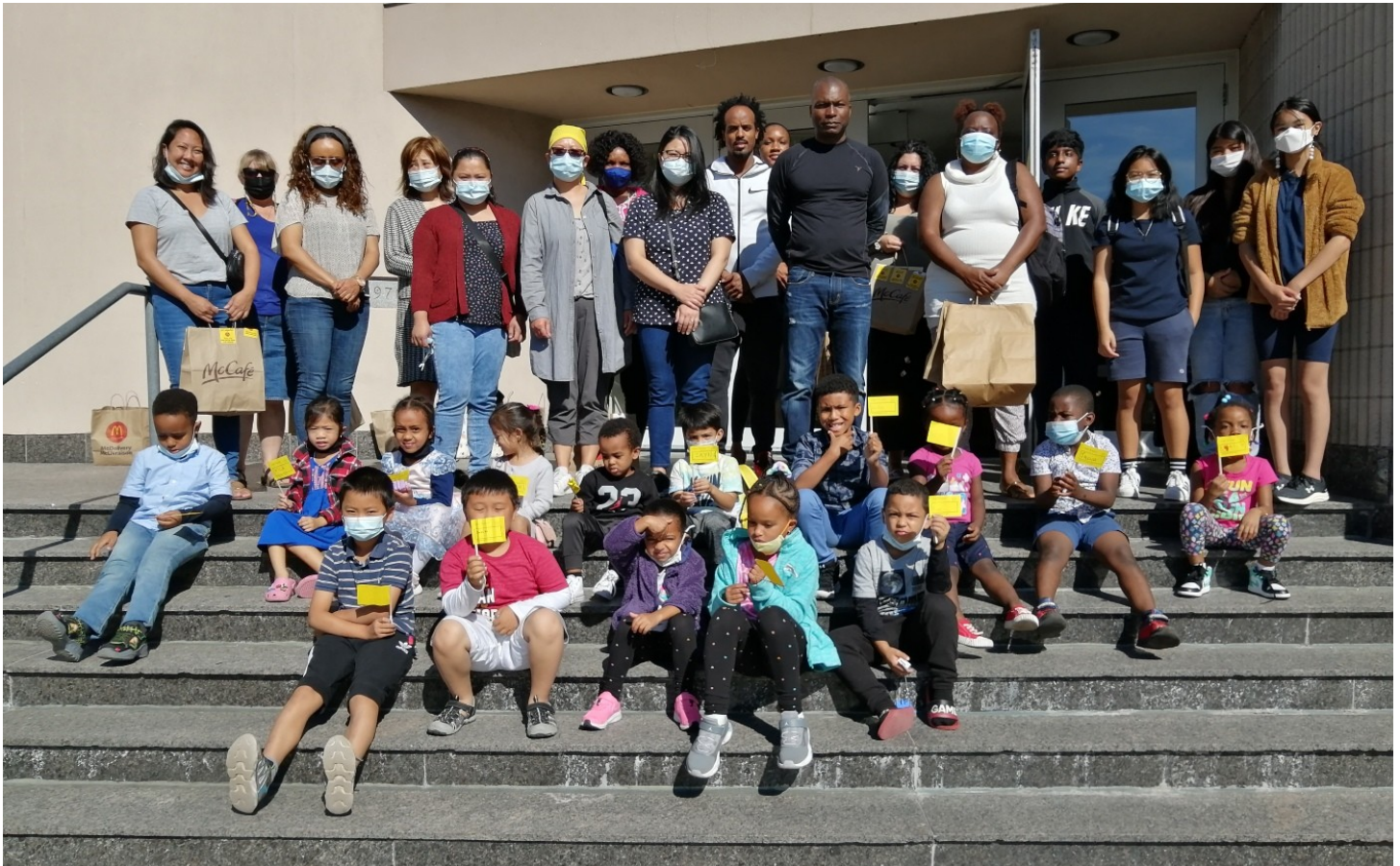
18 September 2021