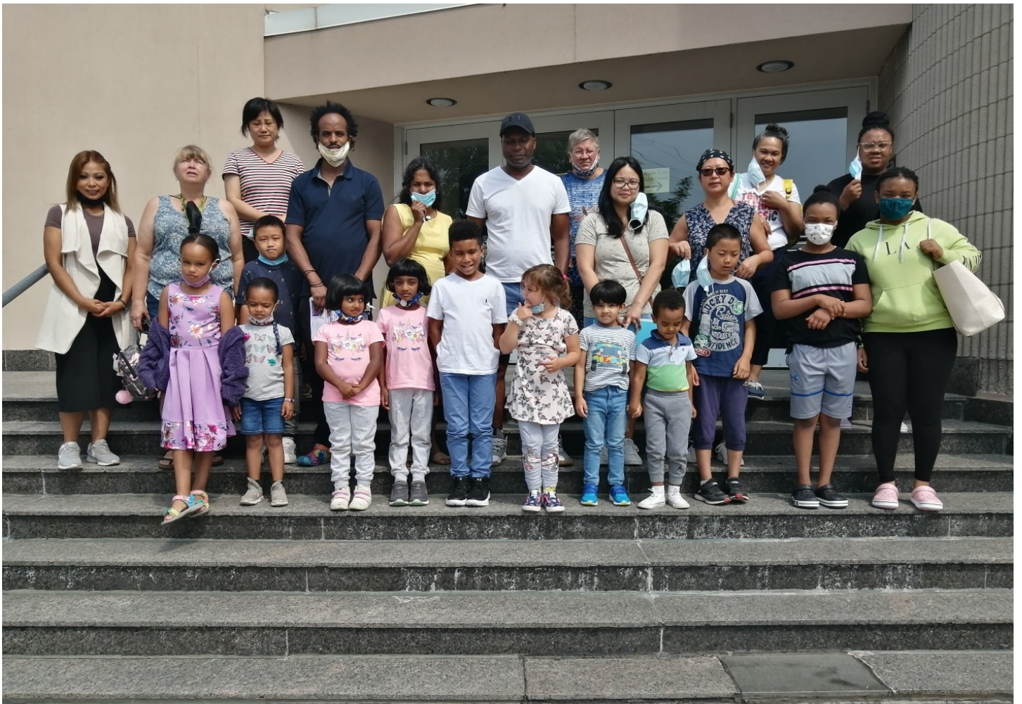
7 August 2021