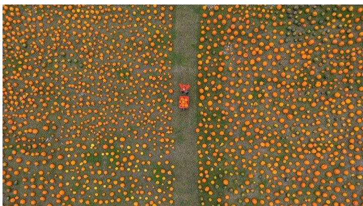
Pumpkin field in Nottinghamshire, UK

We offer our prayers and best wishes for His Excellency as he takes on this important role.