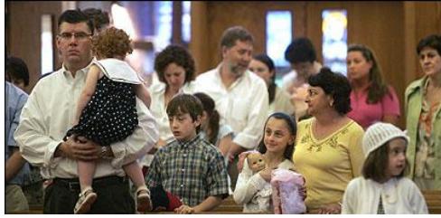
[ Parish Ministries: Sharing our gifts to build God's Kingdom. ]