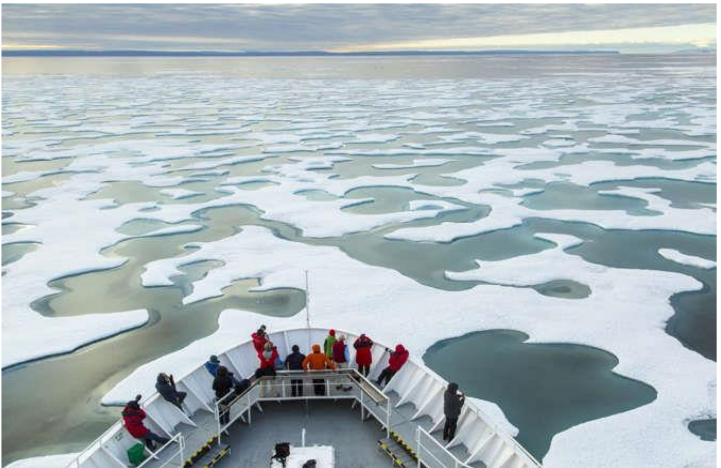
Tofino, British Columbia; Nunavut