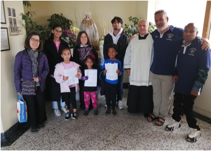
Sunday School for Kids, 13 October