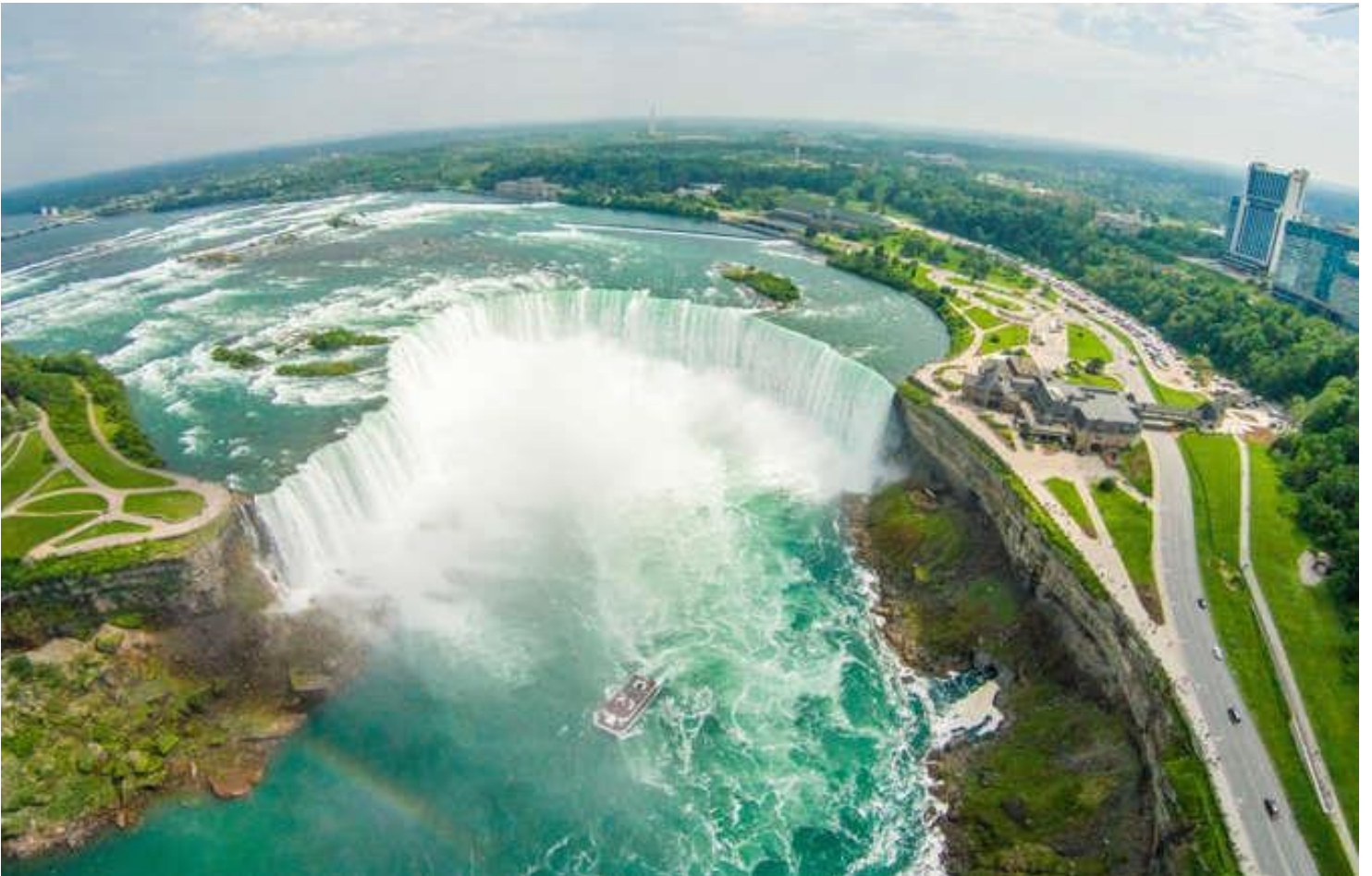
Light House, New Brunswick ; Niagara Falls, Ontario