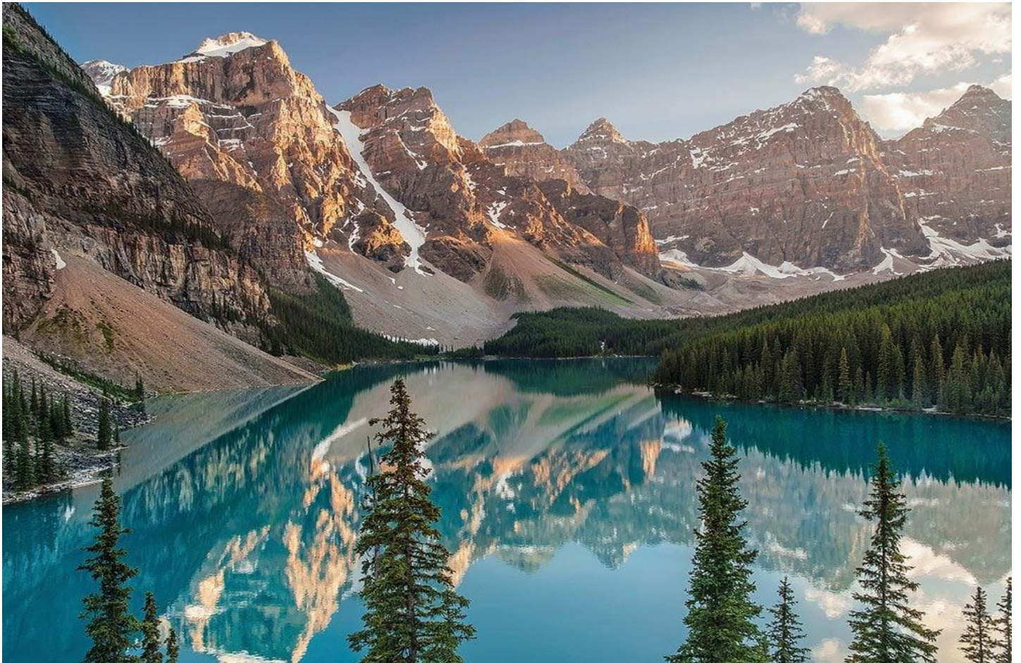
Parliament Hill, Ottawa, Ontario ; Lake Louise, Alberta