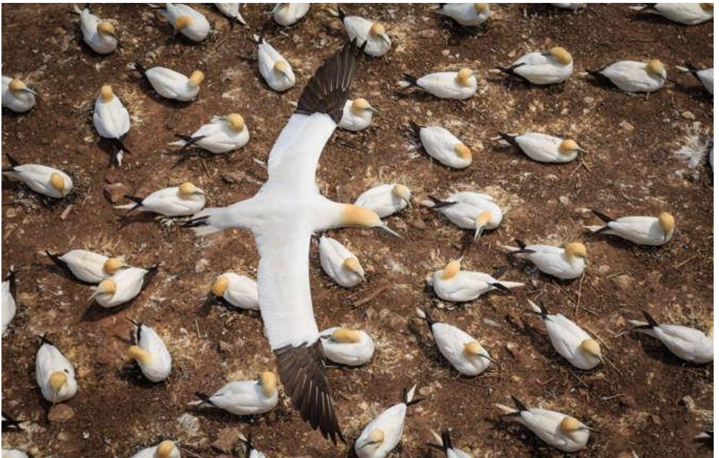
Downtown Toronto, Ontario ; Gull Island, Newfoundland