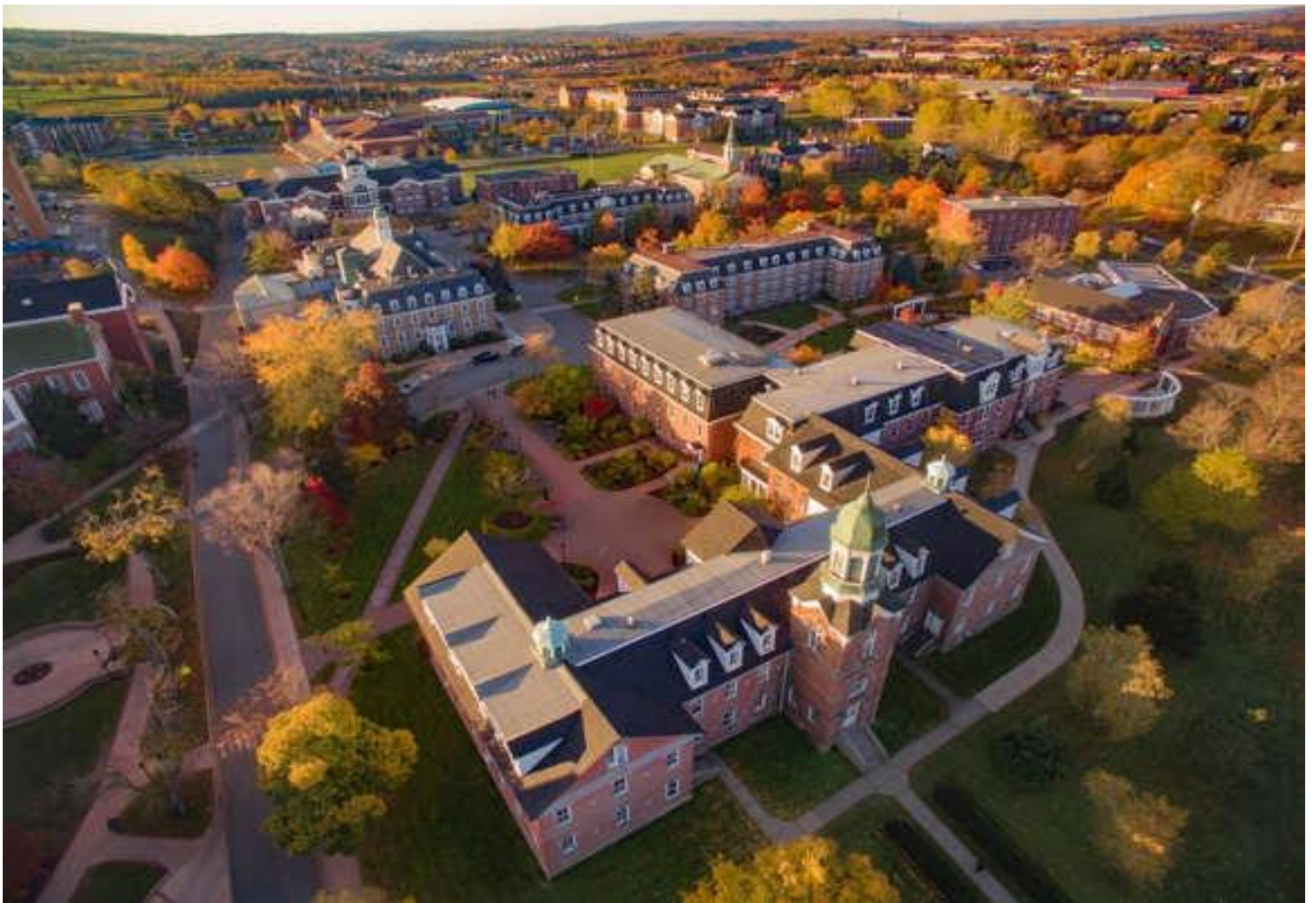
Harvesting wheat near Gravelbourg, Saskatchewan ;