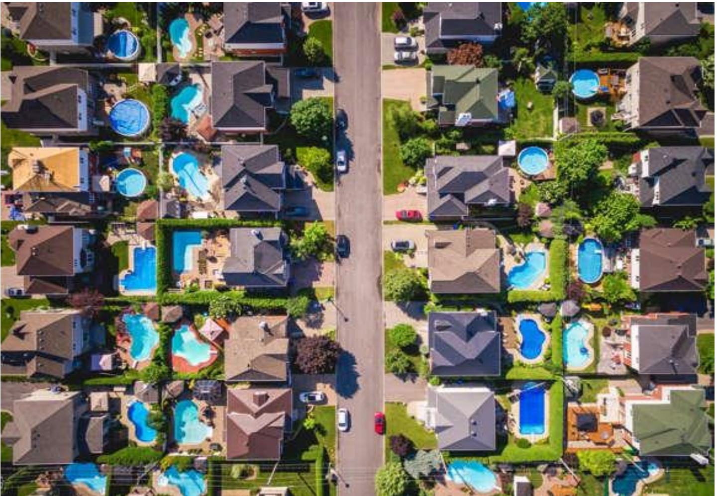
Miami grain elevators, Manitoba ; Pools in Montreal Quebec