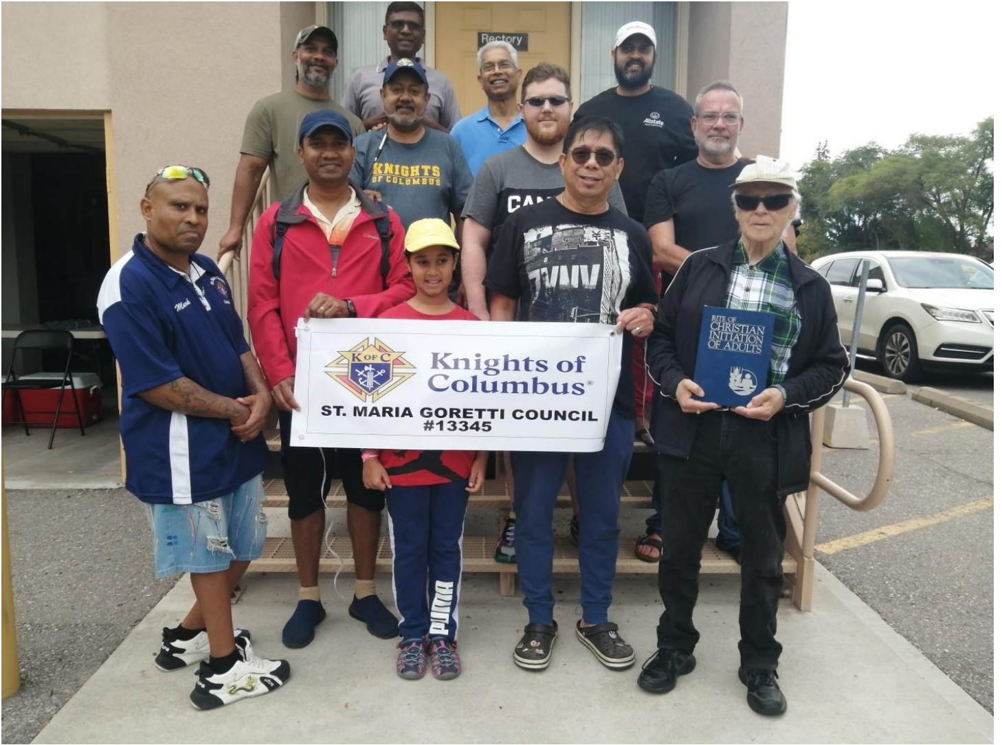
KOC Car Wash, 21 September