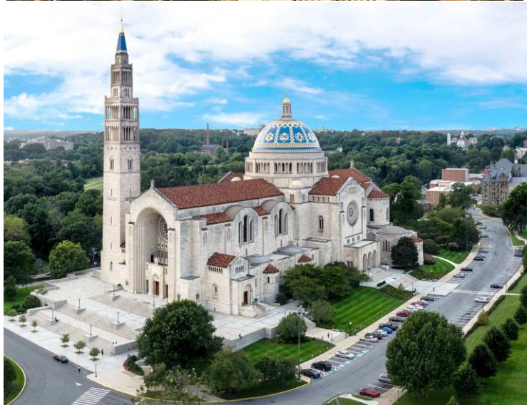
Top – bottom: Cabañas, El Salvador; Washington, D.C.