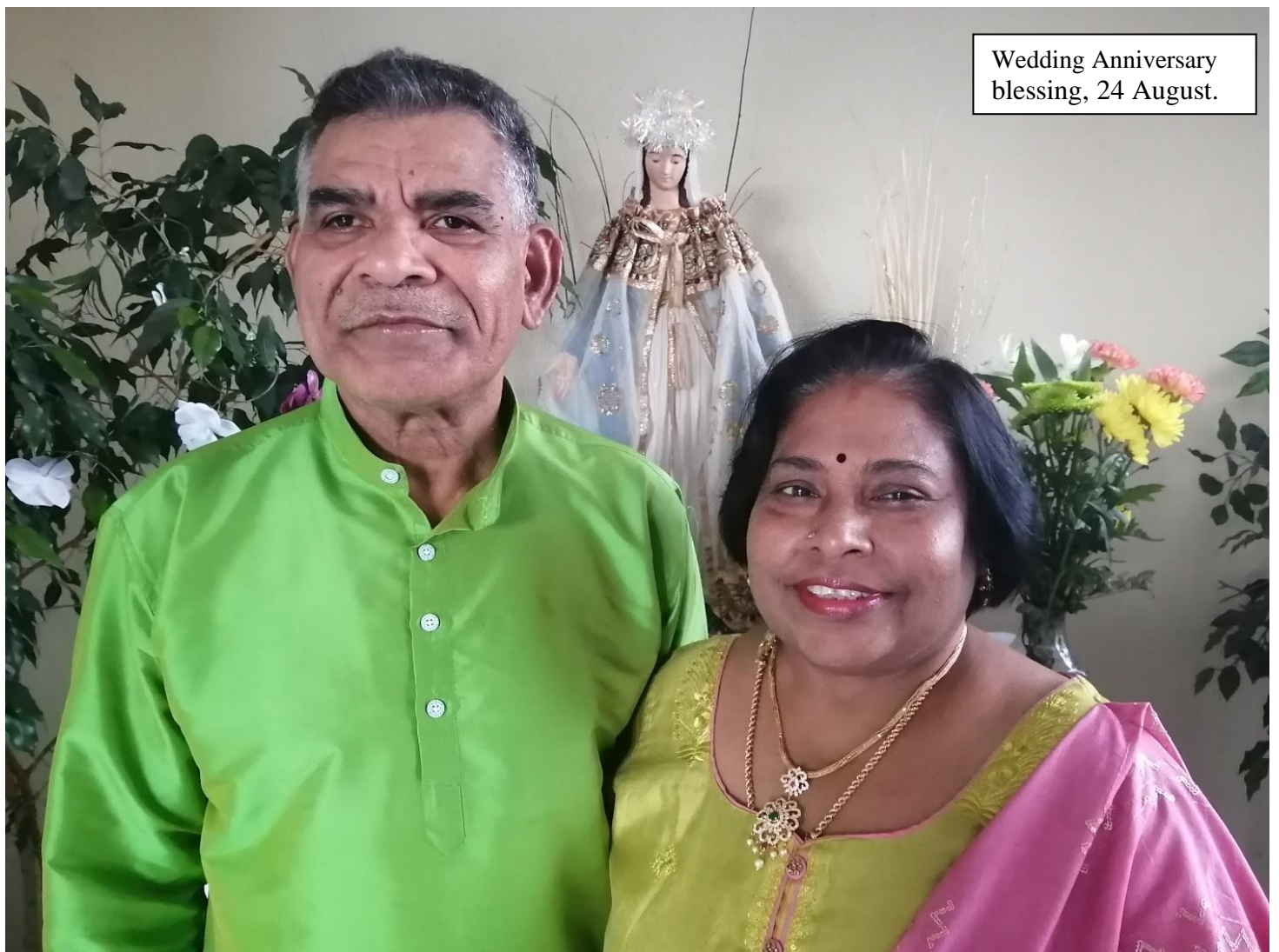
Wedding Anniversary blessing, 24 August.