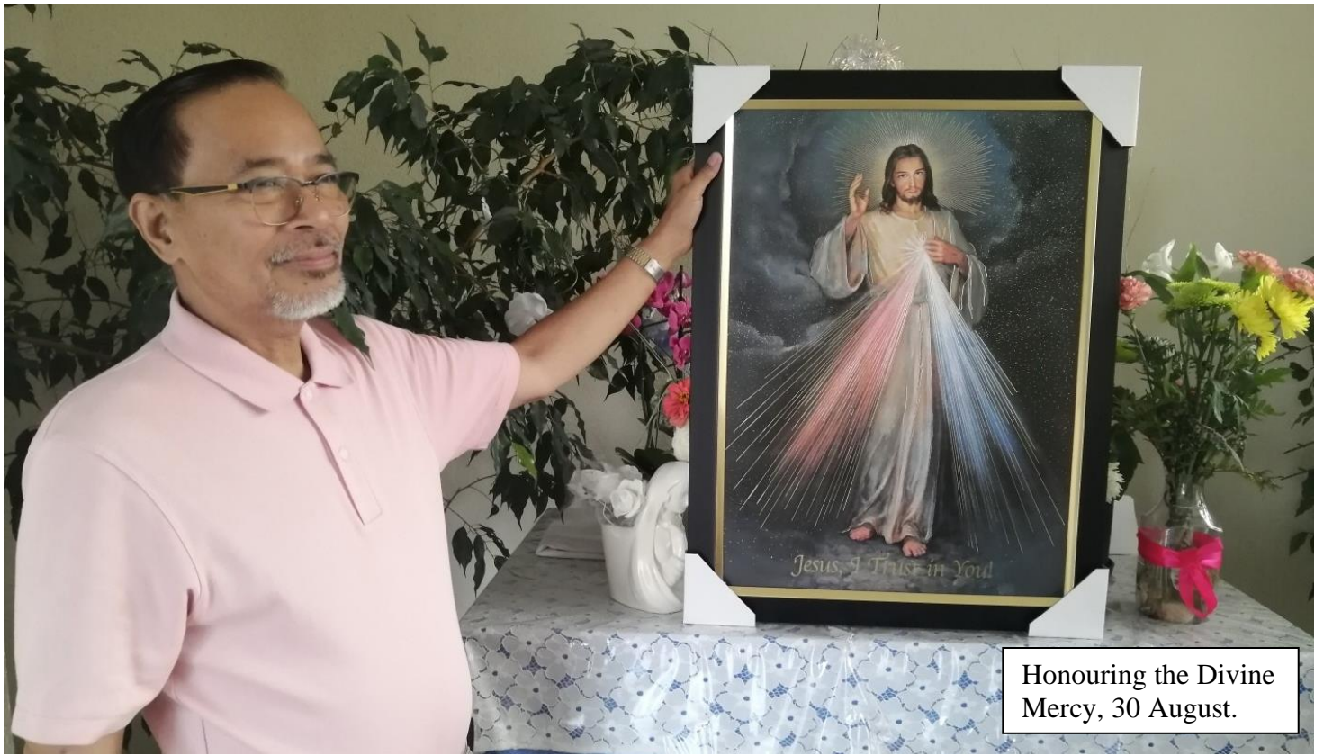
Honouring the Divine Mercy, 30 August.