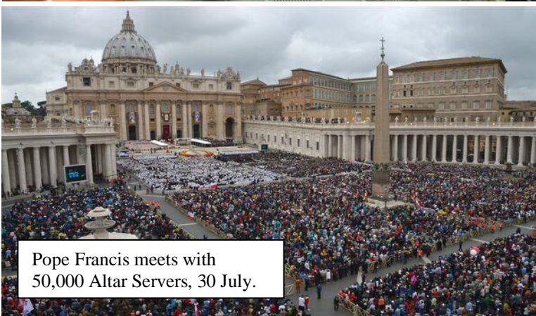
Pope Francis meets with 50,000 Altar Servers, 30 July.