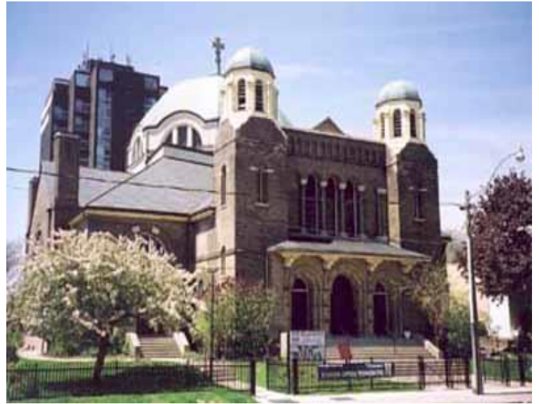
Toronto: St. Ann Anglican Church, destroyed by fire on 9 June.