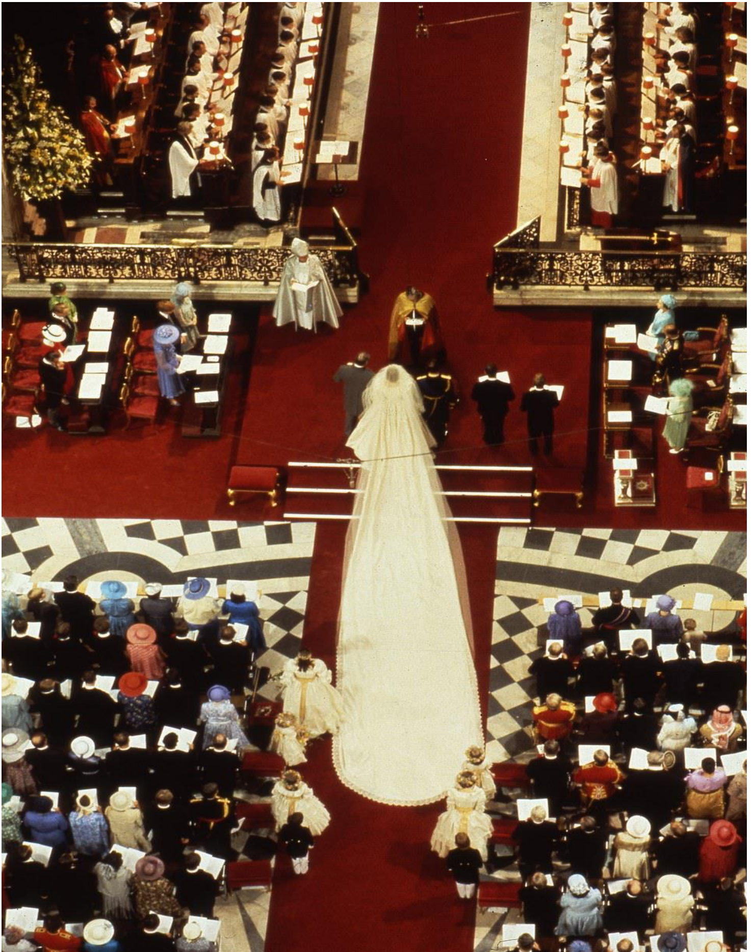
Wedding of Princess Diana and Prince Charles, 29 July 1981