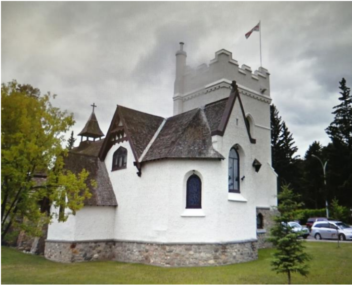
Jasper: St. Mary Anglican Church, destroyed by fire on 23 July.