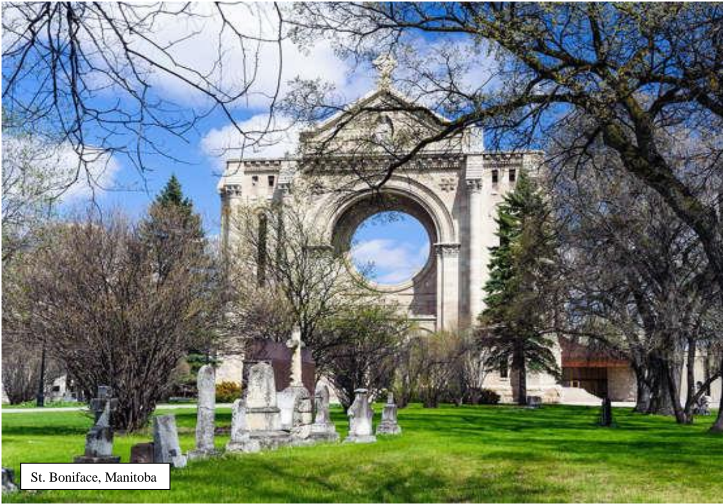
St. Boniface, Manitoba