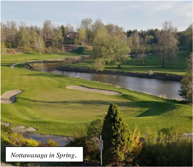
Nottawasaga in Spring.