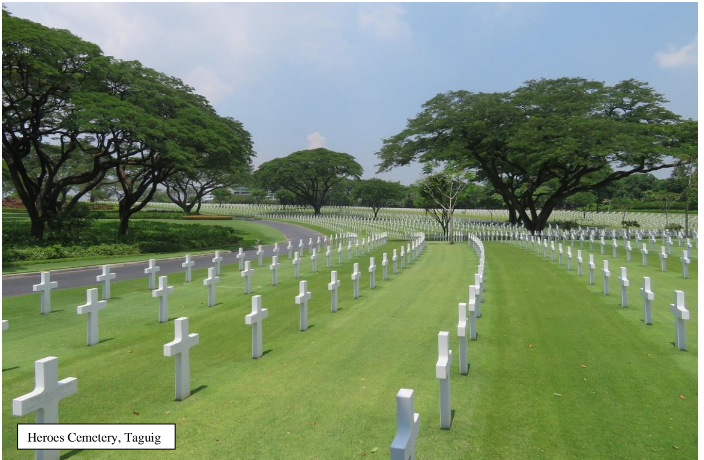
Heroes Cemetery, Taguig