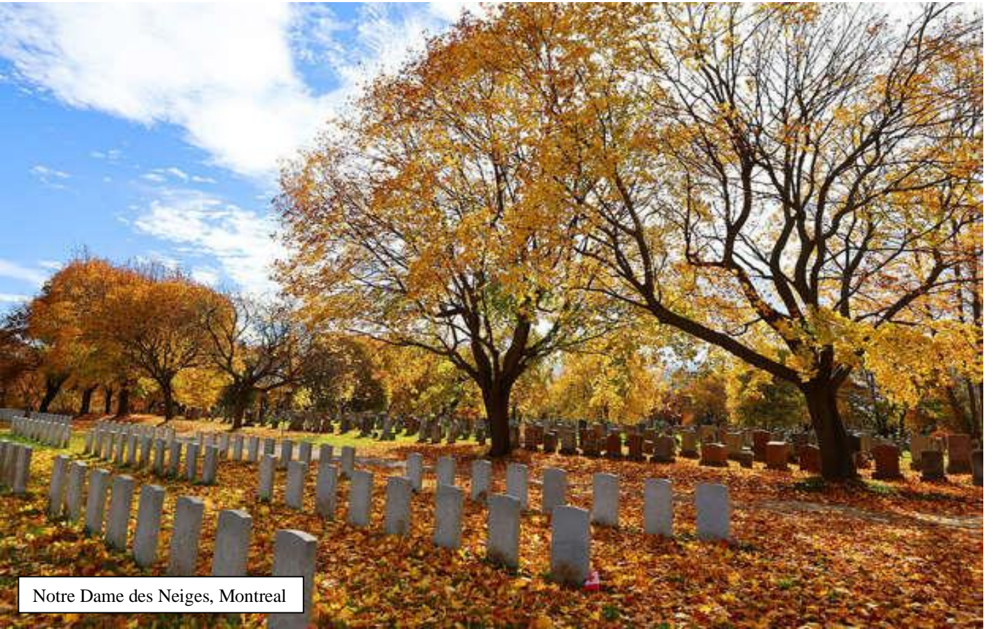
Notre Dame des Neiges, Montreal