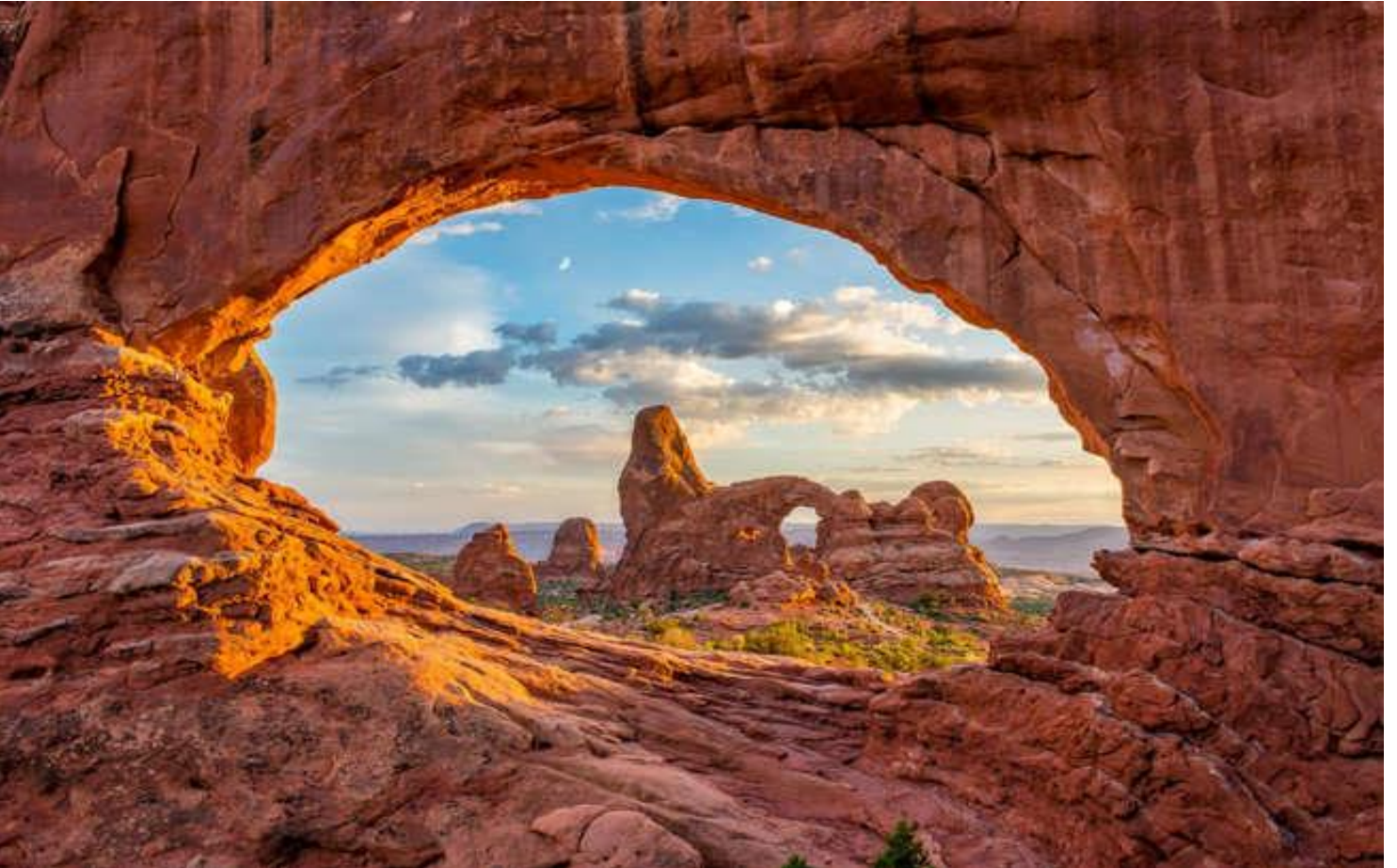
top: Bluffers Park, Scarborough