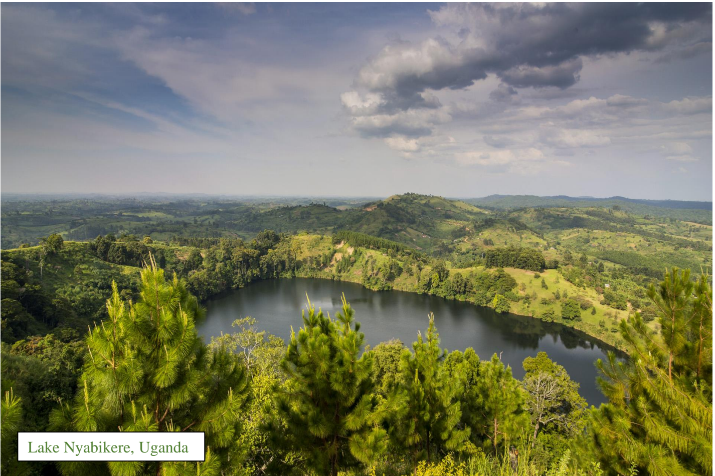
Lake Nyabikere, Uganda