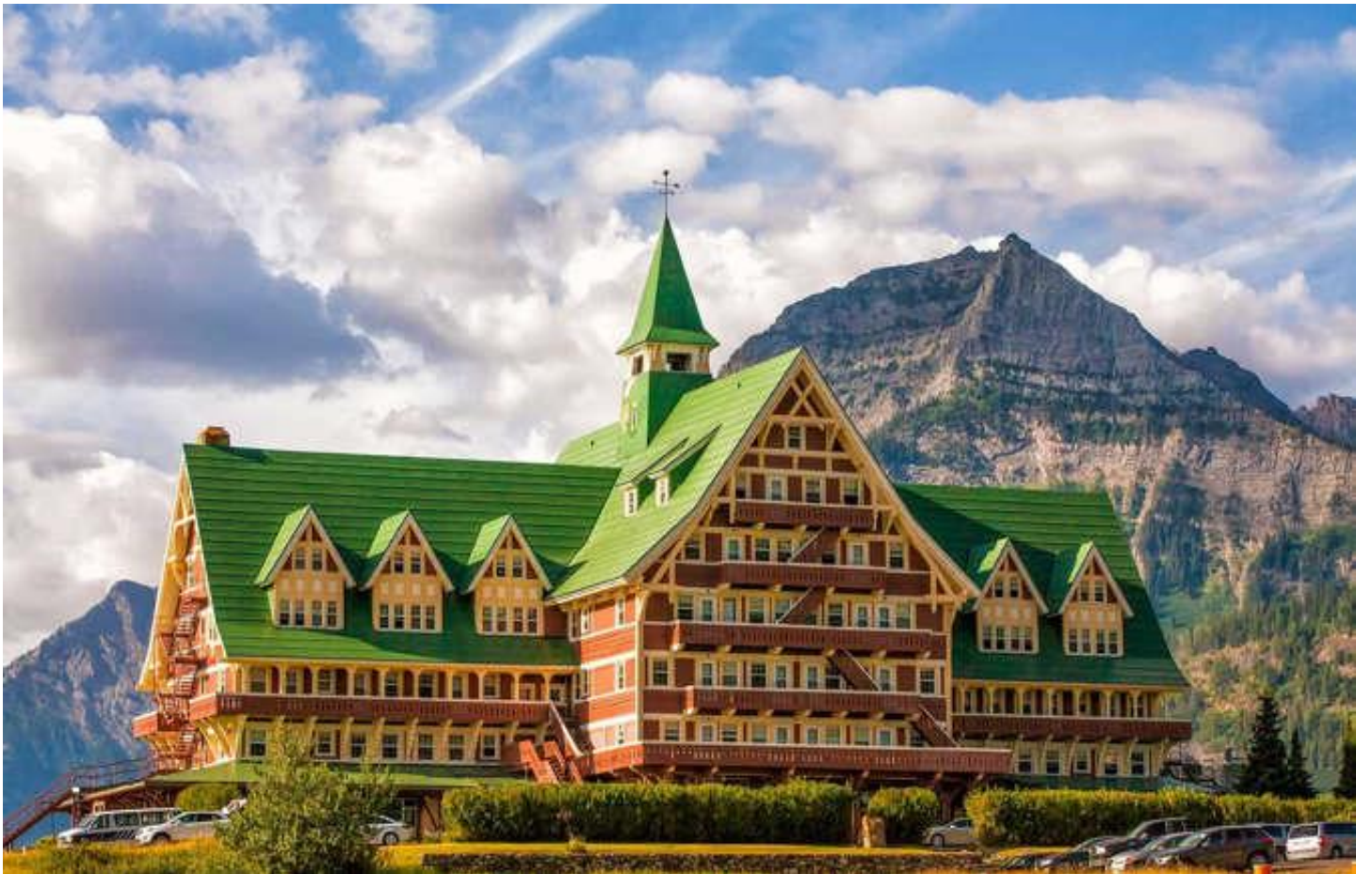
top: Thousand Islands bridge, Ontario