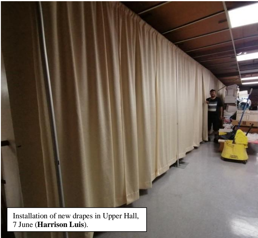
Installation of new drapes in Upper Hall, 7 June (Harrison Luis).