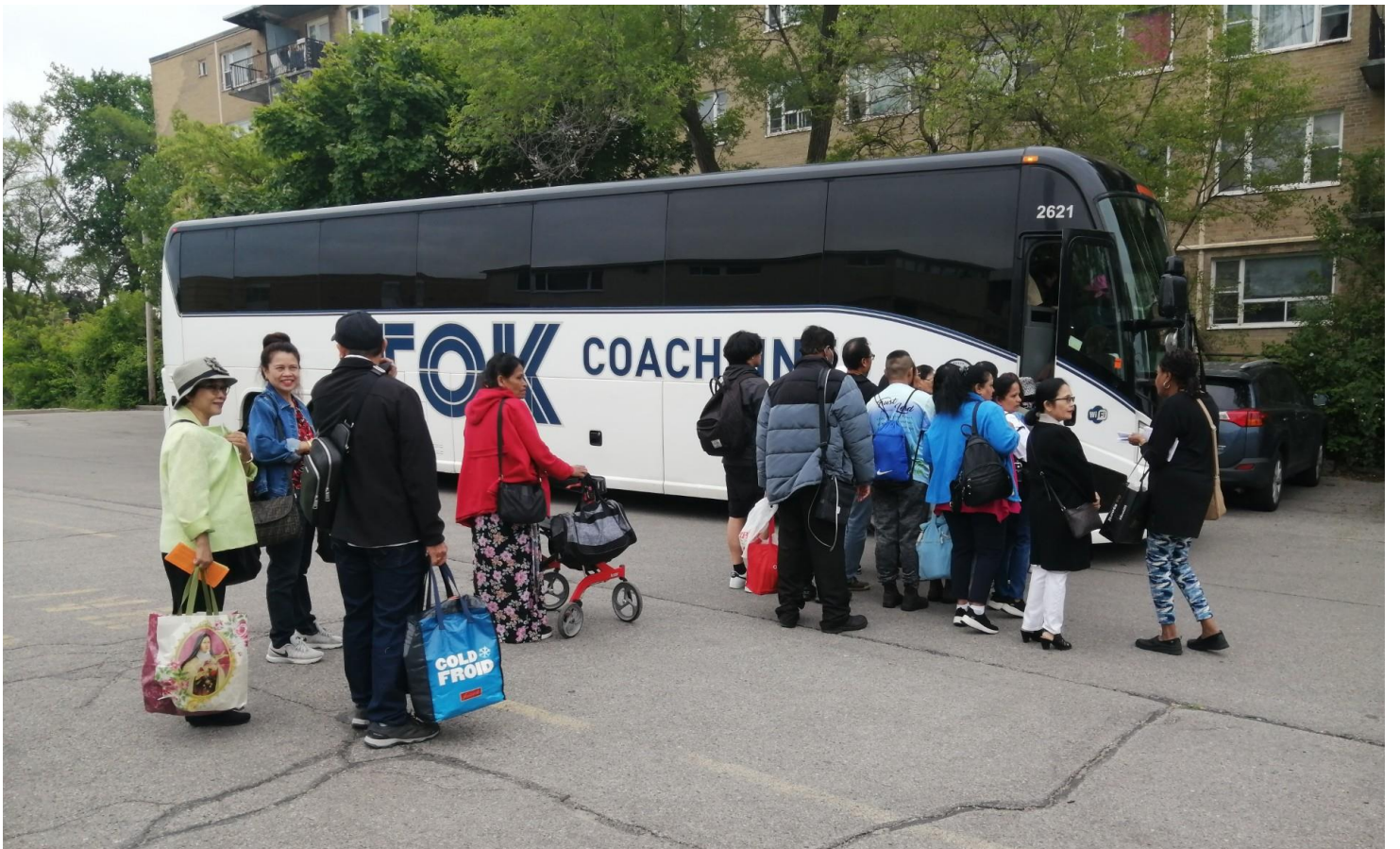
The CWL Buffalo trip, 2 June.