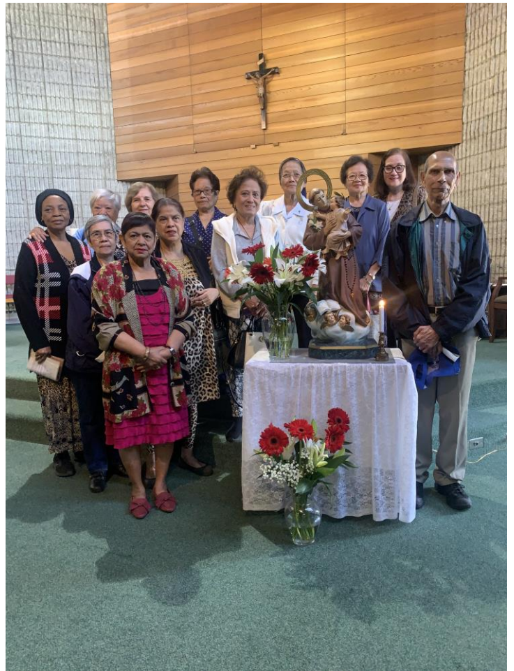
St. Anthony Group, St. John XXIII Church, Flemington Park.