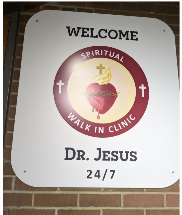
Epiphany of Our Lord Church, Scarborough.