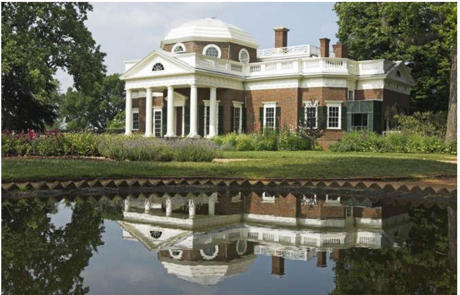
Taj Mahal, Agra, India; Monticello, Virginia