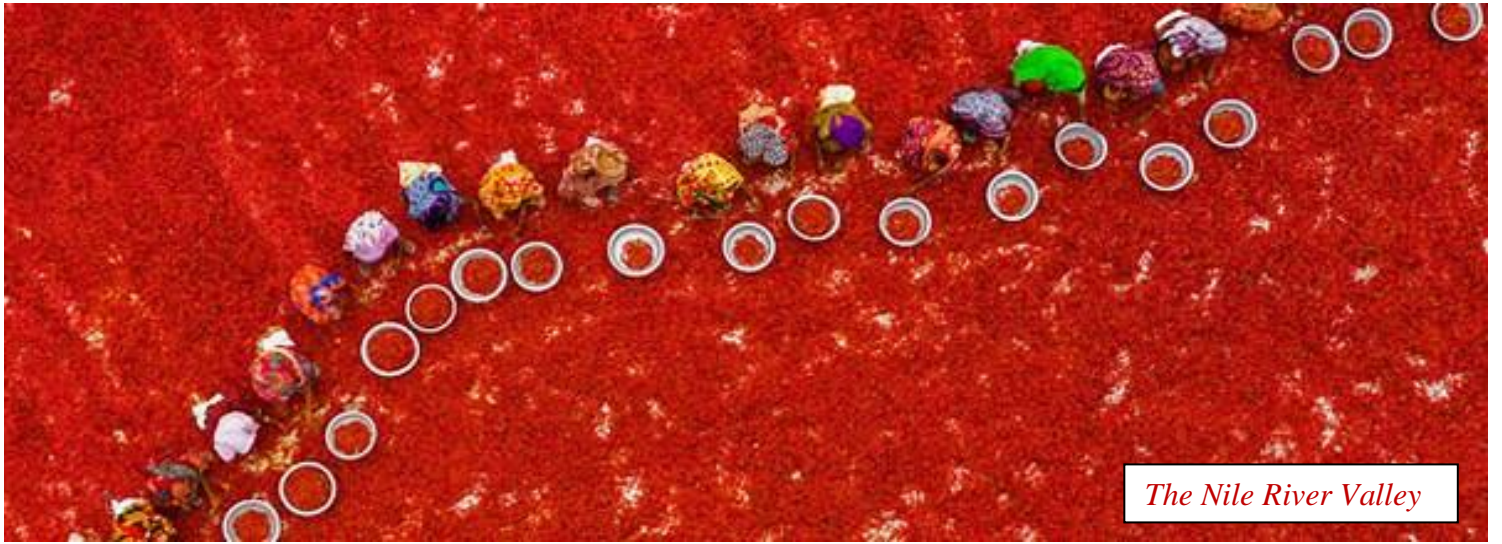
The Nile River Valley