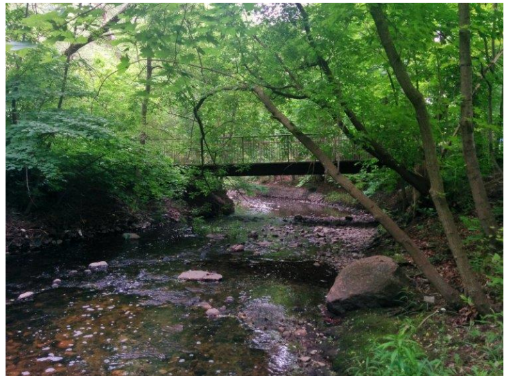
Hudson, Nile, Danube, Amazon, Massey Creek.