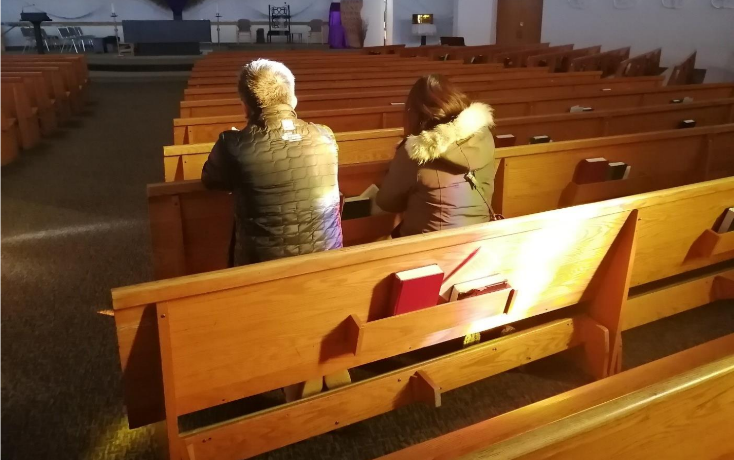
Office Team, 24 March.