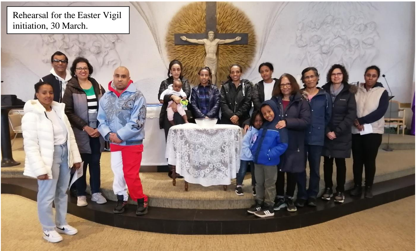
Rehearsal for the Easter Vigil initiation, 30 March.