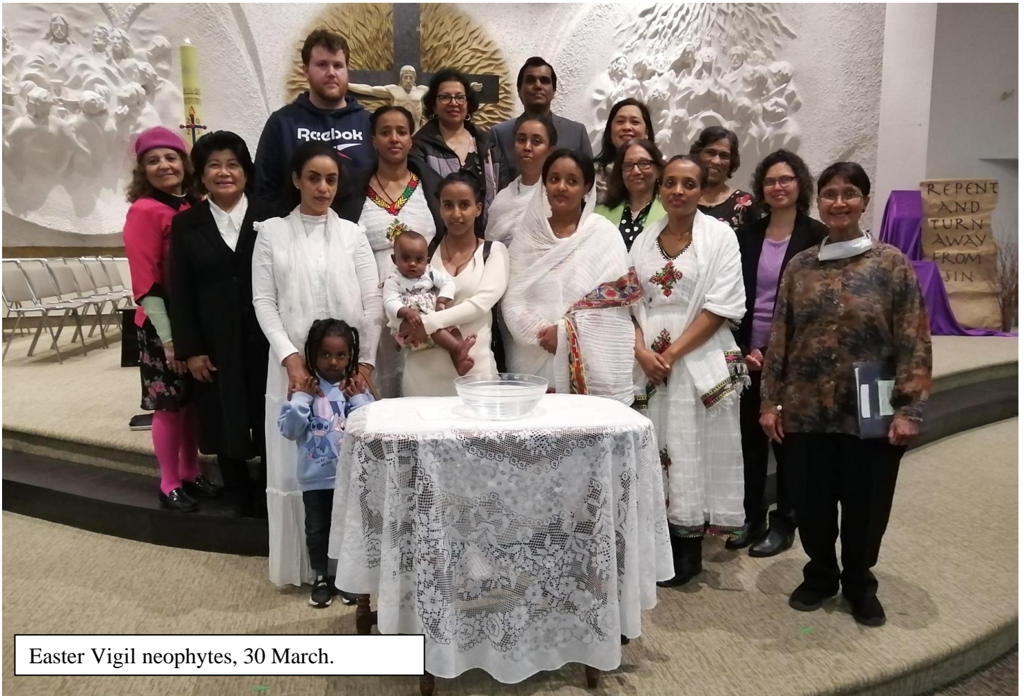
Easter Vigil neophytes, 30 March.