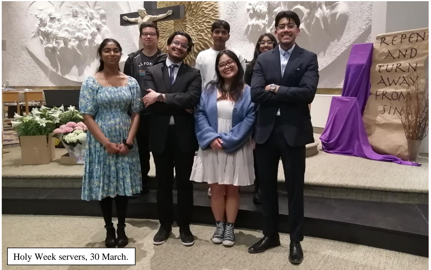
Holy Week servers, 30 March.