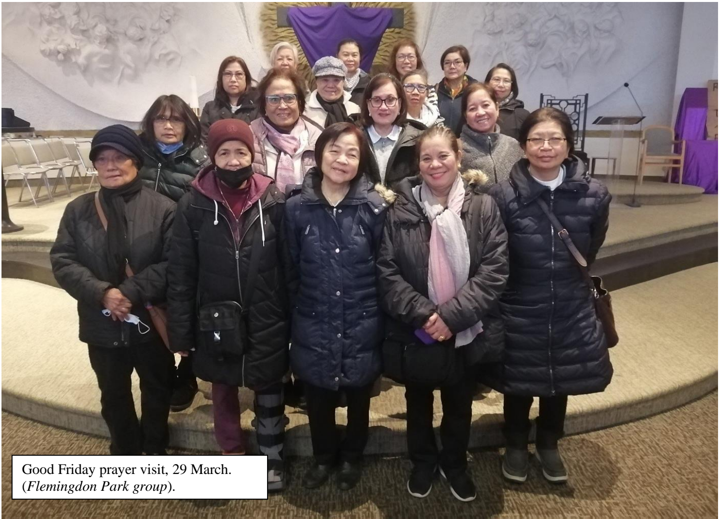
Good Friday prayer visit, 29 March. (Flemington Park group).